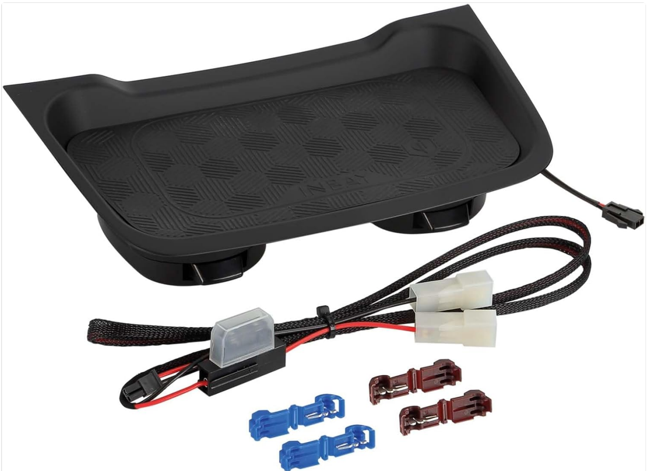
Inbay 241023-54-1 Qi Wireless Charging Compartment with included wiring harness and connectors.