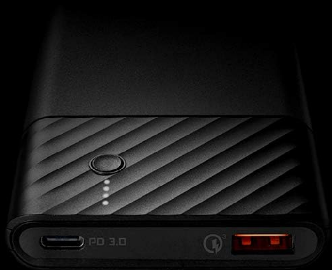
Image: Demonstrating fast charging with the power bank.

Enjoy an 18W charge for iPhone, Galaxy, iPads and more.