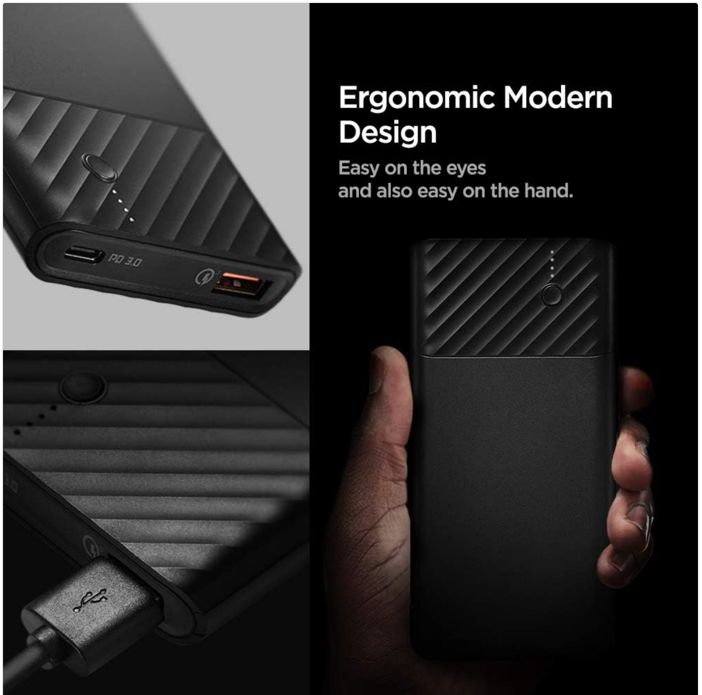
Image: Detail of the ergonomic and modern design of the power bank.