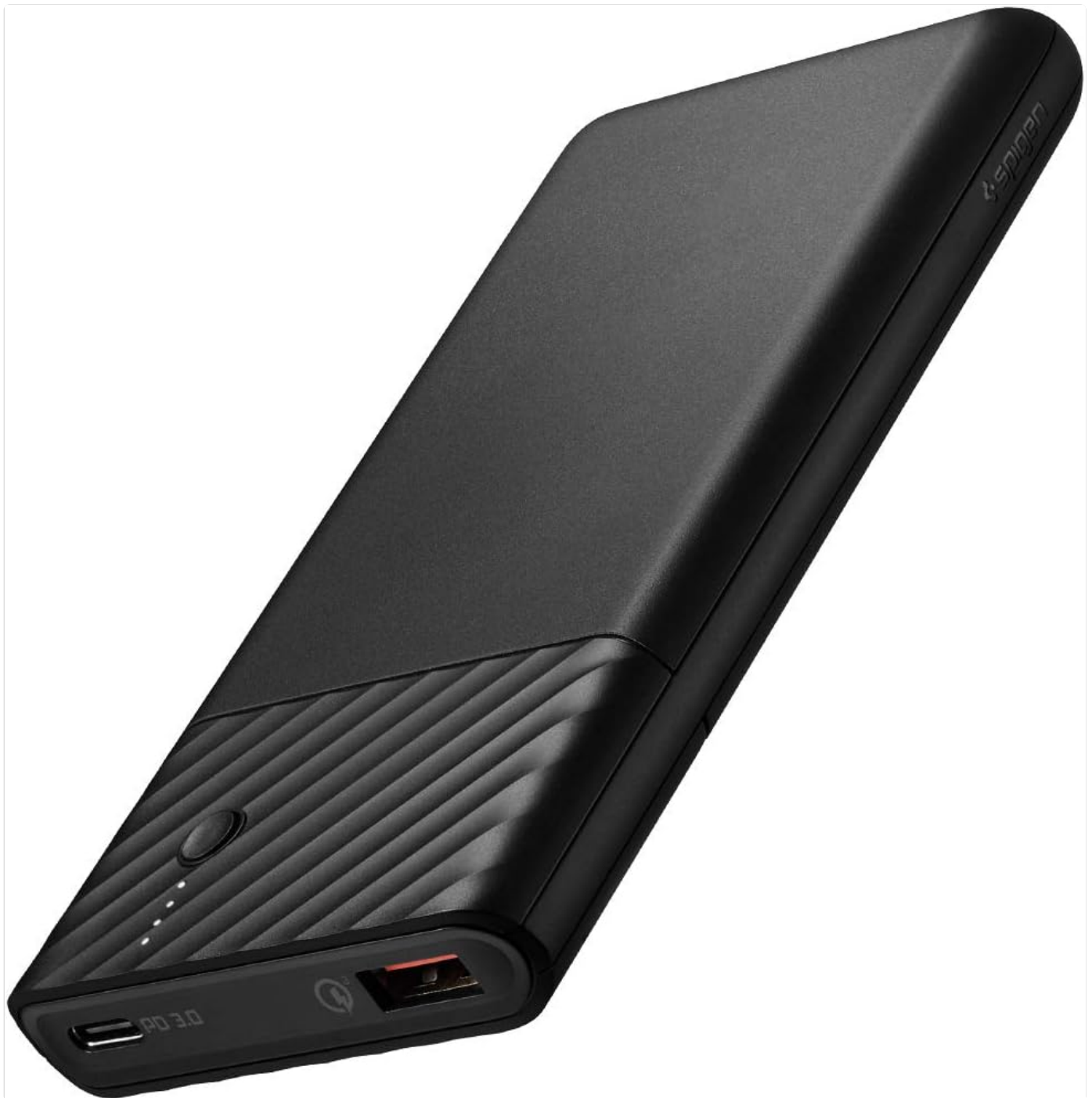
Image: Front view of the Spigen PocketBoost Power Bank.