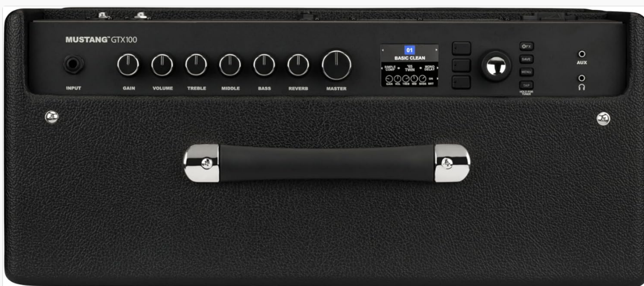
Figure 3: Top panel controls of the Fender Mustang GTX100 Amplifier. This image displays the input, aux, headphone jacks, gain, volume, tone controls (treble, middle, bass), master volume, and the digital display with navigation buttons.