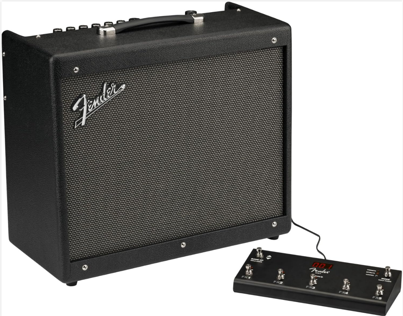
Figure 1: Fender Mustang GTX100 Amplifier with 7-Button Footswitch. The amplifier is black with a silver Fender logo, and the footswitch is connected via a cable.