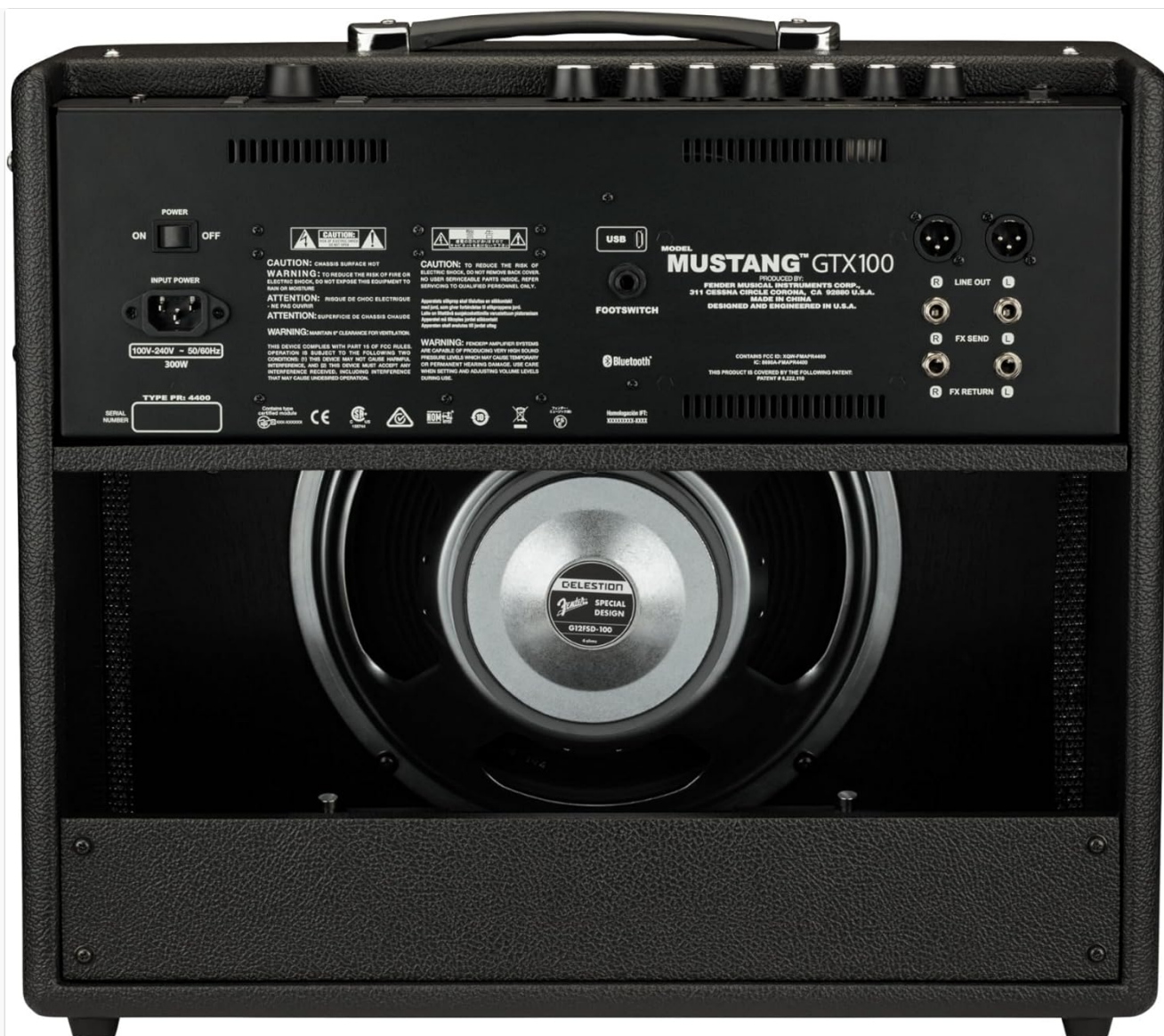
Figure 2: Rear panel connections of the Fender Mustang GTX100 Amplifier. This view highlights the power input, footswitch jack, stereo XLR line outputs, and effects loop (FX Send/Return).