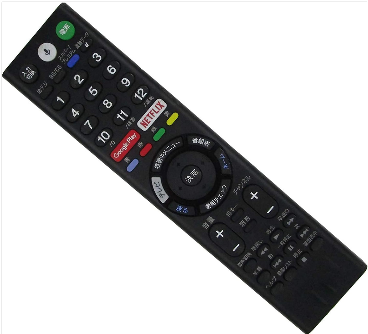
Figure 2: Front view of the remote control.