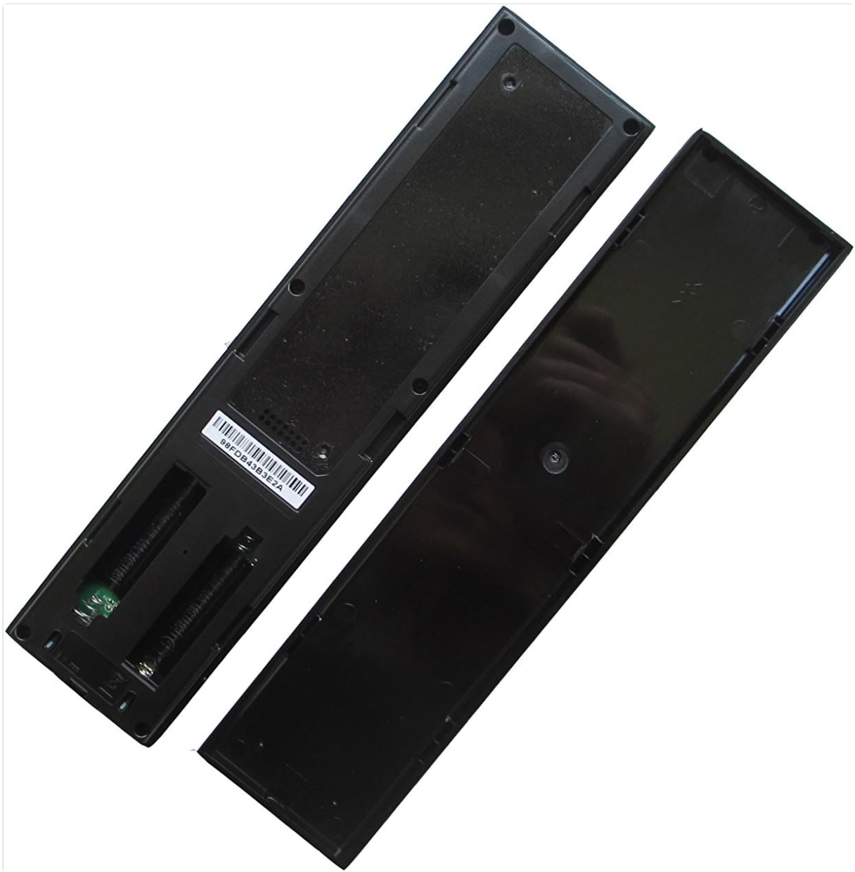
Figure 1: Battery compartment with cover removed.