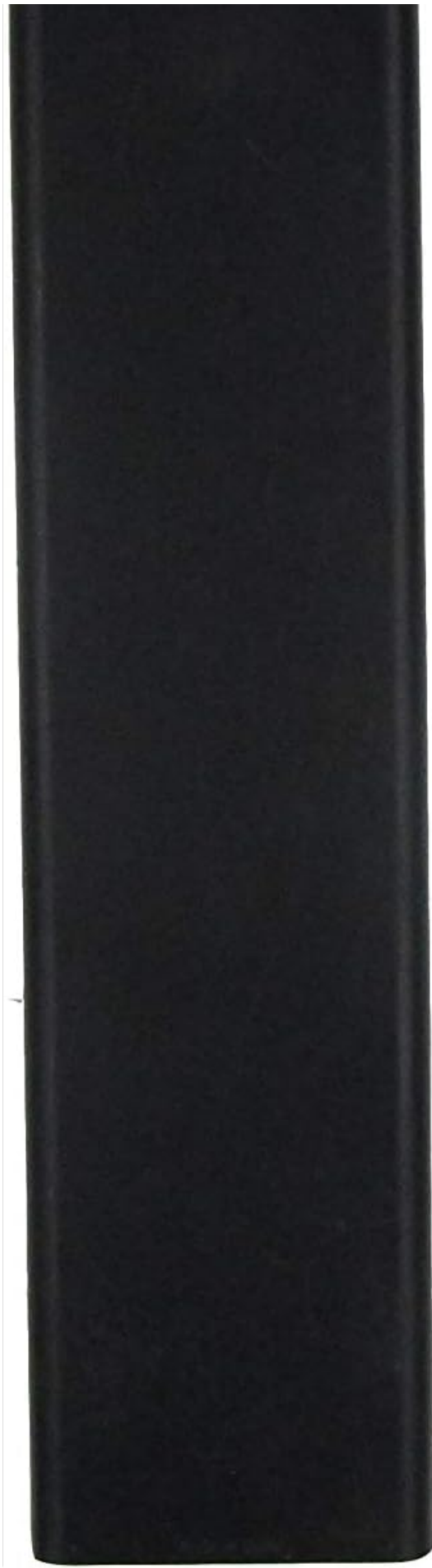
Figure 3: Side profile of the remote control.