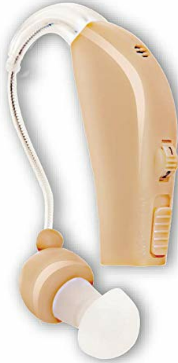
Image: The Personal Sound Amplifier placed on its recharging station. The charging indicator light is visible.