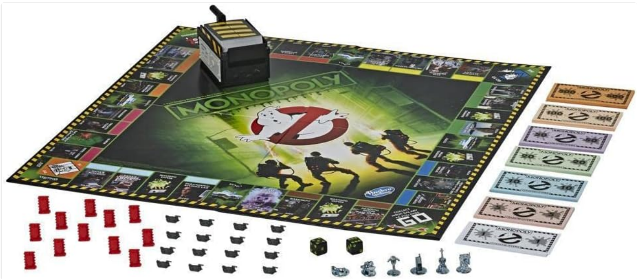
This image displays the complete Monopoly Ghostbusters Edition game, showcasing the board, character tokens, custom game money, dice, Ghost Traps (red pieces), and Containment Units (black pieces) ready for play.