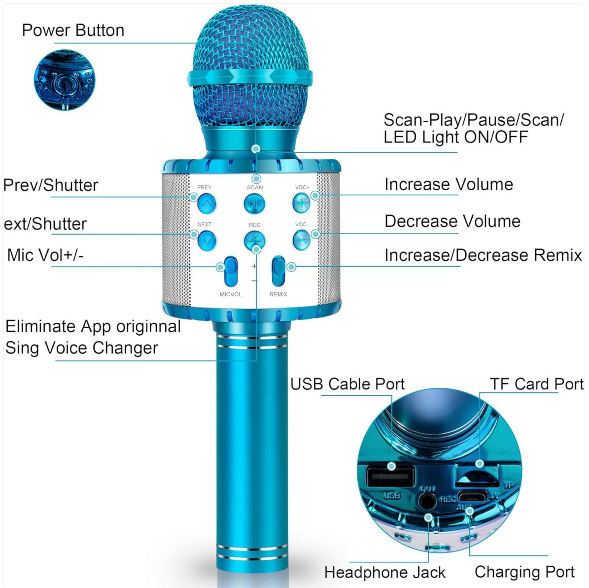
Image: Detailed view of the microphone's buttons and ports, explaining their functions for setup and use.