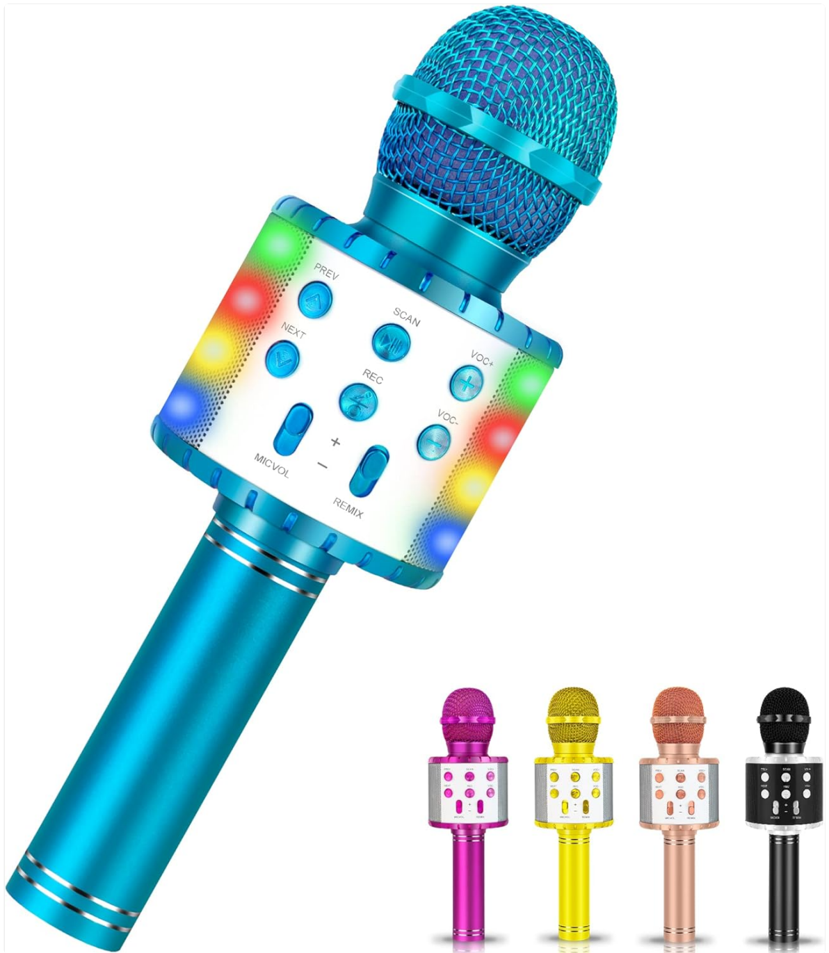
Image: The Winique Karaoke Machine, showcasing its blue color and integrated LED lights.