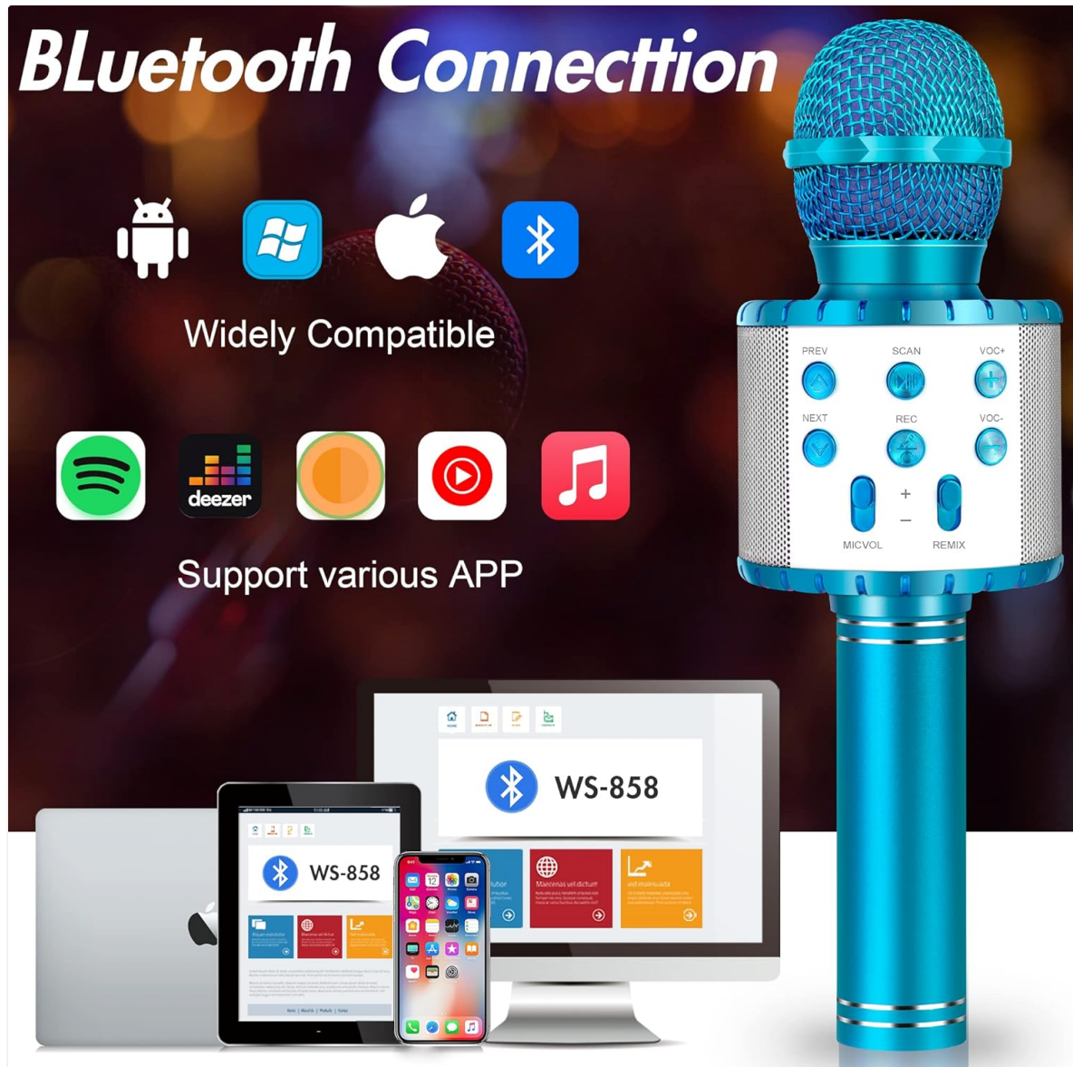
Image: Diagram illustrating the Bluetooth connection process with various devices.

5. TF Card Playback: Insert a TF (Micro SD) card into the designated slot to play music directly from the card.