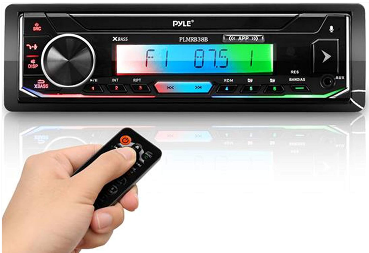
Image: Front view of the Pyle PLMRB38B.5 marine receiver, showcasing the digital LCD display, control buttons, and a remote control for convenient operation.