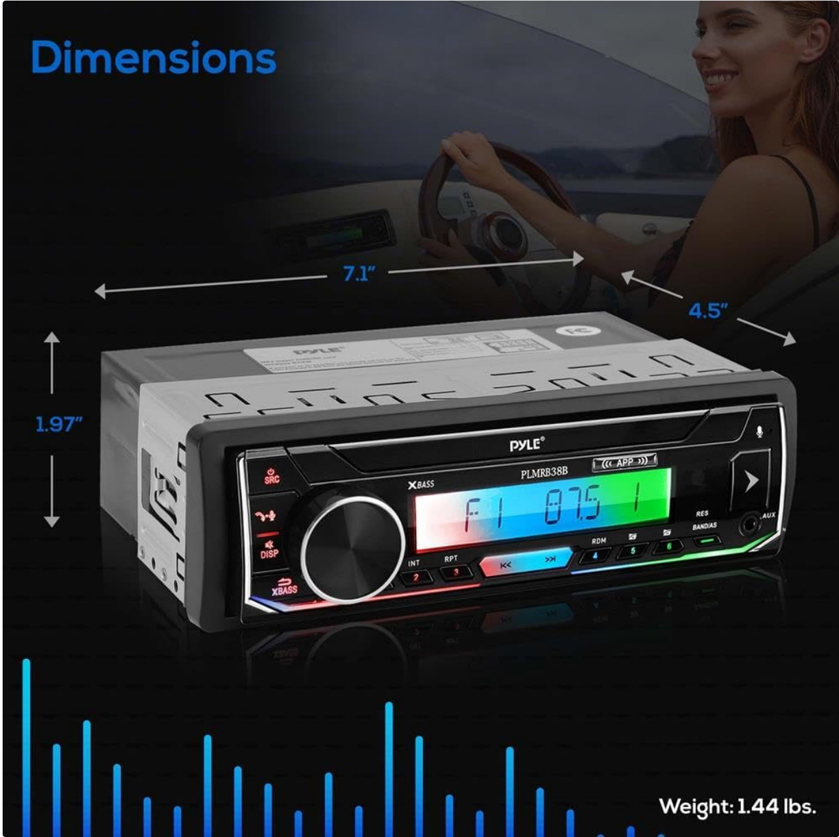
Image: Diagram illustrating the dimensions of the Pyle PLMRB38B.5 marine receiver, measuring 7.1 inches in width, 1.97 inches in height, and 4.5 inches in depth, with a weight of 1.44 lbs.