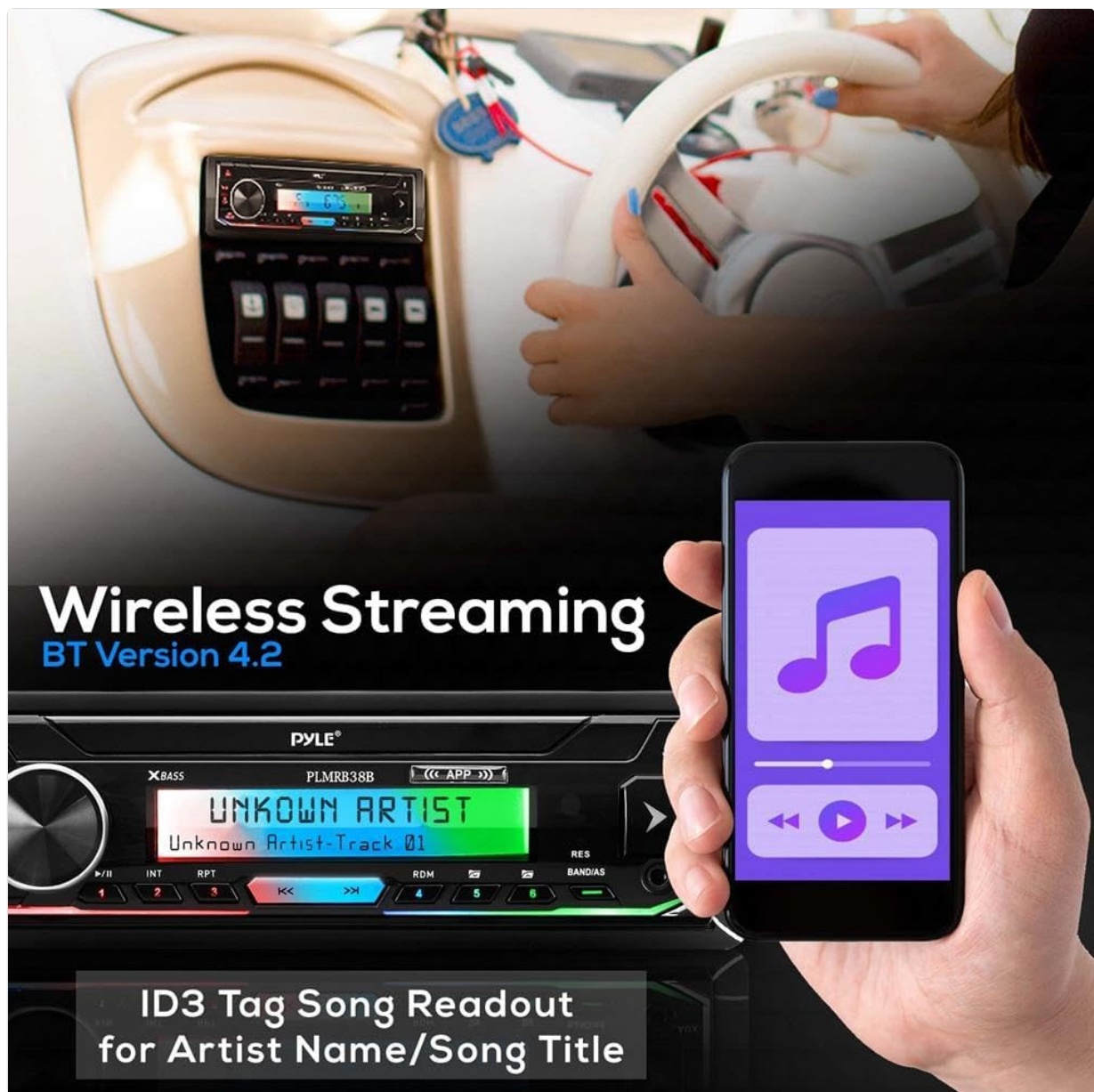
Image: The receiver's display showing ID3 tag information ('UNKOWN ARTIST', 'Unknown Artist - Track 01') during Bluetooth wireless streaming, with a smartphone in the foreground.

The PLMRB38B.5 features Bluetooth Wireless Audio Ability (BT Version 4.2) for streaming music from compatible devices.