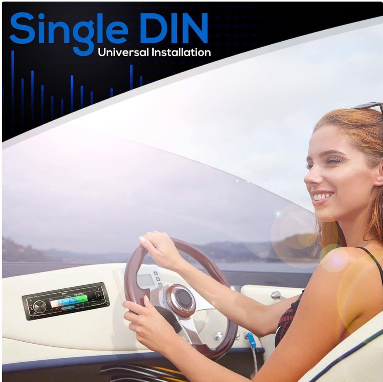
Image: The Pyle PLMRB38B.5 marine receiver seamlessly integrated into a boat's dashboard, demonstrating its universal Single DIN installation compatibility.

The PLMRB38B.5 features a universal Single DIN size design for easy installation into most marine vehicle dashboards. Consult a professional installer if you are unsure about the installation process.