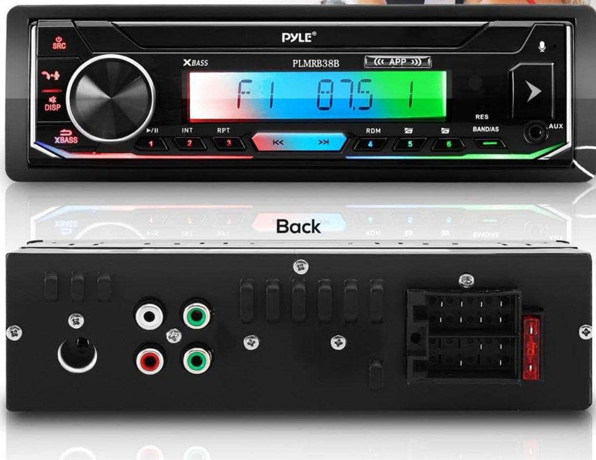
Image: Front and rear views of the Pyle PLMRB38B.5 marine receiver. The front panel displays the LCD and controls, while the rear panel shows the wiring harness and RCA output connections.