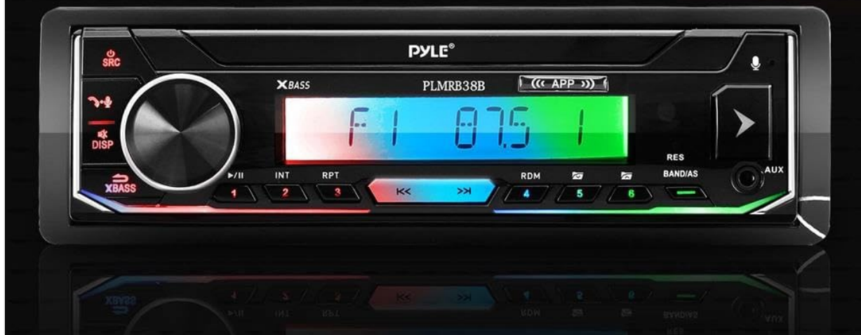
Image: The Pyle PLMRB38B.5 receiver highlighting its hands-free calling feature with a microphone icon and sound wave graphics, indicating compatibility with XBass, Siri Dialing, and Android/iOS apps.

Compatible With XBass Siri Dialing Android App, IOS App & Demo Mode