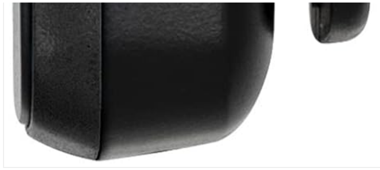
Figure 3: A side profile of the MP3 player, highlighting the 'HOLD' switch to prevent accidental button presses and the slot for a Micro SD card to expand storage.

Video 1: This video provides a visual overview of the MP3 player's size and highlights the location of the Micro SD card slot, which is essential for expanding storage.