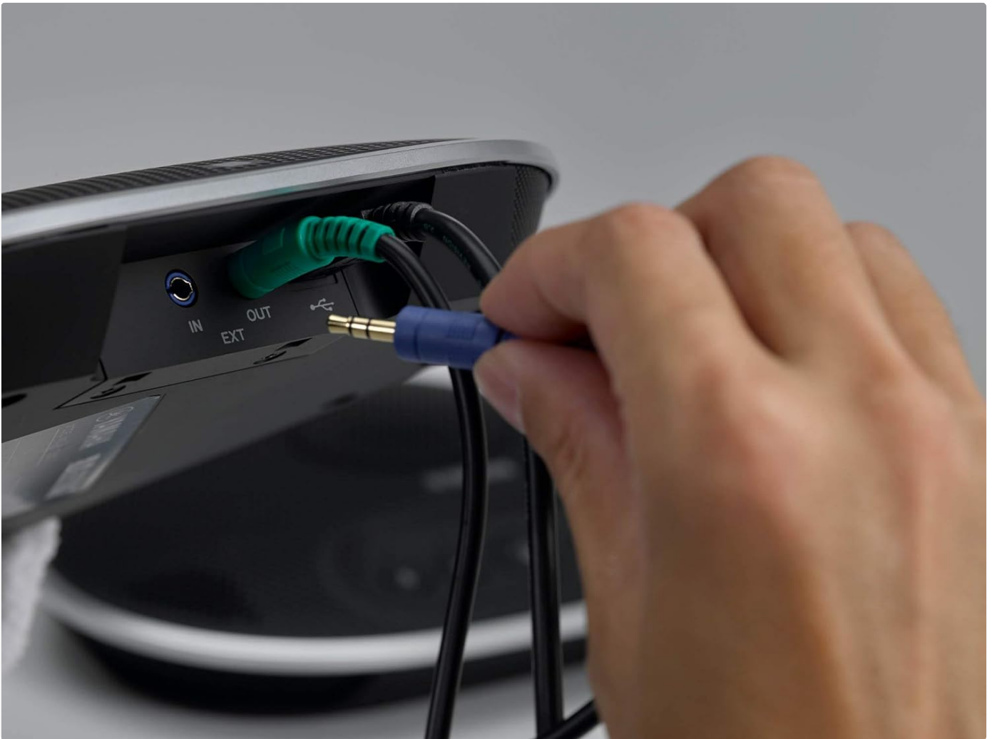
Image: A hand connecting a blue audio cable into the 'IN' port on the rear of the Yamaha YVC-330, demonstrating the physical connection process.