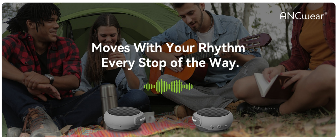
Image: Bluetooth 5.3 seamless pairing with various devices.