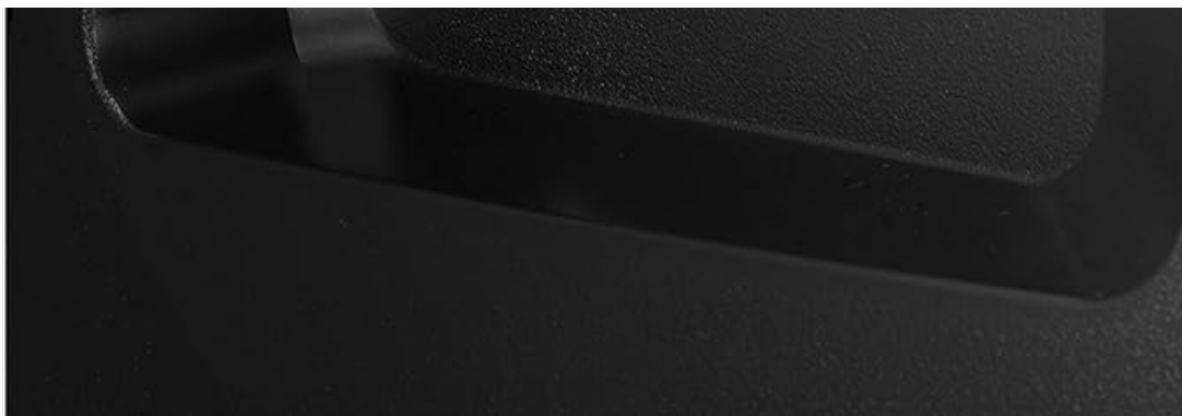
Image 4.3: Detailed view of the central connection panel on the LG 50UN7000PUC TV, showing LAN, additional USB, AV, optical audio, and antenna inputs.