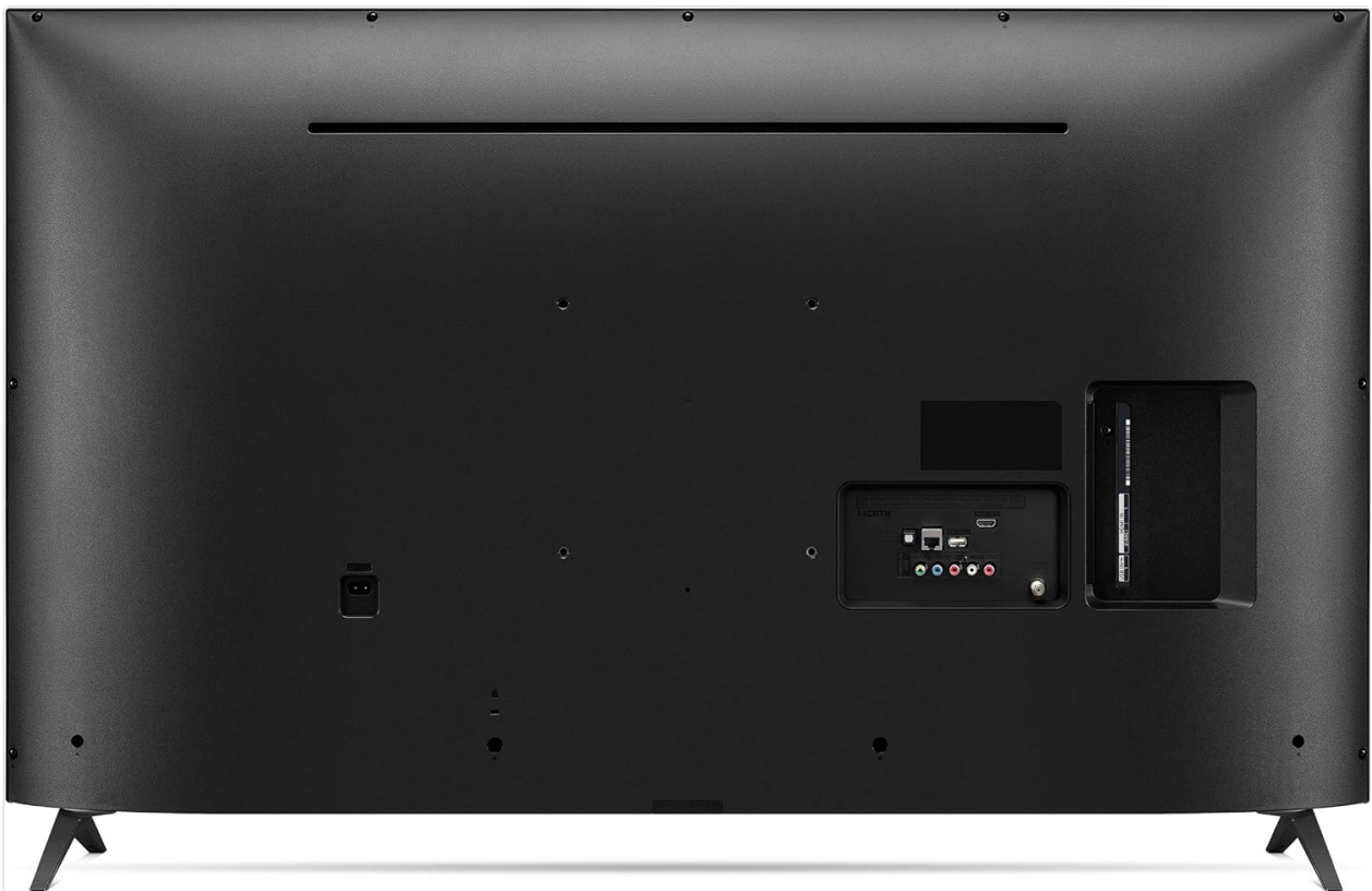
Image 4.1: Rear view of the LG 50UN7000PUC TV, highlighting the various input and output ports for connecting external devices.