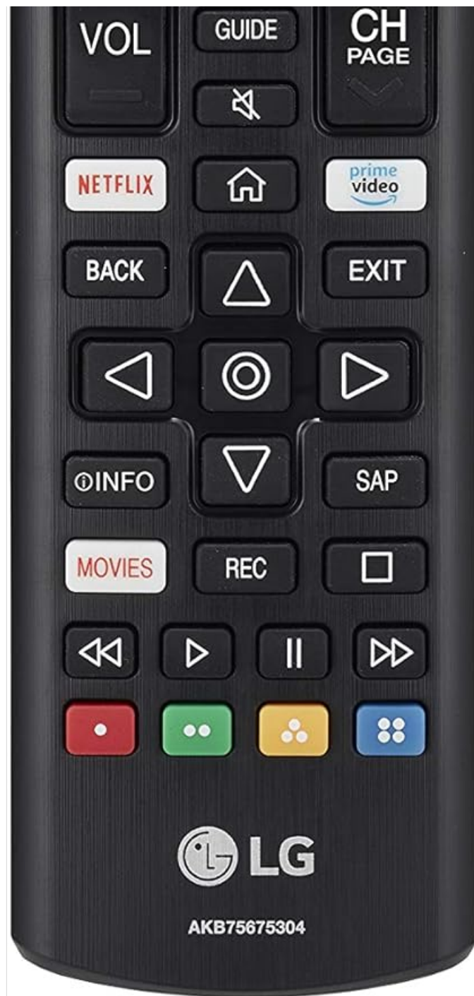
Image 5.1: Layout of the LG TV remote control, showing power, number, volume, channel, navigation, and app buttons.