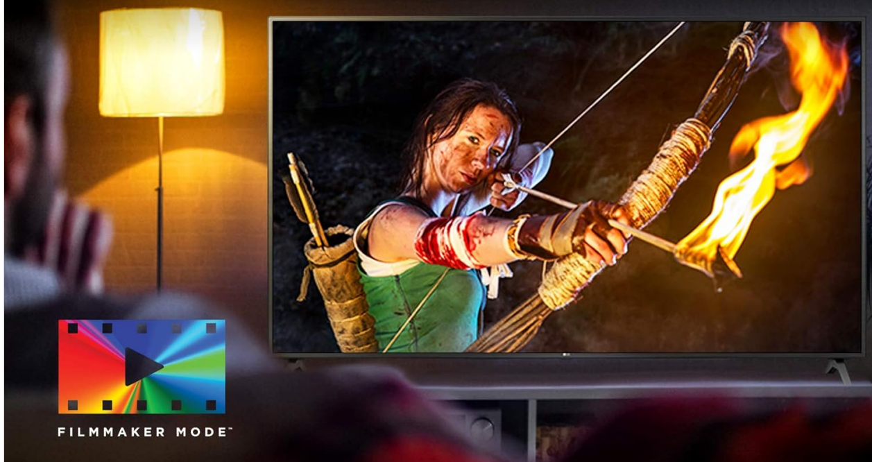
Image 5.5: The LG TV screen showing a movie scene with the 'FILMMAKER MODE' logo, indicating an optimized viewing experience.