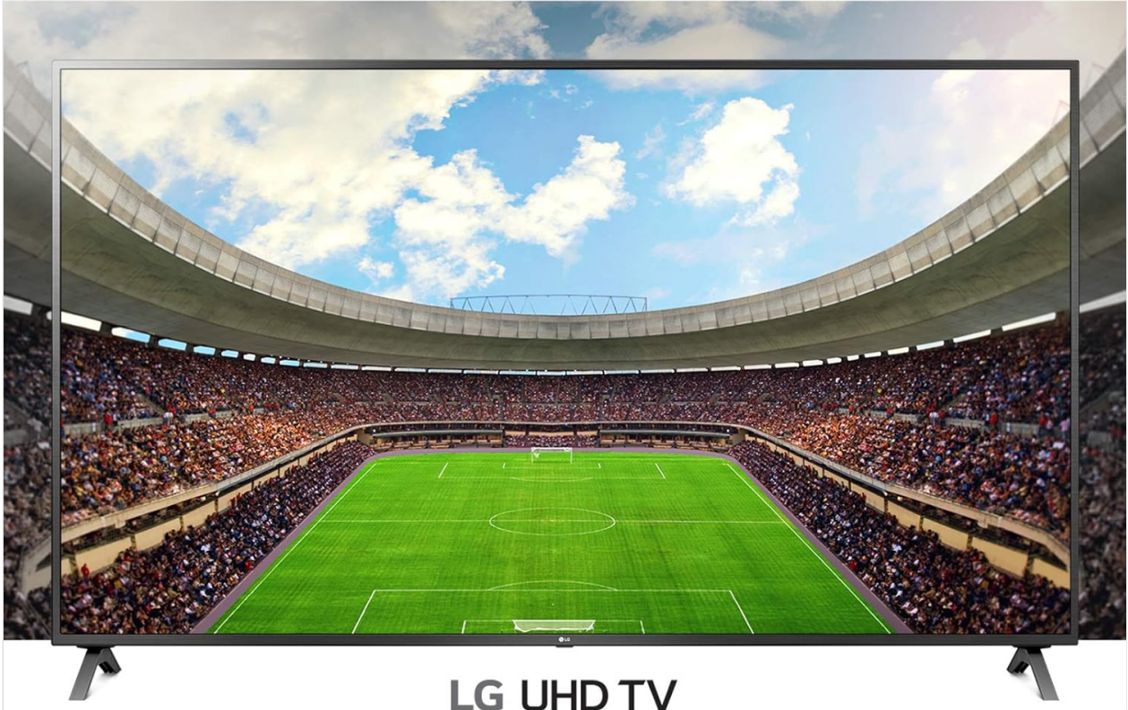
Image 5.3: A clear, high-resolution display on the LG 4K TV showing a vibrant football stadium, illustrating the clarity of 4K resolution.