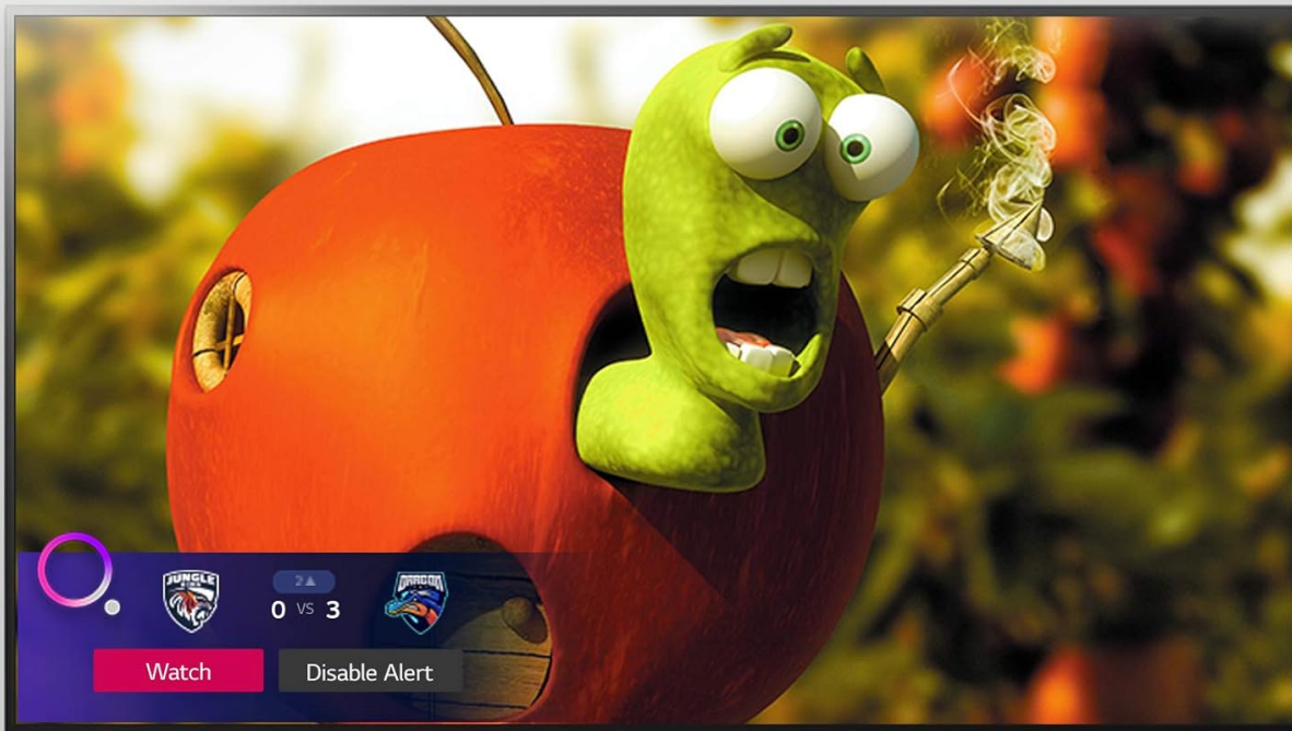
Image 5.6: The LG TV screen showing a 'Sports Alert' notification with team scores and options to watch or disable alerts.