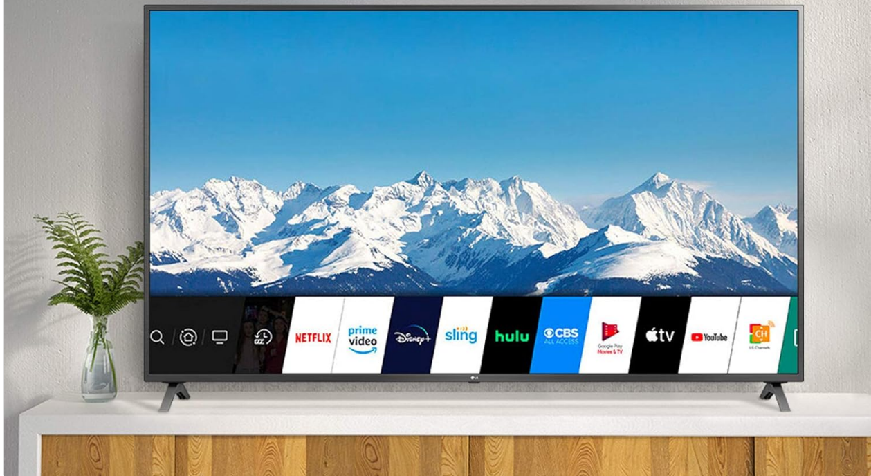
Image 5.2: The LG webOS interface displaying a selection of streaming applications such as Netflix, Prime Video, Disney+, and Hulu.