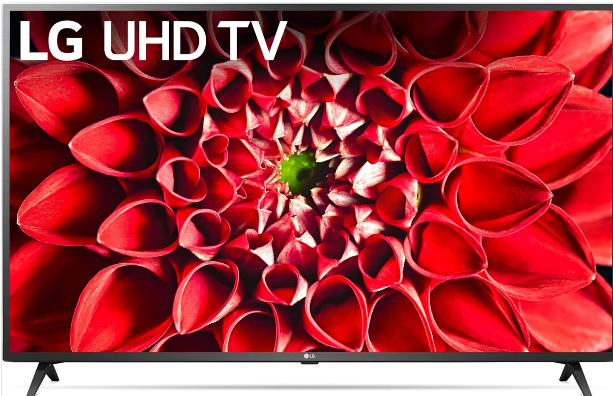
Image 1.1: Front view of the LG 50UN7000PUC 50-inch 4K Smart TV, showcasing its display with vibrant colors.

This manual provides essential information for the safe and efficient use of your LG 50UN7000PUC 50-inch 4K Smart TV. Please read it thoroughly before operating the product and retain it for future reference. It covers setup, operation, maintenance, and troubleshooting to ensure optimal performance and longevity of your television.