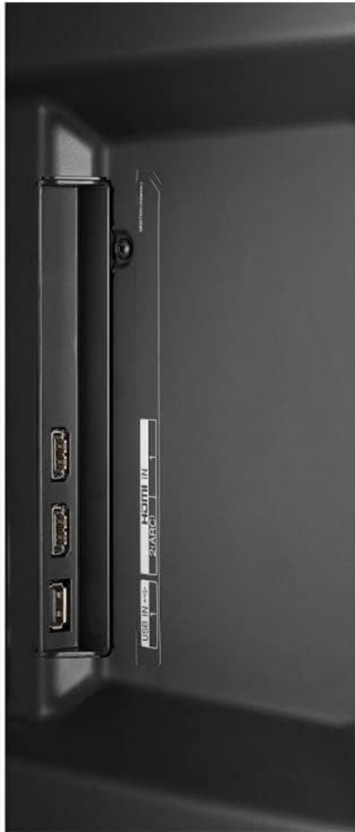
Figure 5: Close-up view of the HDMI and USB ports. This detailed image shows the accessible HDMI and USB ports located on the side of the television, facilitating easy connection of external devices.