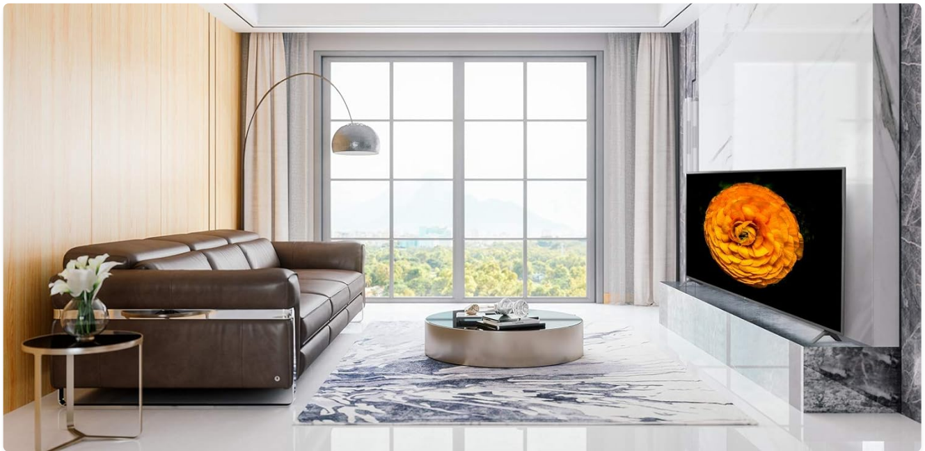
Figure 2: Front view of the LG 82 inch 4K UHD Smart TV with its stand. The television is shown displaying a vibrant image, highlighting its large screen size and slim bezels.