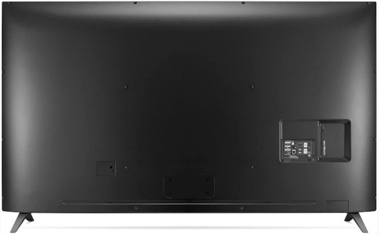
Figure 4: Rear view of the LG 82 inch 4K UHD Smart TV. This image displays the back panel of the television, highlighting the arrangement of its various input and output ports for connectivity.