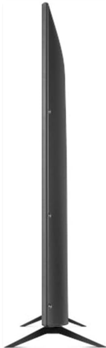
Figure 3: Side profile of the LG 82 inch 4K UHD Smart TV. This image emphasizes the television's remarkably thin profile, indicating a sleek and modern design suitable for various living spaces.