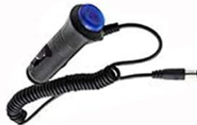
Cigarette lighter charger x 1