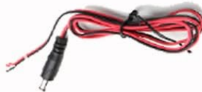
Power Cable x 2