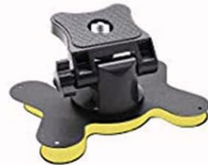
Monitor Bracket x 1