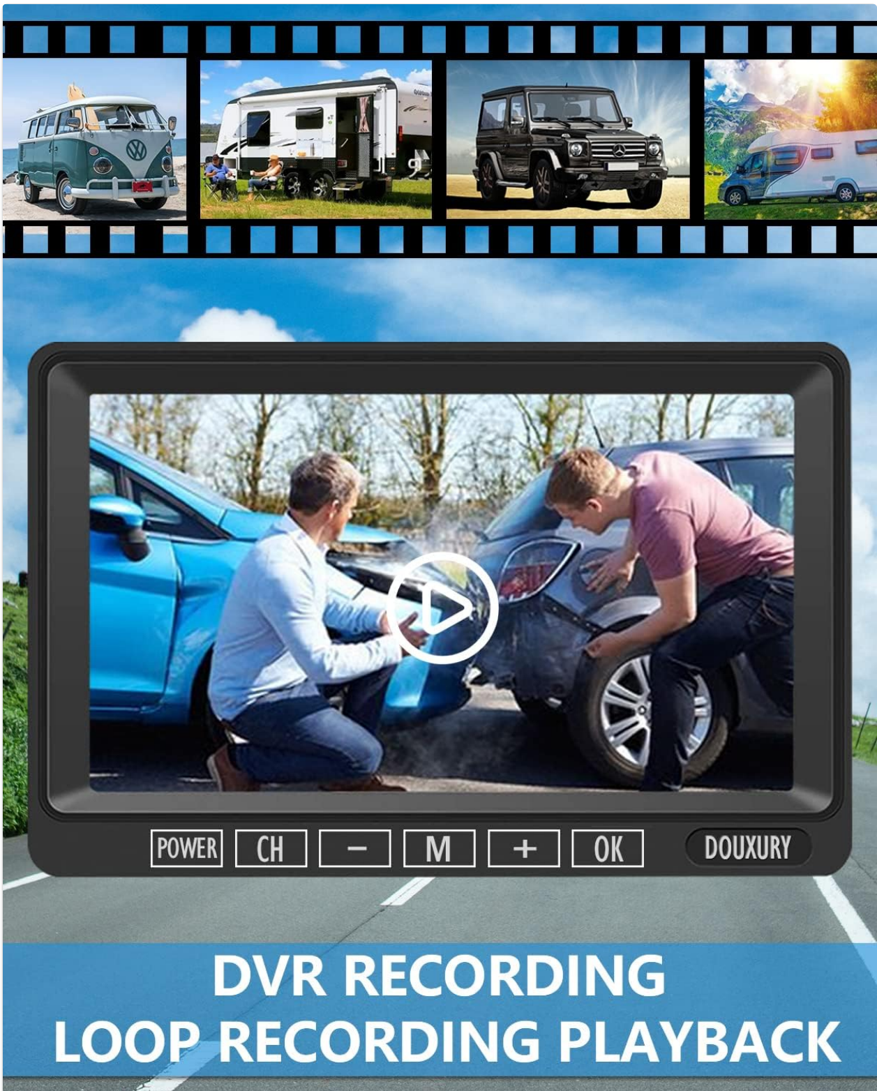
Image: Monitor displaying a clear 1080P HD image from the camera.