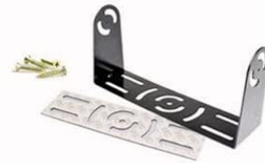
U Shape Bracket x 1