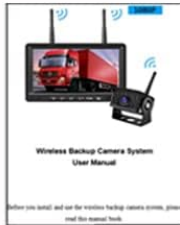
User Manual x 1