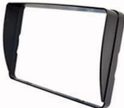
Sunshade x 1