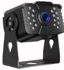
Camera x 1