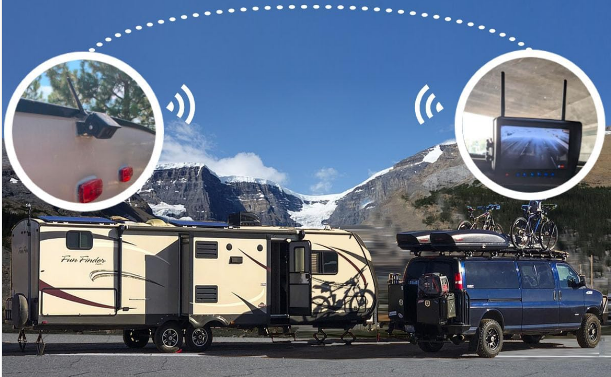
Image: Visual representation of the strong wireless signal range between the camera and monitor.

The stable signal can reach 320ft in open area and 180ft in vehicles in practical tests.