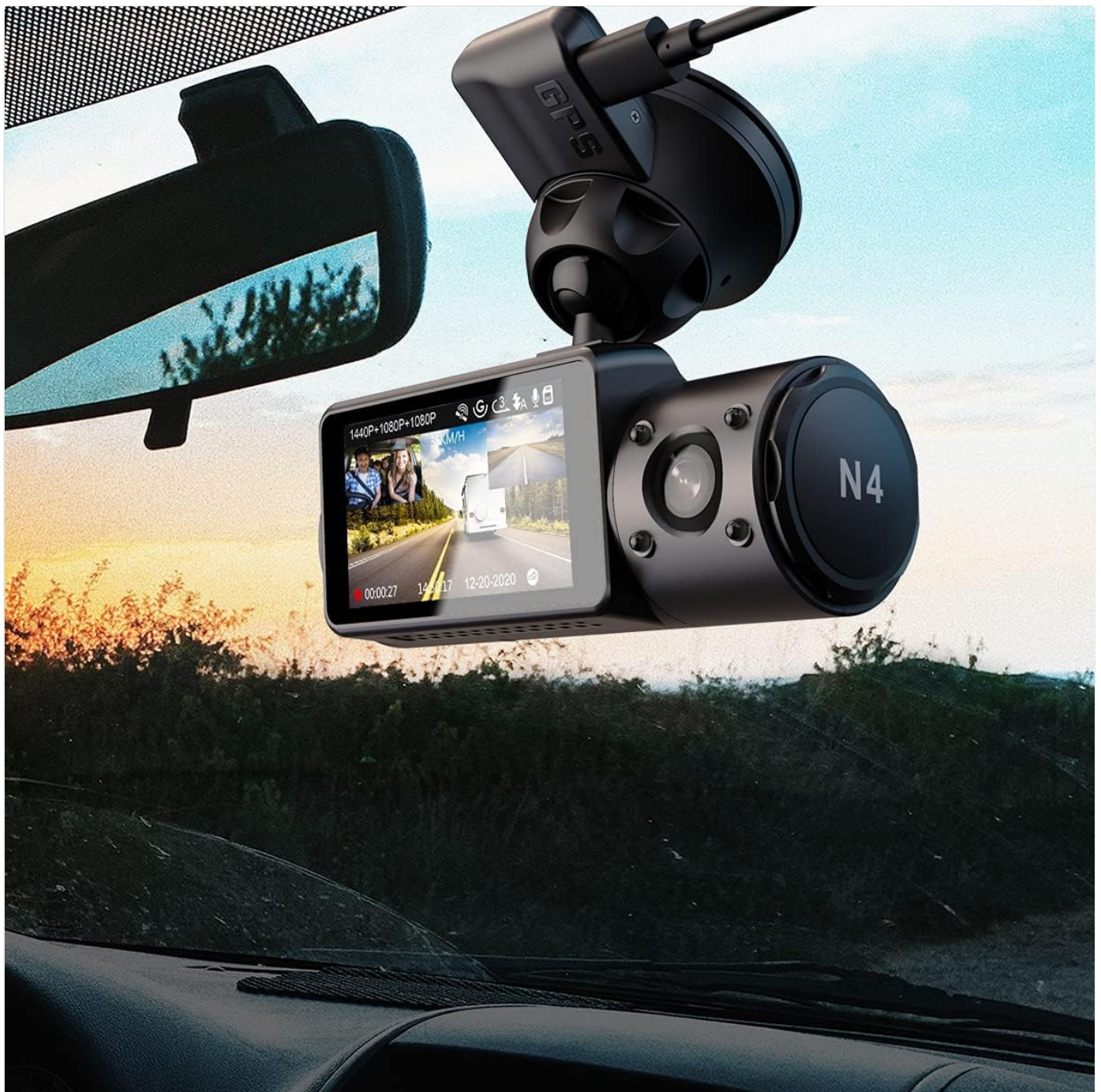
Figure 5: Dash cam displaying real-time GPS information on its screen.