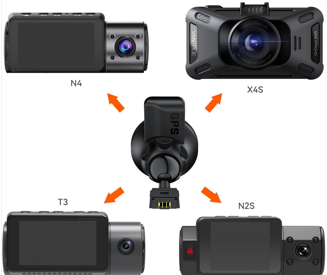
Figure 1: VANTRUE GPS Receiver Module compatibility with various dash cam models.