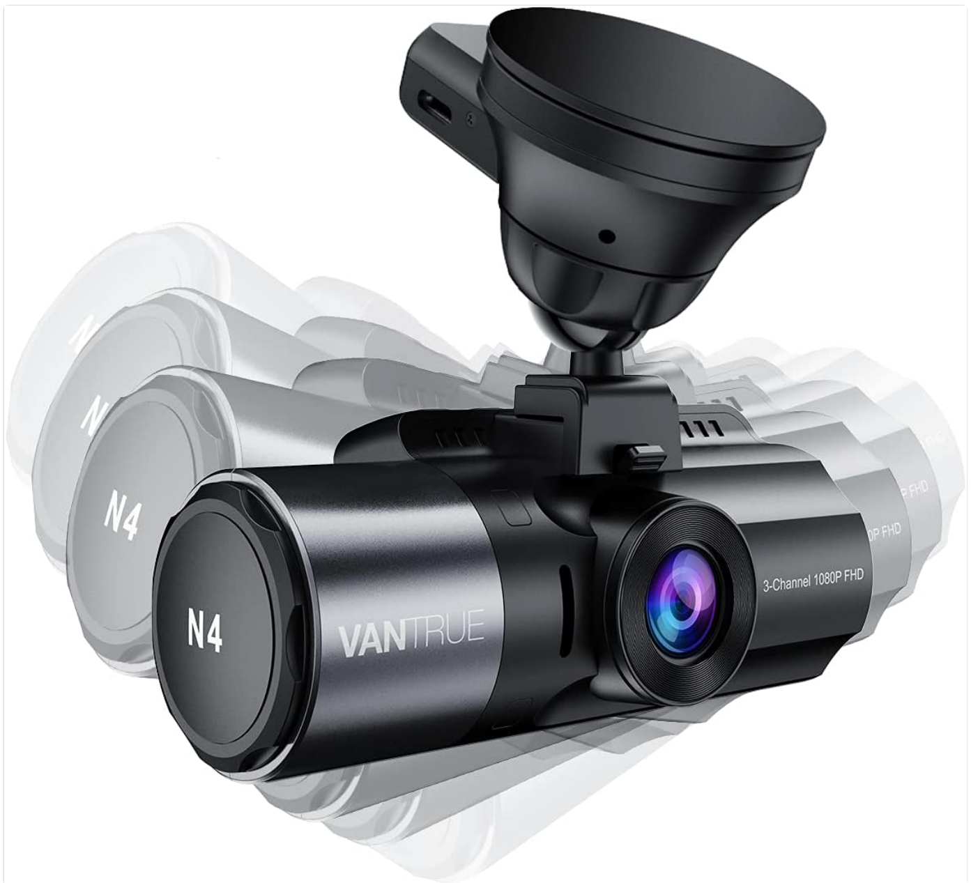
Figure 3: Dash cam mounted with the GPS module, illustrating adjustability.