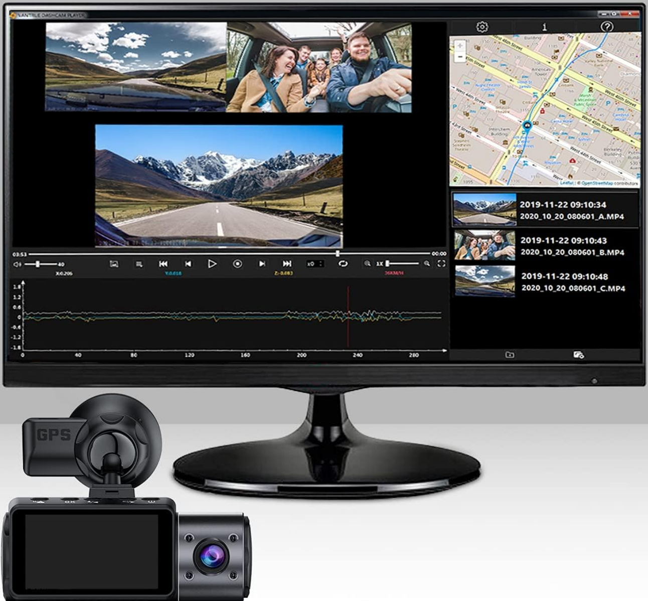
Figure 4: Vantrue Player Software displaying video and GPS tracking data.