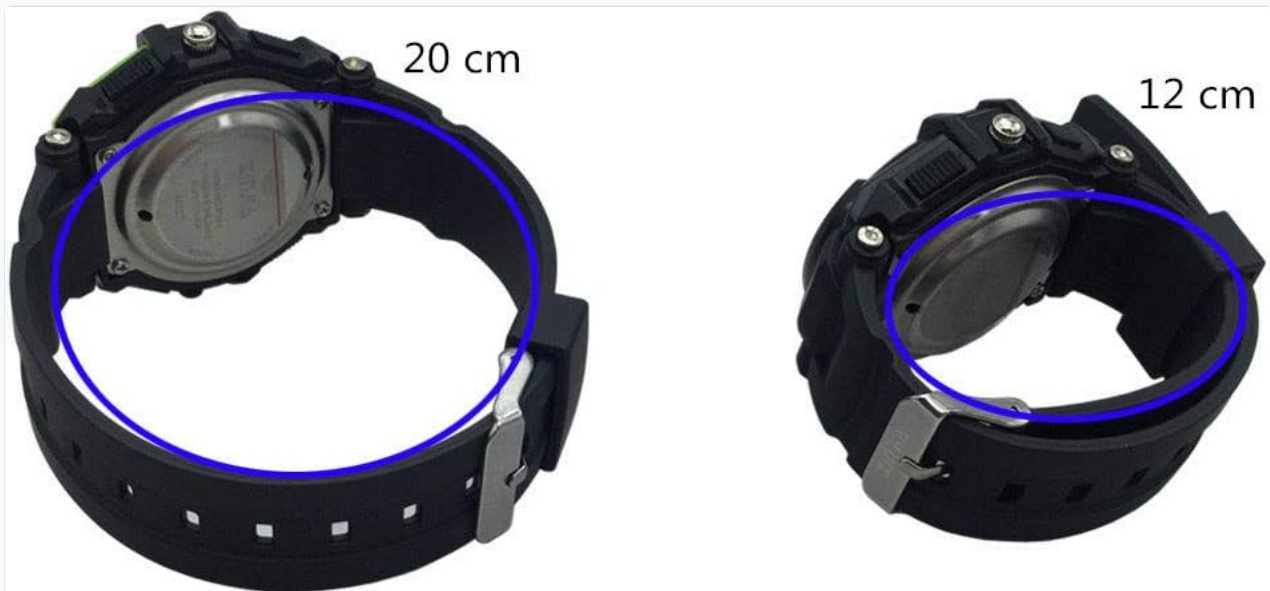
Figure 6: Examples of wrist circumference fit (20 cm and 12 cm).