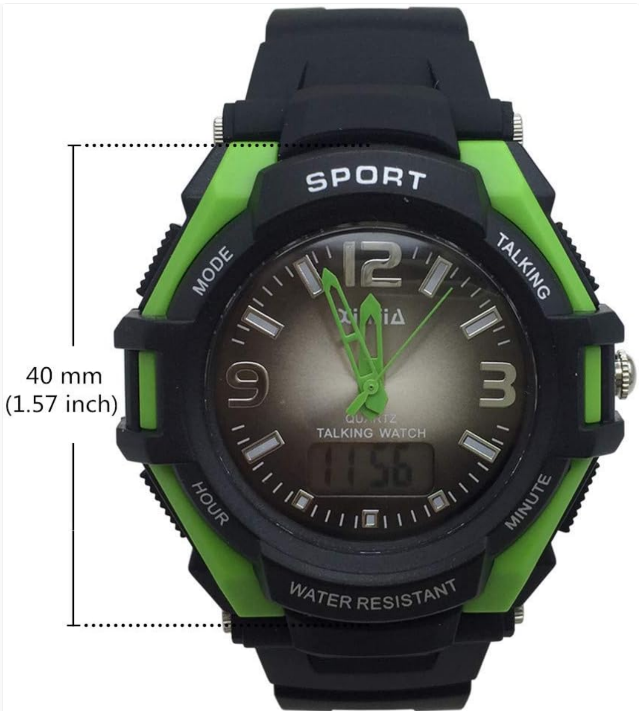
Figure 3: Watch face diameter measurement (40 mm).