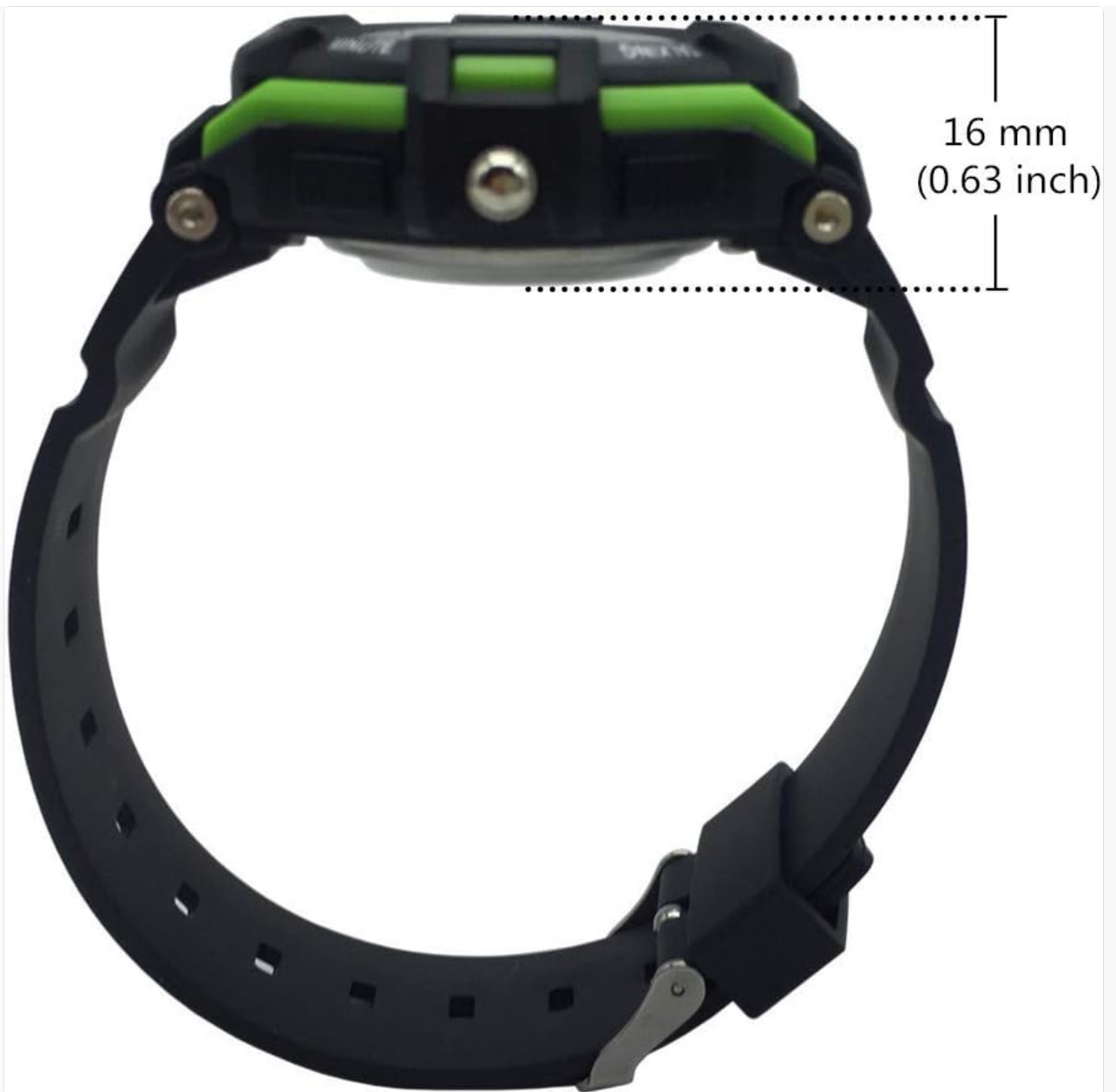
Figure 4: Watch case thickness measurement (16 mm).