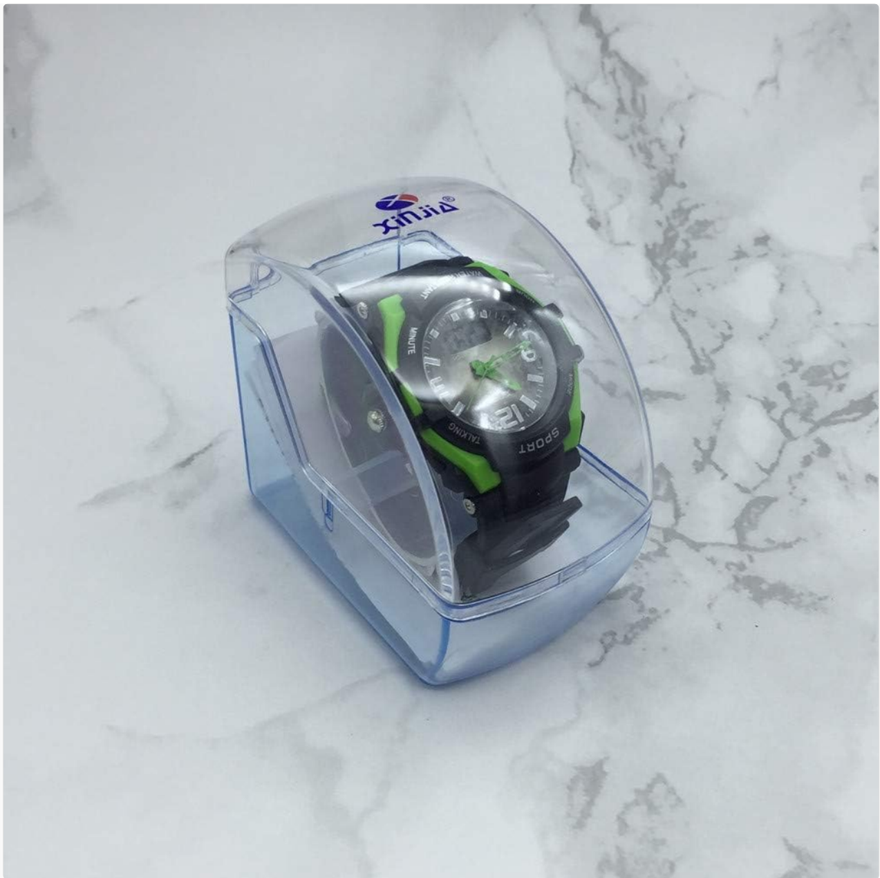
Figure 2: The watch as it appears in its original clear plastic case.