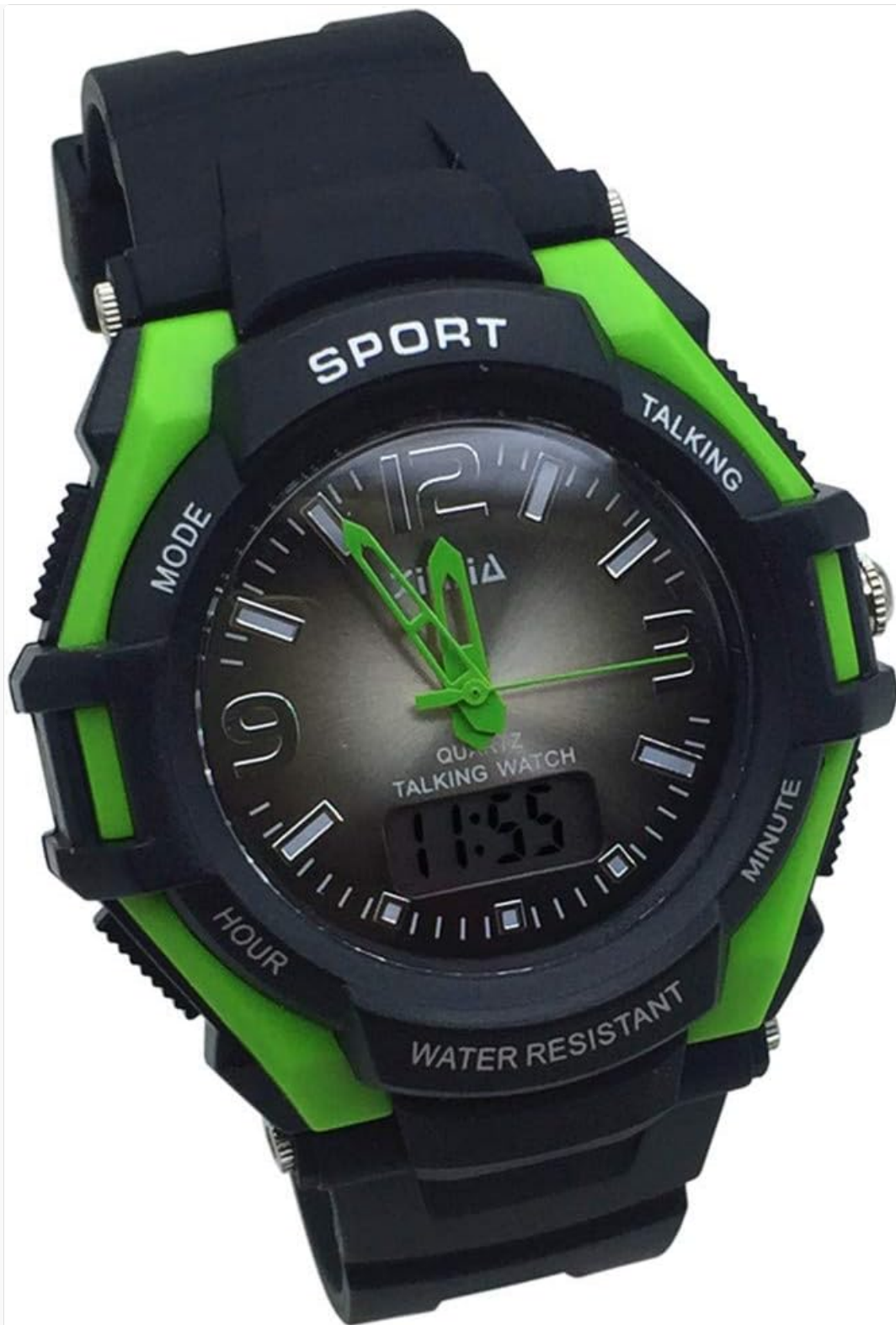
Figure 1: Front view of the VISION Talking Analog and Digital Watch.