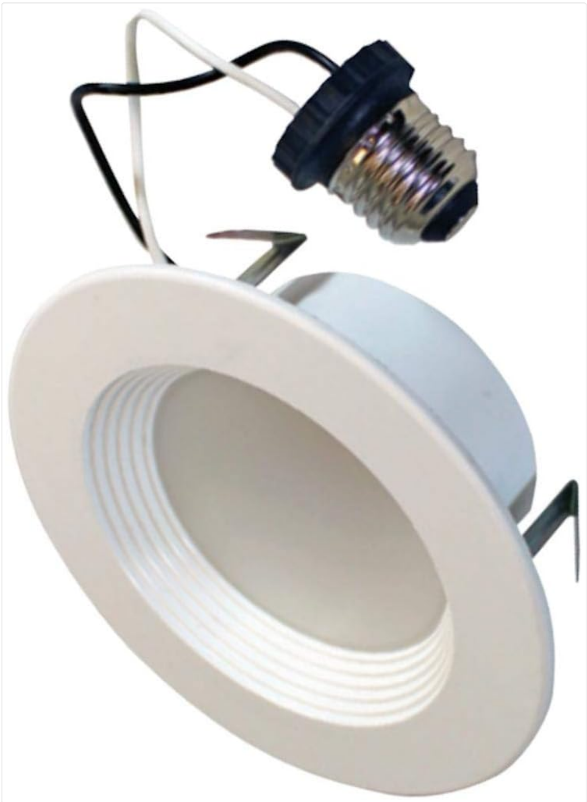
Figure 2.1: The SYLVANIA LED Recessed Downlight Kit, showing the main light fixture and the E26 screw-in adapter.