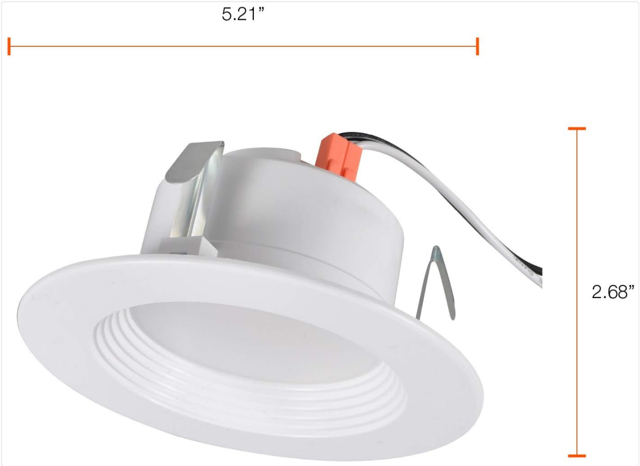
Figure 7.1: Detailed dimensions of the SYLVANIA LED Recessed Downlight, showing its height and width for installation planning.