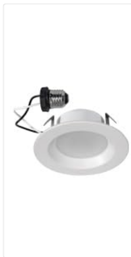
Figure 3.2: Close-up view of the E26 screw-in adapter, which connects the LED downlight to a standard light socket.