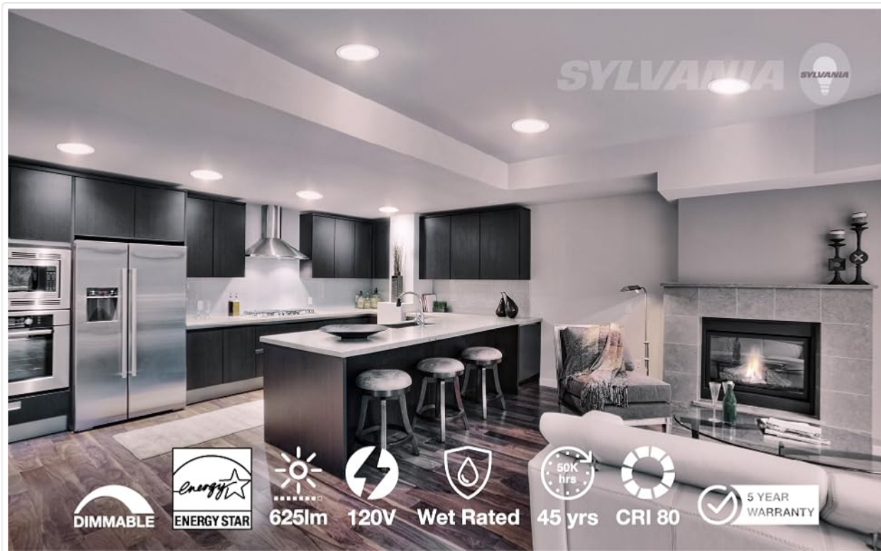
Figure 4.1: An example of a modern kitchen and living room space effectively illuminated by multiple recessed downlights.