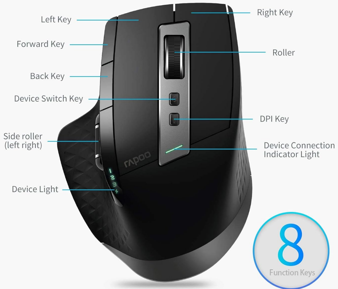
Figure 4: Mouse with programmable function keys