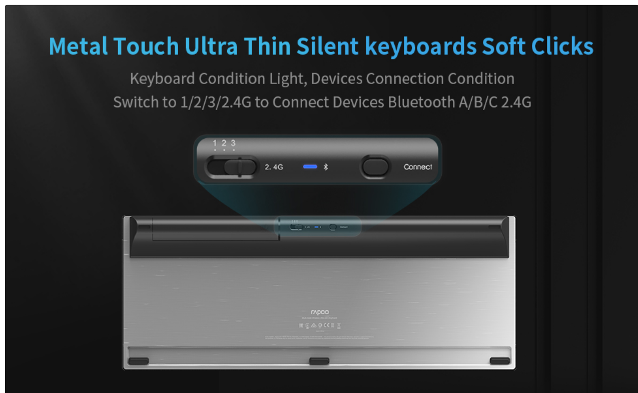
Figure 5: Keyboard connection indicators and buttons