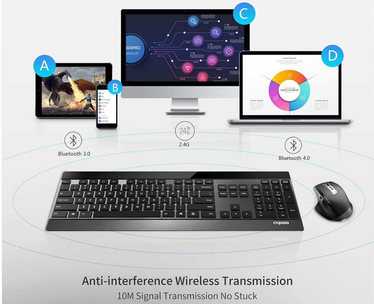
Figure 2: Multi-device switching capability