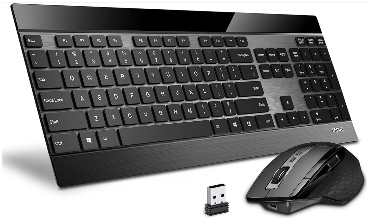
Figure 1: RAPOO Wireless Keyboard and Laser Mouse Combo

This manual provides detailed instructions for the setup, operation, maintenance, and troubleshooting of your RAPOO Wireless Keyboard and Laser Mouse Combo. This versatile combo offers seamless connectivity across multiple devices, enhancing your productivity and user experience.