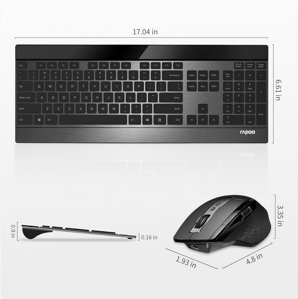
Figure 8: Product dimensions