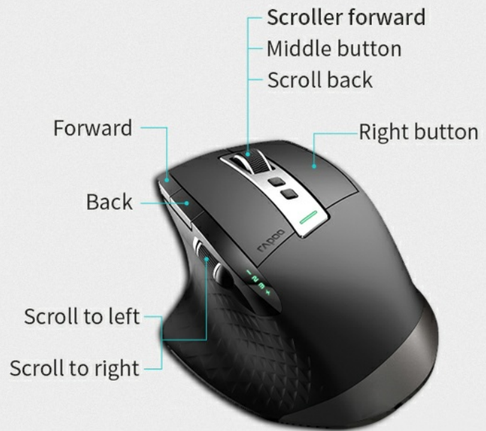
Figure 6: Mouse with customizable buttons

basic/media/mouse/Windows/DPI/Advanced functions can be used via the device driver, Clipboard Sharing can be used under the same LAN(file must be within 10M)