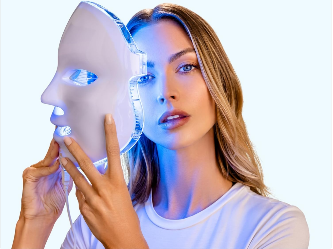
Image: A woman holding the Luma Mask, which is emitting blue light, suggesting its use for soothing and clarifying the complexion.