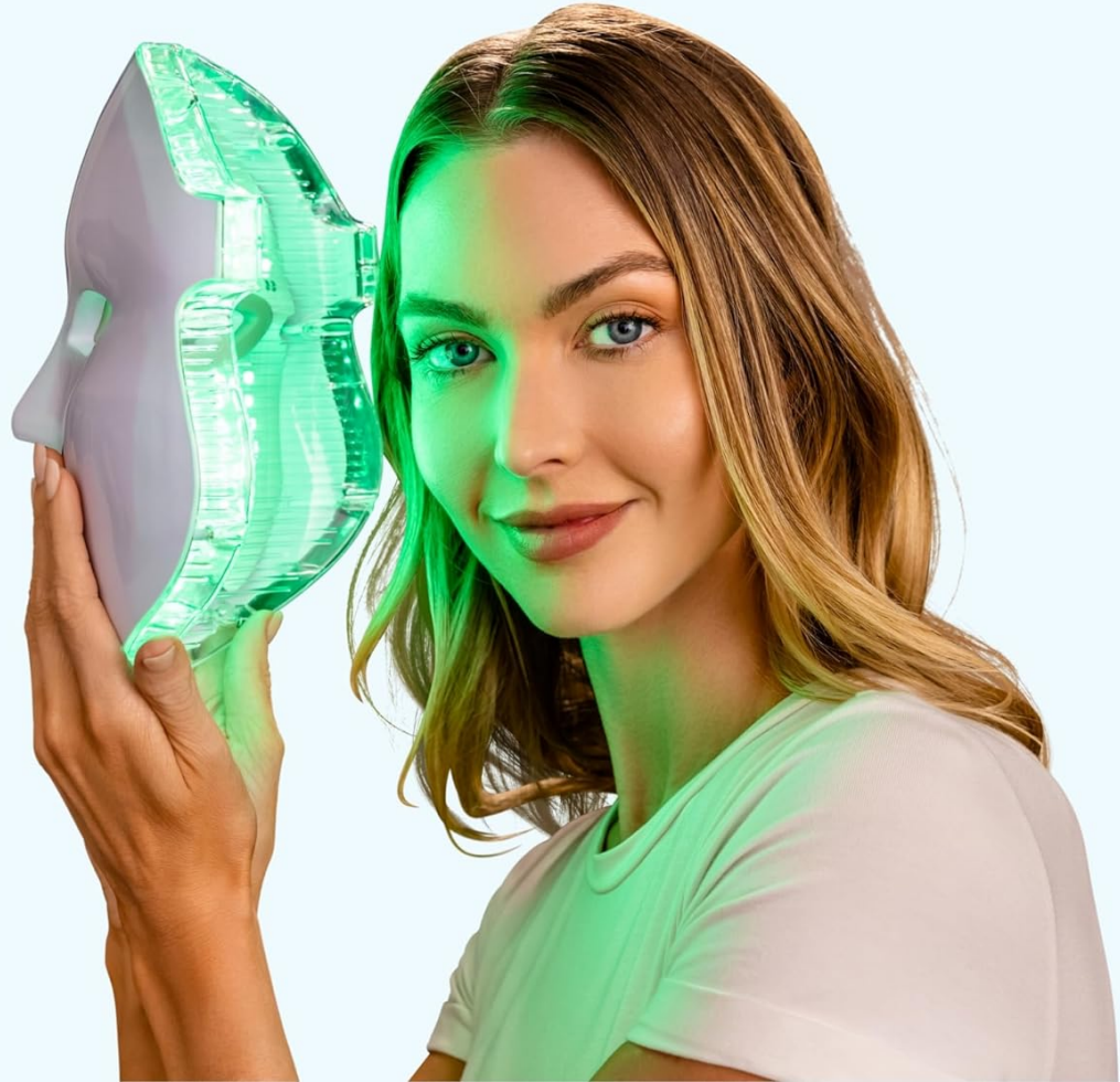
Image: A woman holding the Luma Mask, which is emitting green light, indicating its benefit for brighter-looking skin.