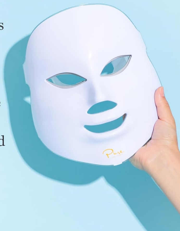
Image: The Luma Mask with a list of its key features: 150 Light Emitting Diodes (LEDs), 7 Light Wavelength Colors, 5 Light Intensity Levels, Non-Invasive & Pain-Free, UV-Free and Safety Tested.