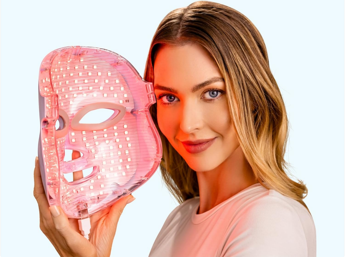
Image: A woman holding the Luma Mask, which is emitting red light, indicating its use for a younger-looking complexion.