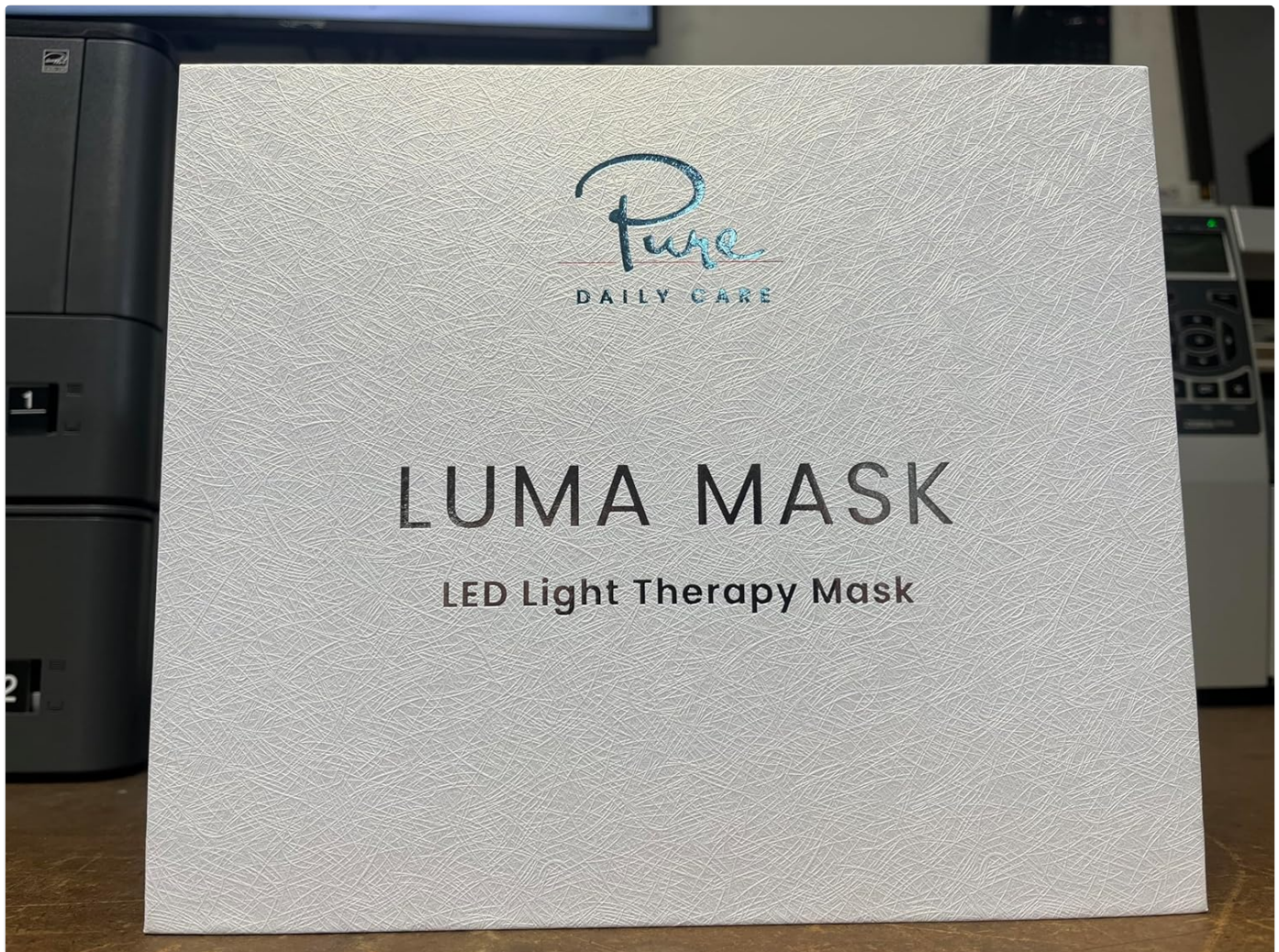
Image: The retail packaging for the Pure Daily Care Luma Mask, showing the brand logo and product name.