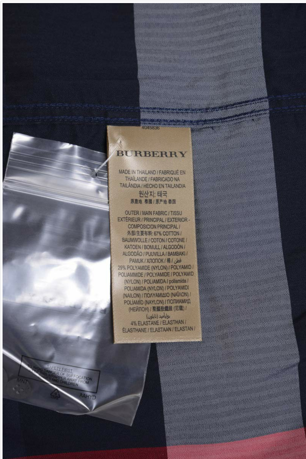
Image: Detailed view of the garment's care label, displaying material composition and international washing symbols.