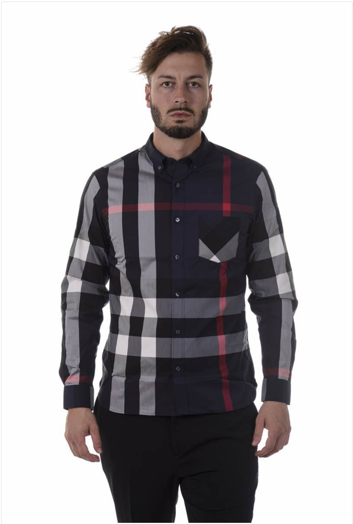
Image: Front view of the Burberry Thornaby Check Shirt on a model, showcasing the full design and fit.