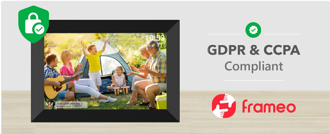
Figure 4: Sharing photos privately and securely with your digital photo frame.