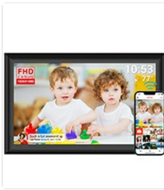
Figure 2: Steps for downloading the Frameo app and pairing it with your digital photo frame.