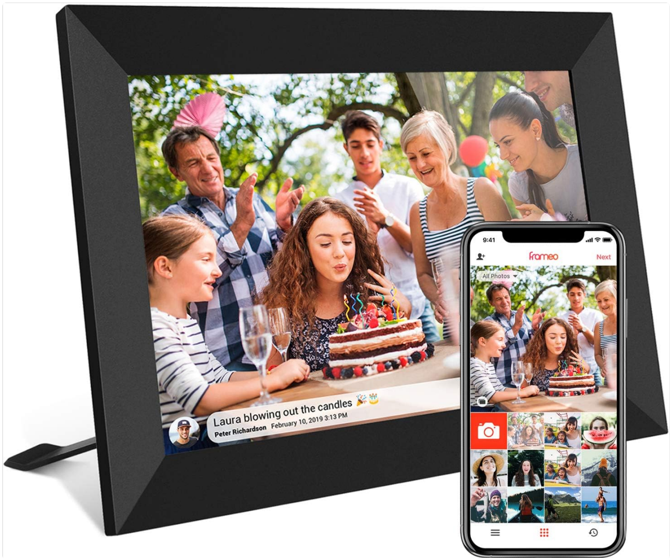
Figure 1: The Akimart 10.1 inch Smart WiFi Digital Photo Frame and its companion Frameo app.