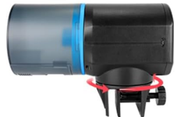
Figure 3: Installation Options