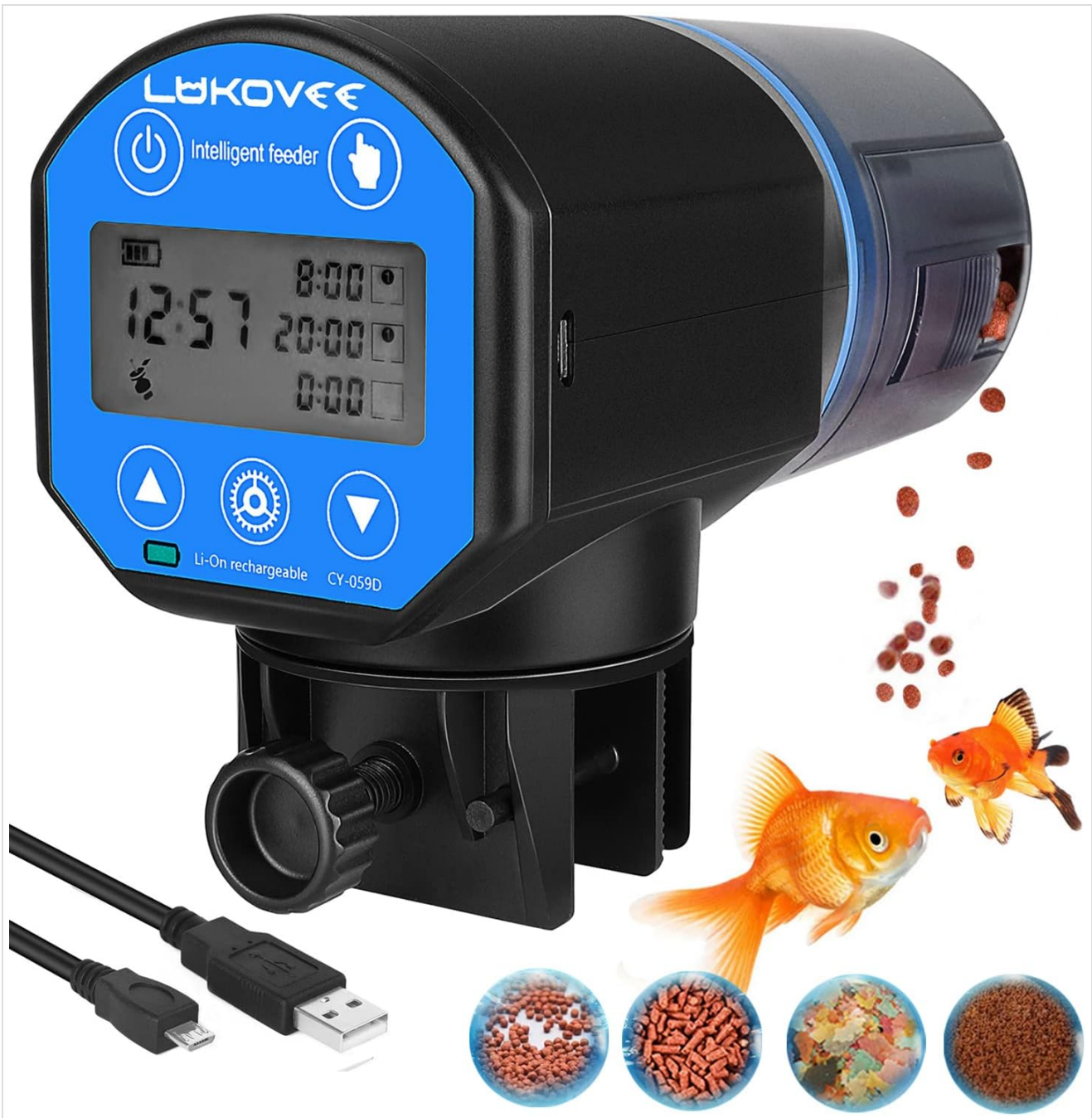
Figure 1: Lukovee Automatic Fish Feeder