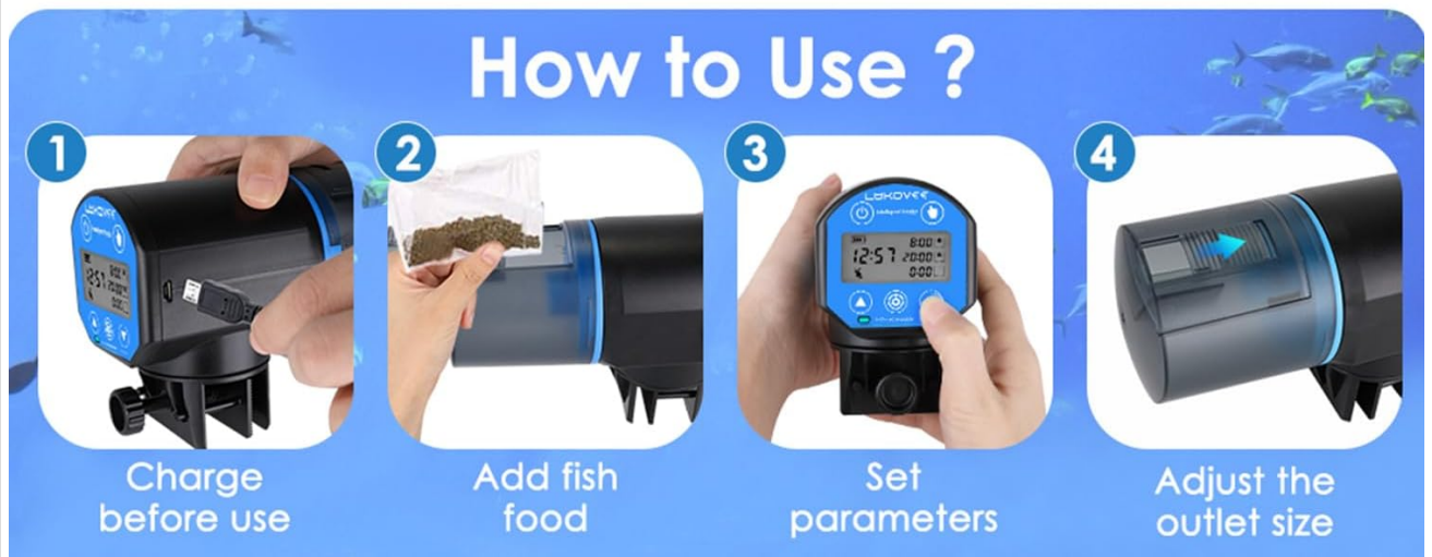
Figure 5: How to Use - Setting Parameters

Long Press the button for 5 seconds to set the Feeding setting: Feed at 8 a.m. and 8 p.m