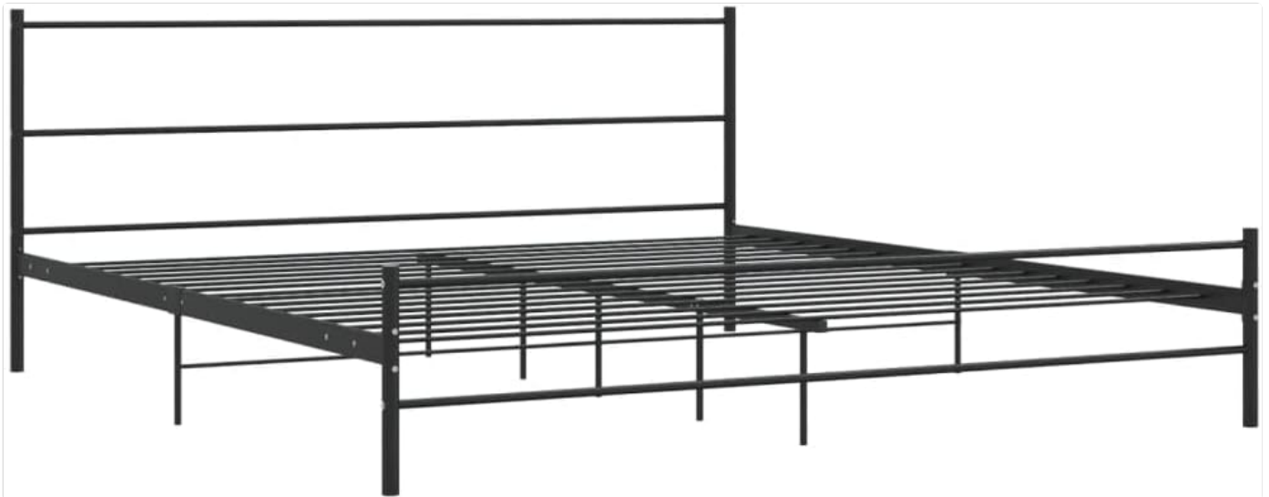
Image: The vidaXL metal bed frame, shown without a mattress, illustrating its structural components before or during assembly.