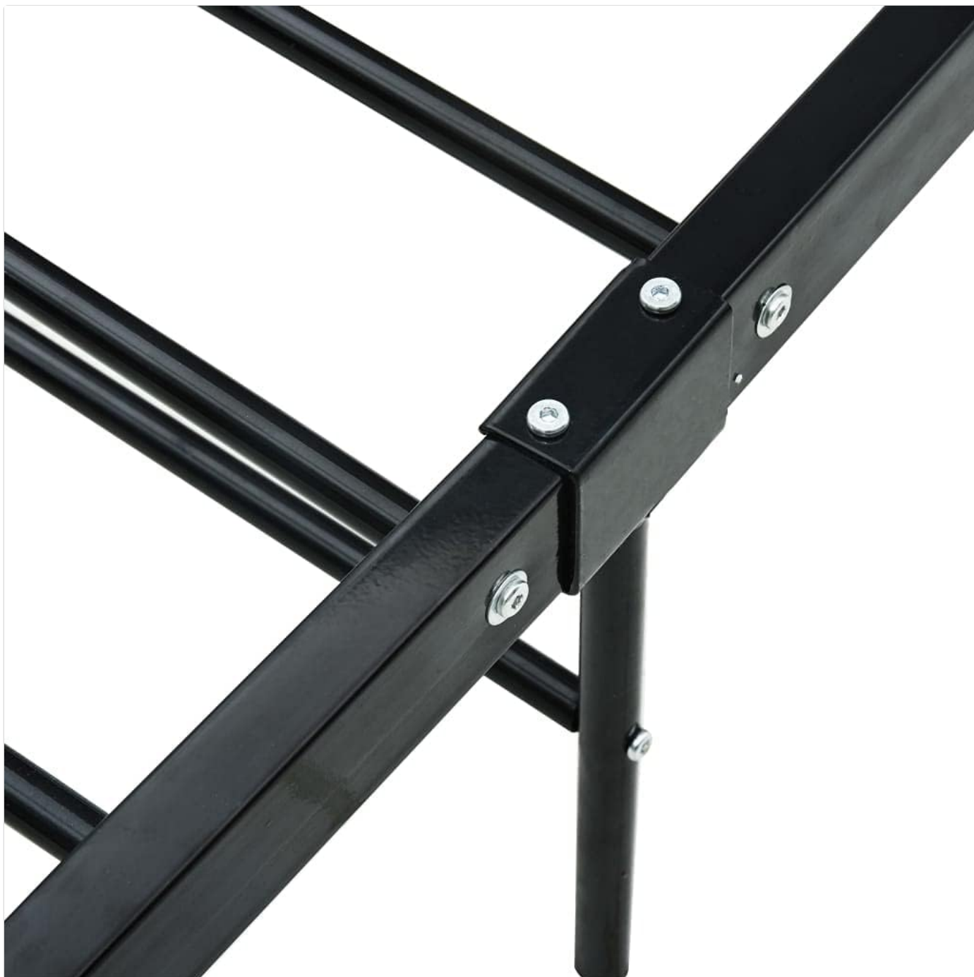
Image: A close-up view of a connection point on the bed frame, highlighting the secure fastening mechanism for stability.