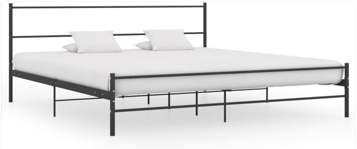
Image: The vidaXL metal bed frame, shown here with a mattress and pillows, illustrating its intended use and appearance.

This vidaXL metal bed frame, model 284688, is designed for a 180 x 200 cm mattress. It features a timeless design with a solid and robust construction made from high-quality metal. The lacquered frame is resistant to impacts and scratches, ensuring durability. The metal slats are slightly flexible and form a comfortable base for your mattress. Please note that this product includes only the bed frame; the mattress is not included.