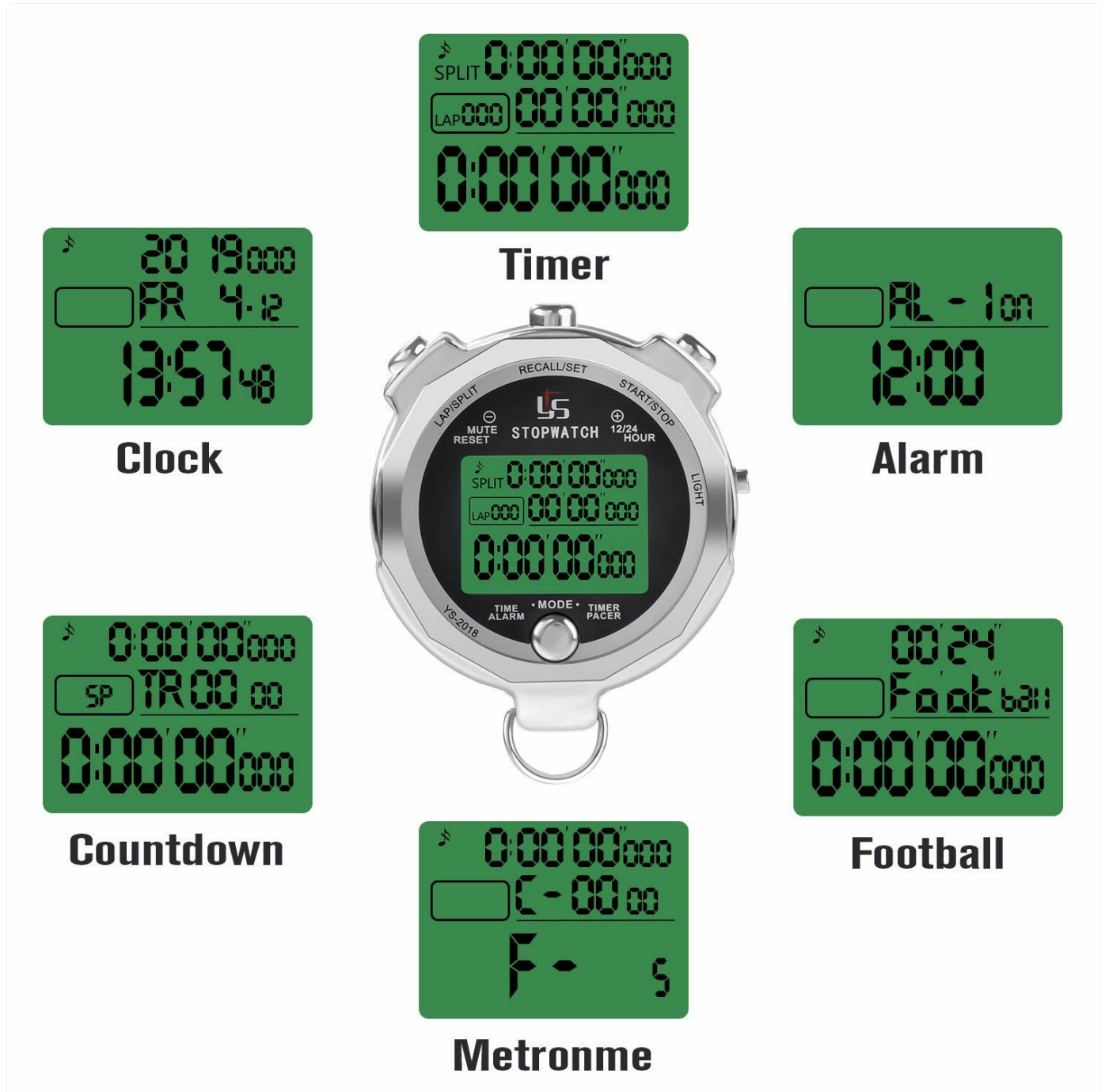
Image: A visual representation of the stopwatch's various display modes, including Timer, Clock, Alarm, Countdown, Football, and Metronome.

The stopwatch features several modes, accessible via the MODE button. The main buttons are LAP/SPLIT (left), RECALL/SET (top right), START/STOP (bottom right), MODE (bottom left), and LIGHT (side).