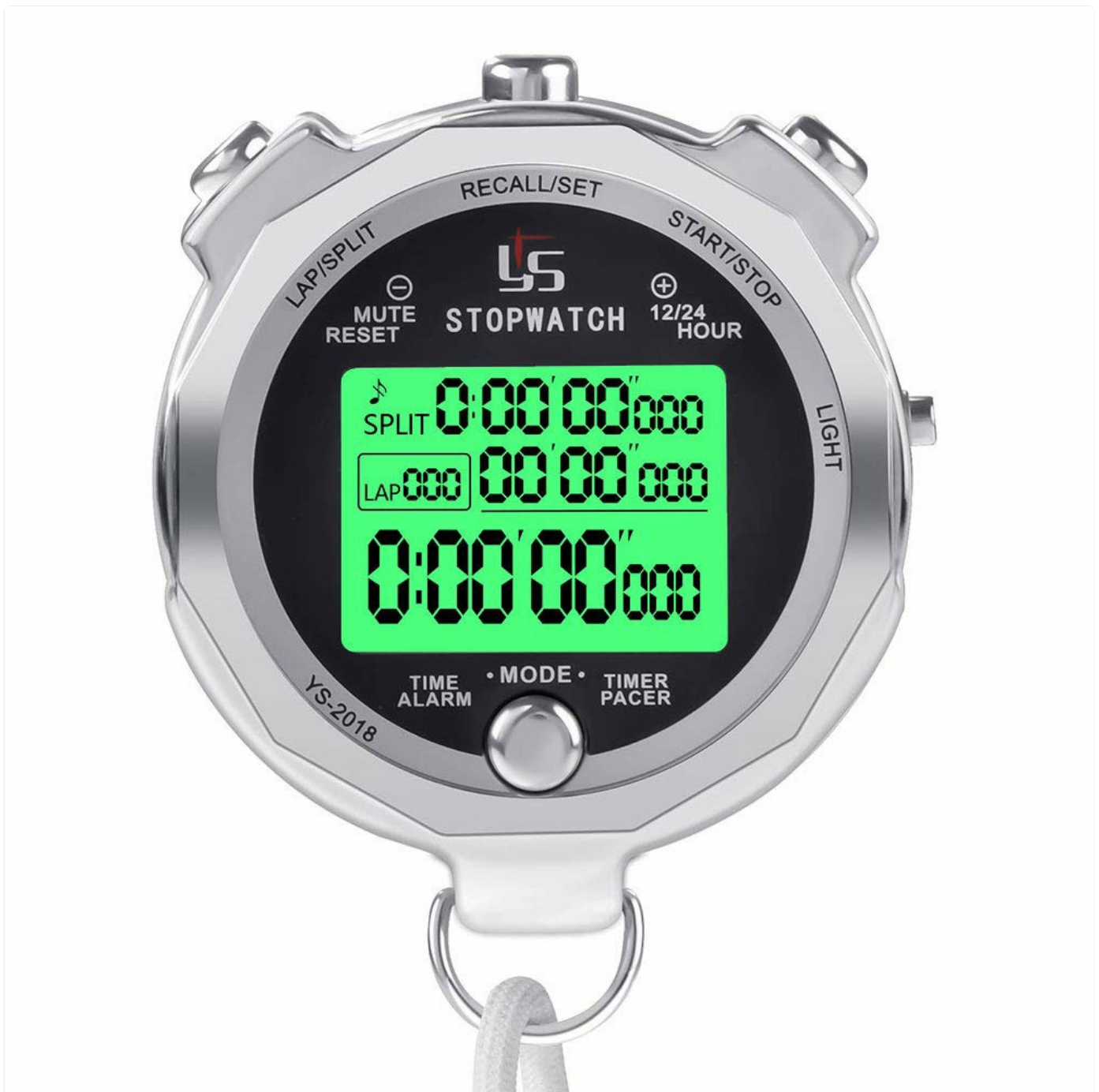
Image: The LAOPAO Ys-2018 Digital Stopwatch, showcasing its metal casing and display.