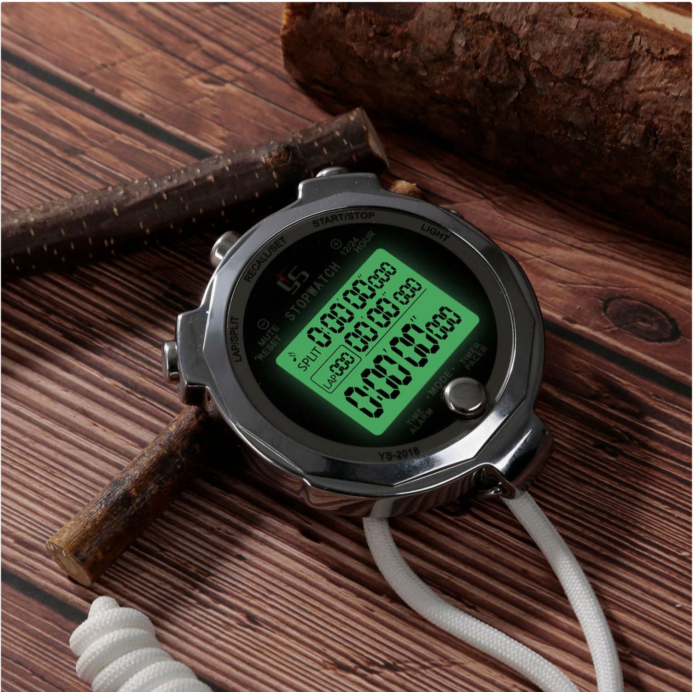
Image: The LAOPAO Ys-2018 stopwatch resting on a wooden surface, demonstrating its activated backlight in a low-light environment.