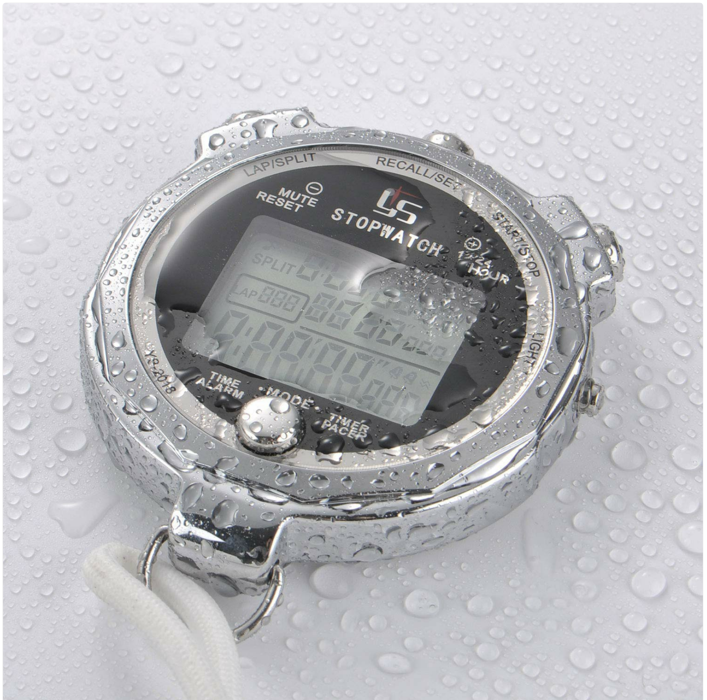
Image: The LAOPAO Ys-2018 stopwatch covered in water droplets, illustrating its water-resistant design.