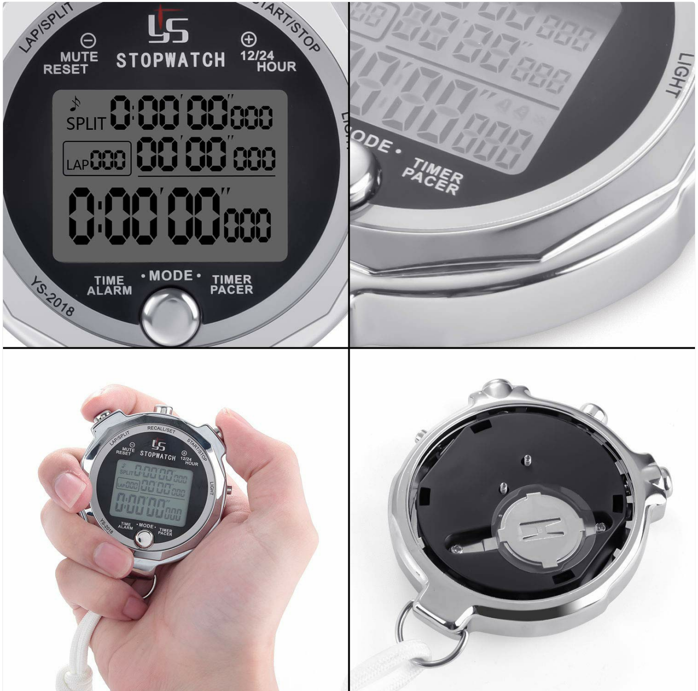
Image: A detailed view of the stopwatch, showing the button layout and the rear battery compartment, which requires a micro screwdriver for access.