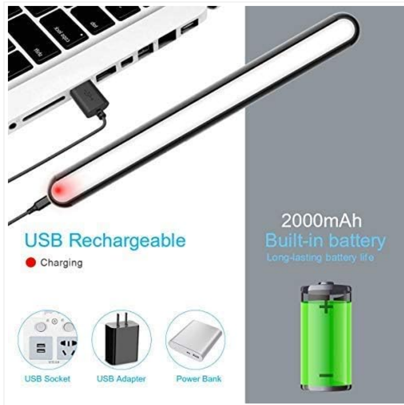
Figure 2: Charging the light bar using the Type-C USB cable. The red indicator signifies charging status.