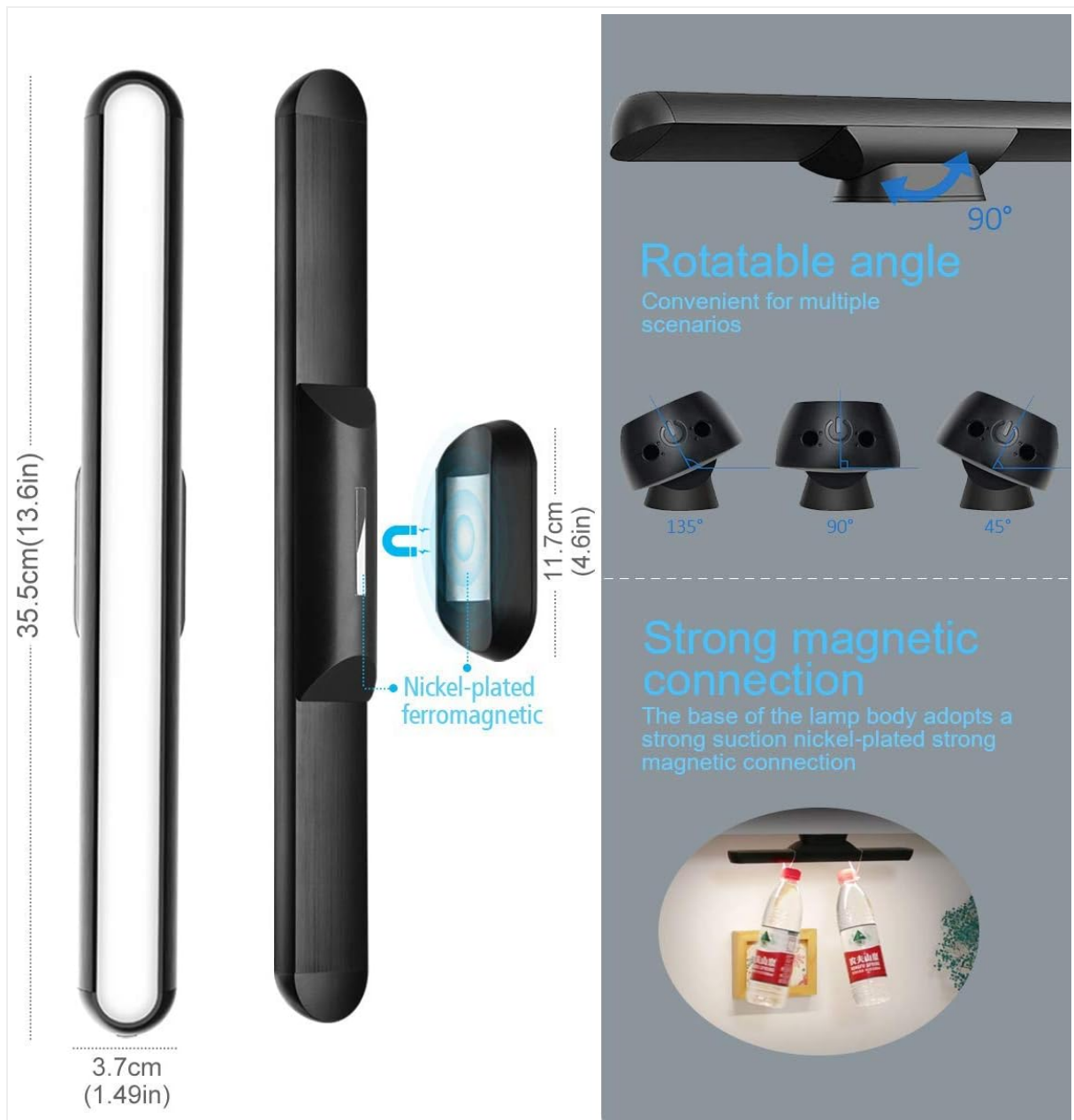
Figure 3: Magnetic mounting and adjustable angles of the light bar.

Your browser does not support the video tag.