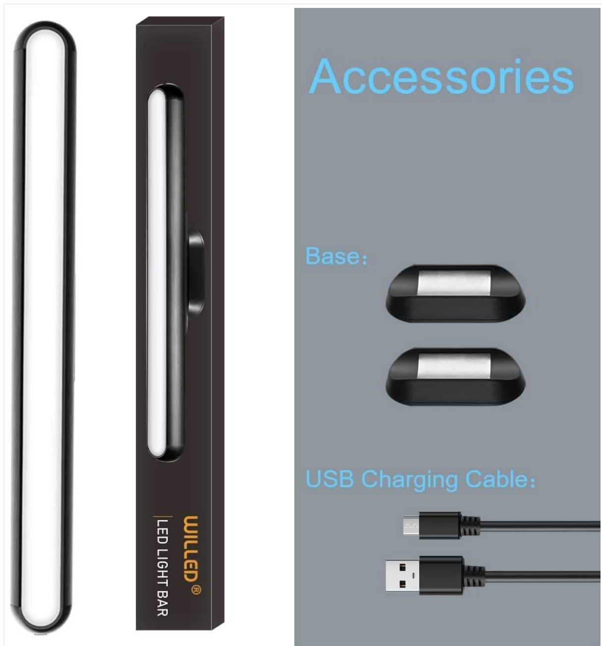
Figure 1: Package contents showing the light bar, magnetic bases, and charging cable.