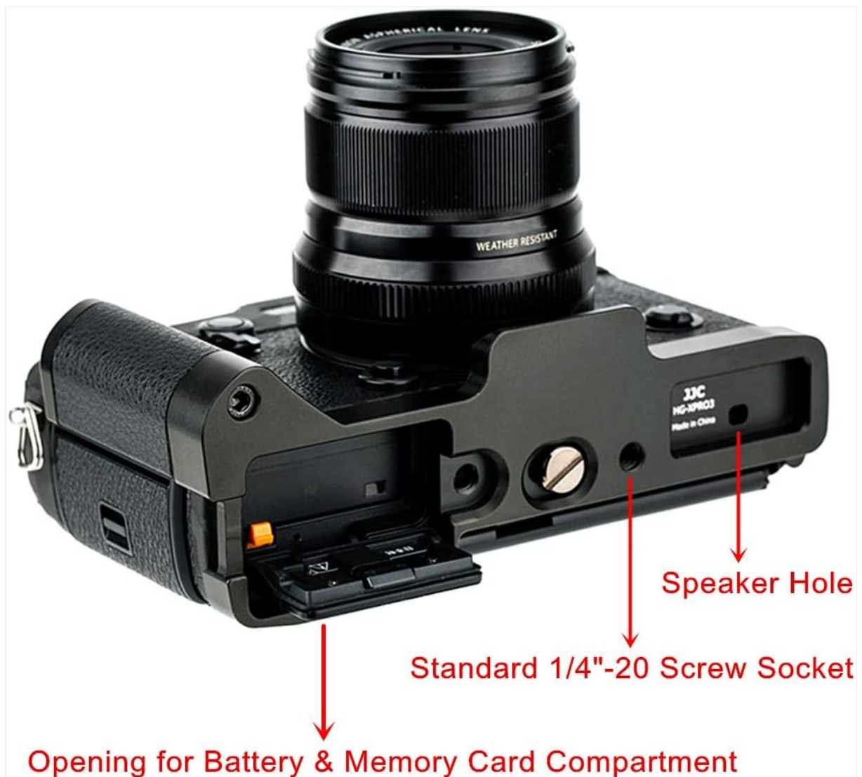
Figure 5: Eyelet design for connecting a hand strap.