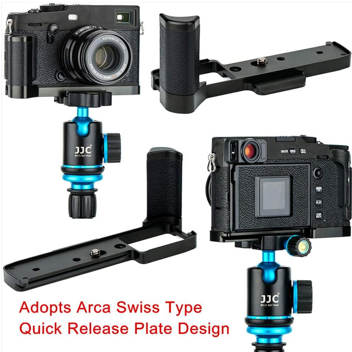
Figure 6: The grip adopts an Arca Swiss Type quick release plate design.