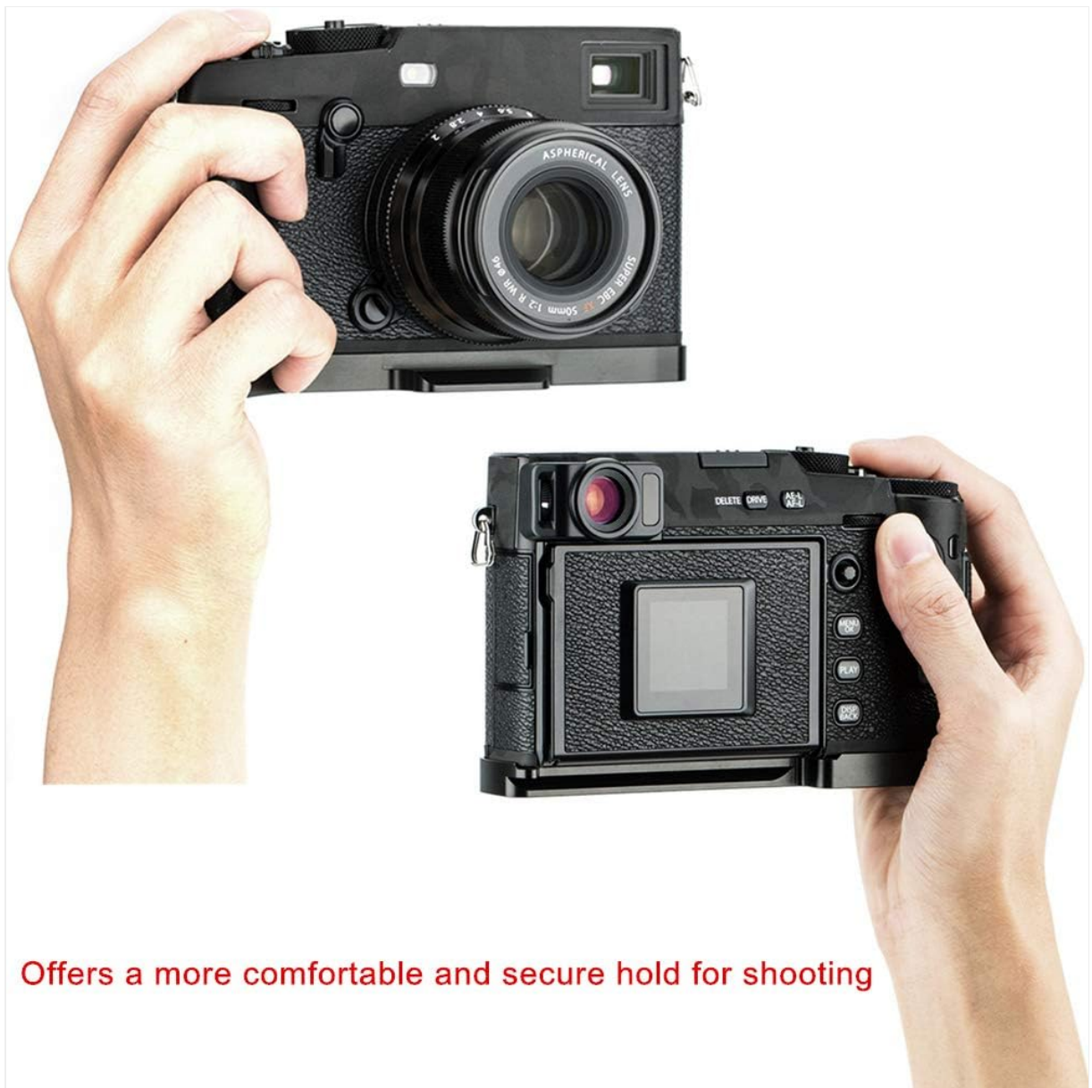
Figure 2: The grip offers a more comfortable and secure hold.