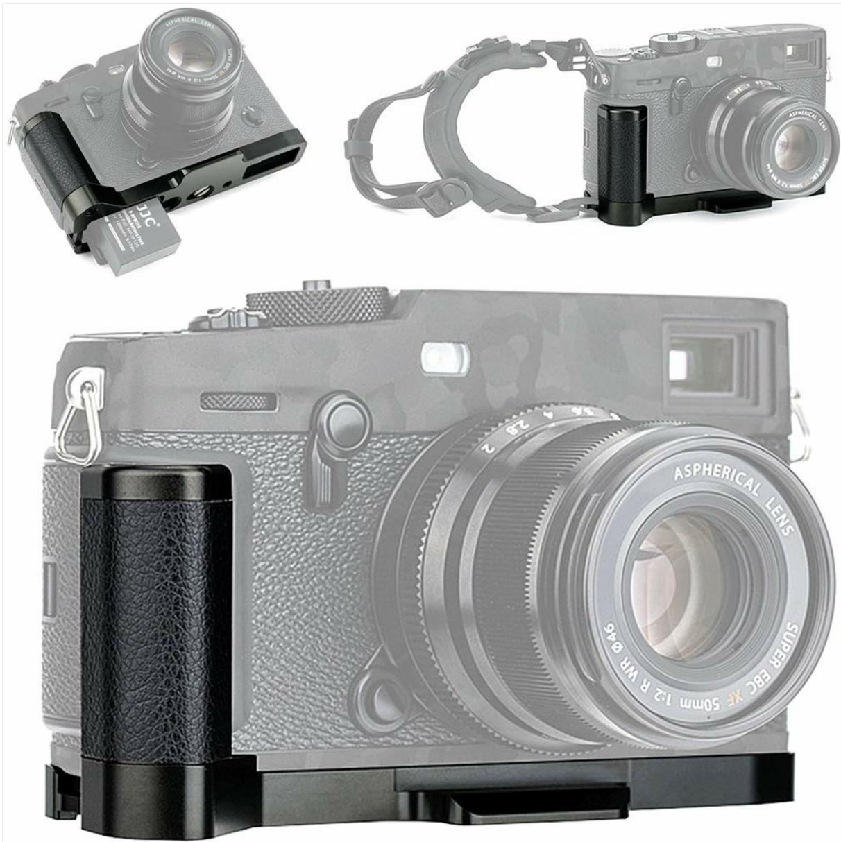
Figure 1: JJC Metal Hand Grip L Bracket attached to a Fujifilm X-Pro3 camera, offering a more comfortable and secure hold.