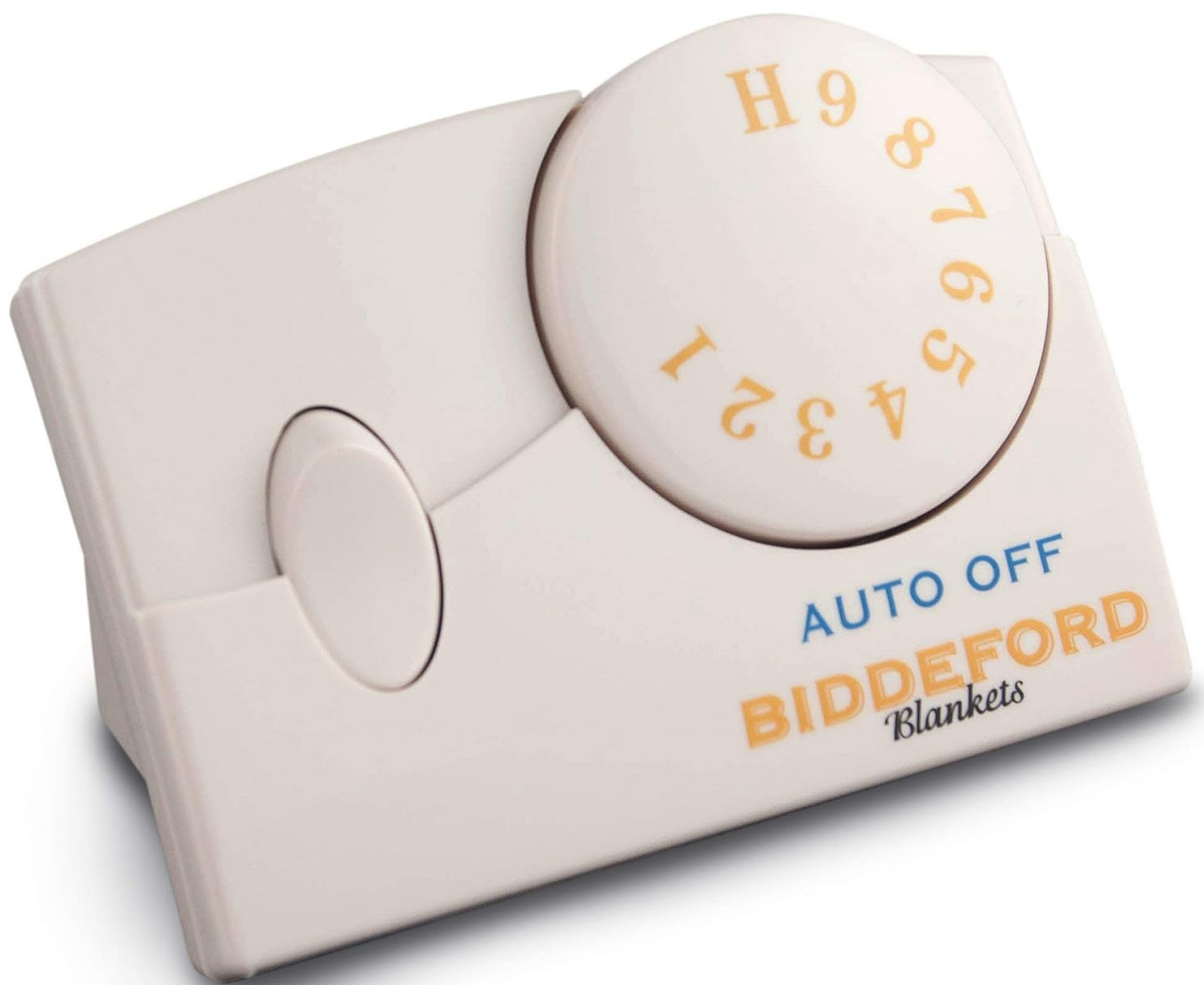
Figure 2: Close-up view of the analog controller.

Video 1: Official Biddeford Blankets video demonstrating general features and use. This video provides a visual overview of the product.