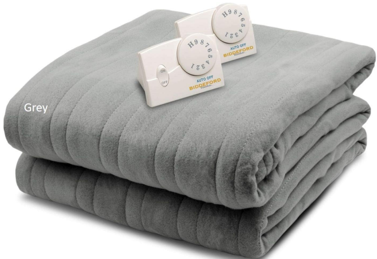
Figure 1: Biddeford Comfort Knit Electric Heated Blanket with Analog Controllers.