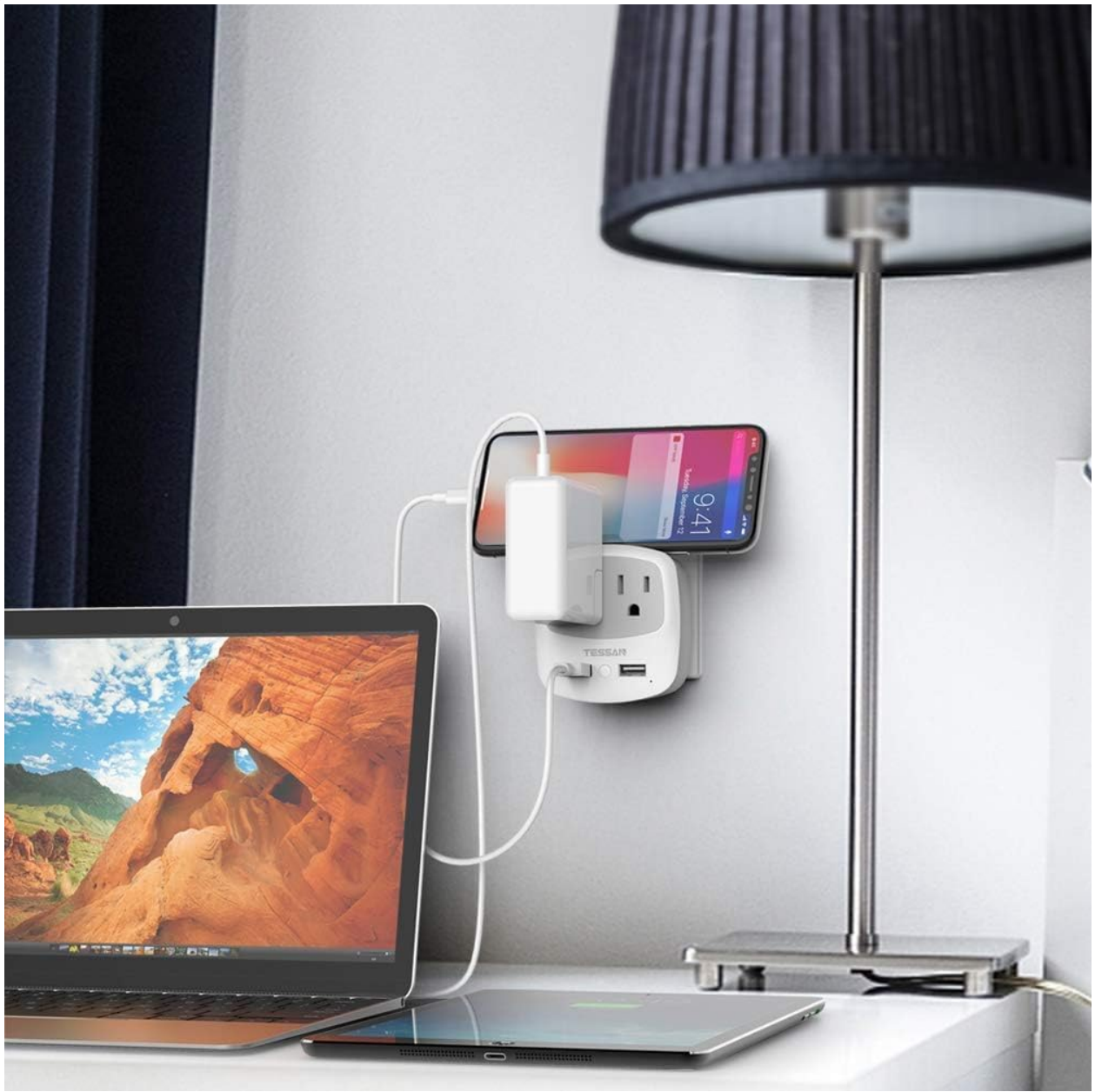
Image 3.3: An example of the adapter in use, charging multiple devices in a typical travel setting.