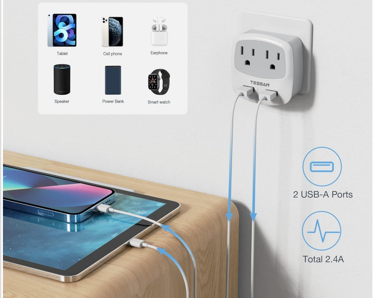
Image 3.1: Illustrates the use of the two USB ports for charging various portable electronic devices simultaneously.