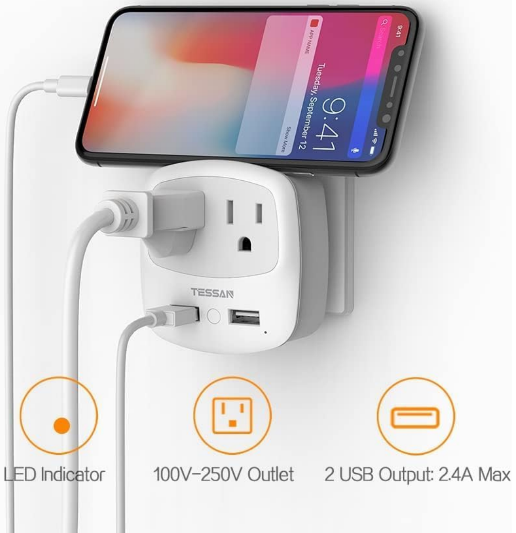
Image 3.2: Demonstrates the phone holder feature, showing a smartphone securely placed on top of the adapter while charging.