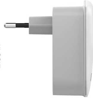
Image 2.2: Demonstrates the compact and lightweight design of the adapter, showing its dimensions and how it fits into a European wall socket.