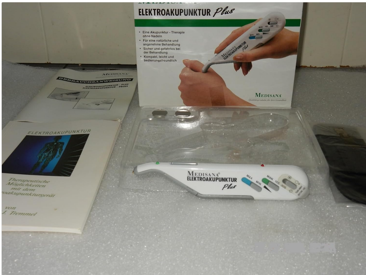
Image 1: The Medisana Electric Acupuncture Plus device shown with its retail packaging, illustrating its compact design and how it is held for use.