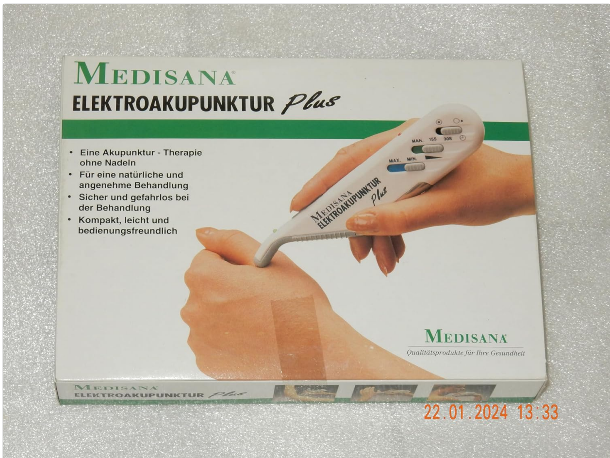
Image 3: A detailed view of the Medisana Electric Acupuncture Plus device, highlighting the MAX/MIN intensity buttons, 15S/30S duration buttons, and the stimulation tip.