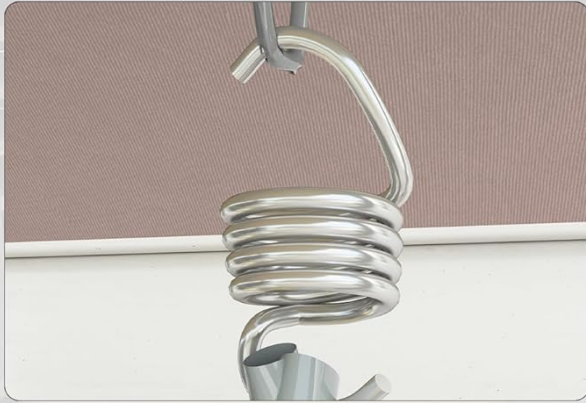
Metal Spring Hook for firmly hanging