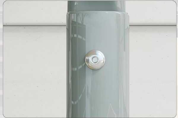
Sturdy Screws for steady construction