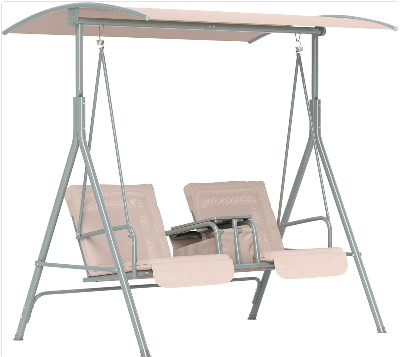
Figure 1: The Outsunny 2 Person Porch Swing with adjustable canopy and central console.