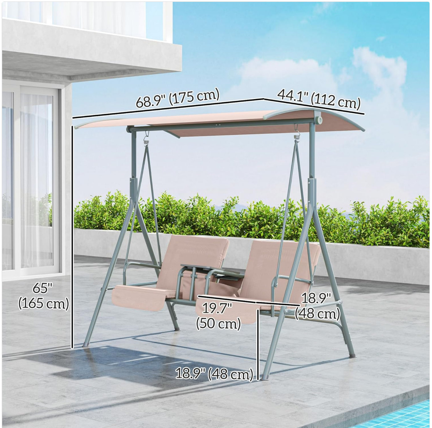
Figure 5: Dimensional overview of the Outsunny 2 Person Porch Swing.