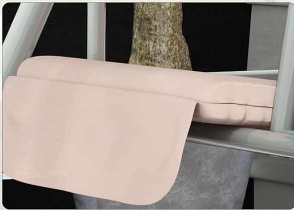
Well-padded Cushion for a comfortable seating experience