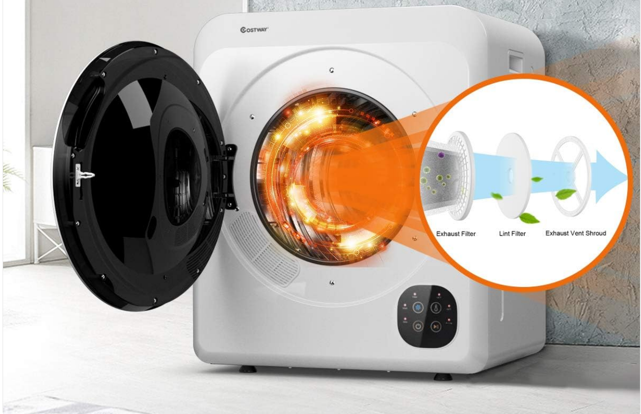
Figure 4: Visual representation of the dryer's multi-layer filtration system, designed to capture lint and remove odors.

3 layer filtration block floating matter remove odors