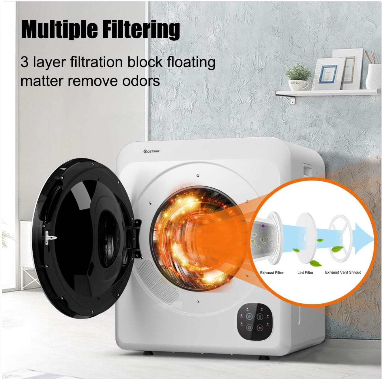
Figure 8: Detailed view of the dryer's filtration components, including the exhaust filter, lint filter, and exhaust vent shroud, with instructions for cleaning.