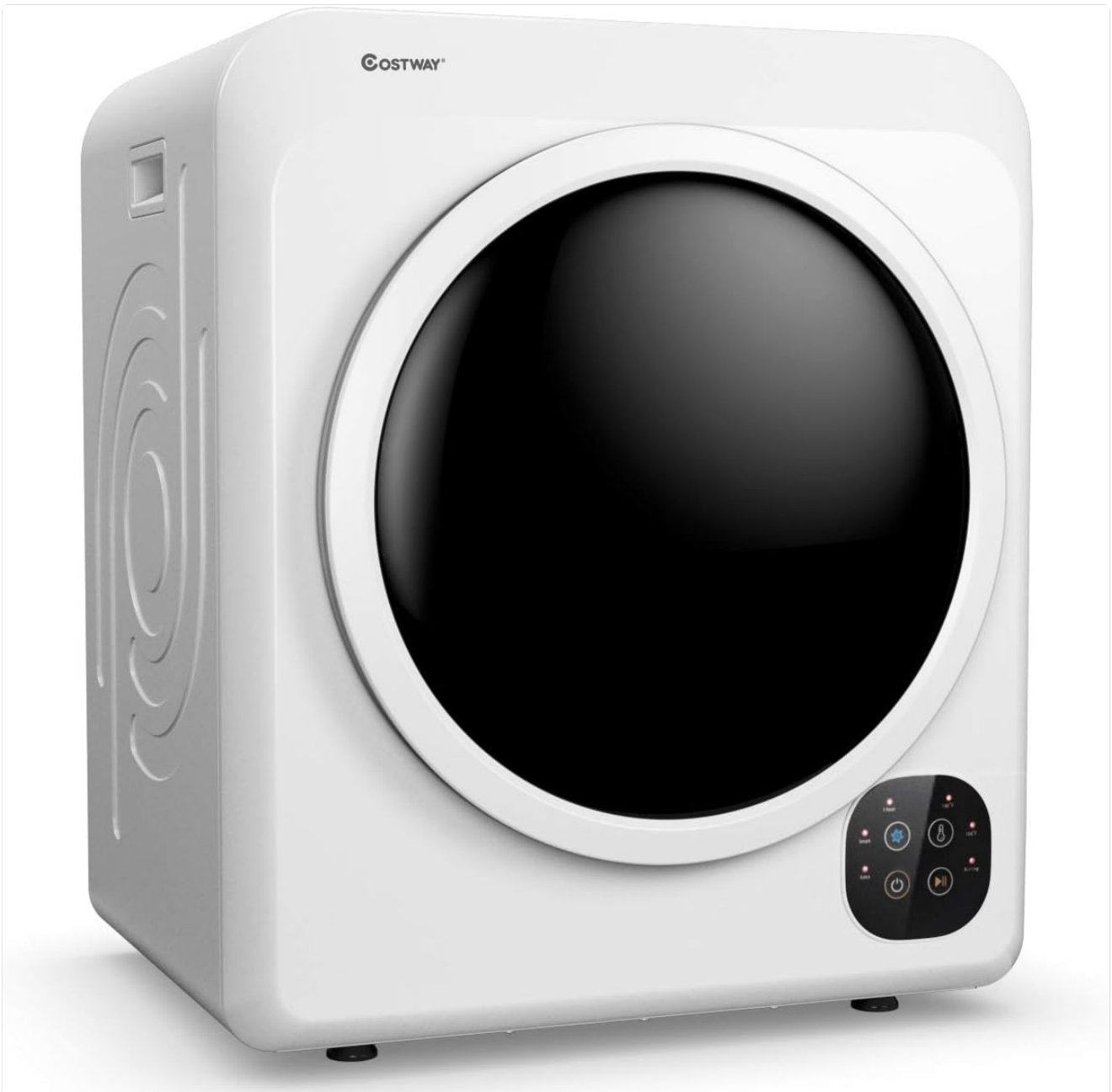
Figure 1: Front view of the COSTWAY Portable Clothes Dryer, showcasing its compact design and front-load access.