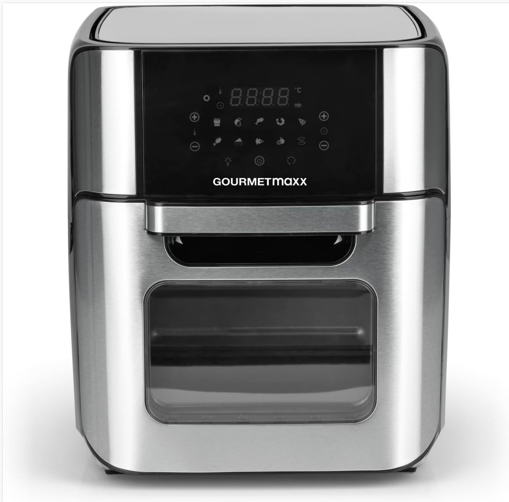
Image: Front view of the GOURMETmaxx Digital Hot Air Fryer, showcasing its sleek design, digital touch display, and transparent viewing window.

The GOURMETmaxx Digital Hot Air Fryer 12L combines the functions of a hot air oven, grill, and fryer. It features an intuitive touch display for easy operation and a viewing window to monitor cooking progress.