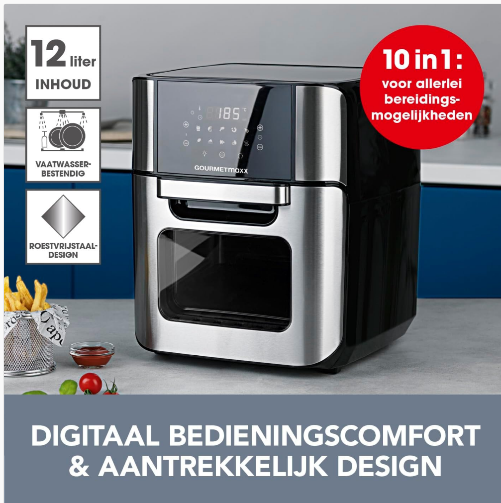
Image: The GOURMETmaxx Digital Hot Air Fryer 12L, highlighting its 12-liter capacity and 10-in-1 versatility for various cooking methods.

This manual provides essential information for the safe and efficient operation of your GOURMETmaxx Digital Hot Air Fryer 12L. Please read all instructions carefully before first use and retain this manual for future reference. This appliance is designed for preparing a variety of dishes with hot air, offering a fat-reduced alternative to traditional frying methods.