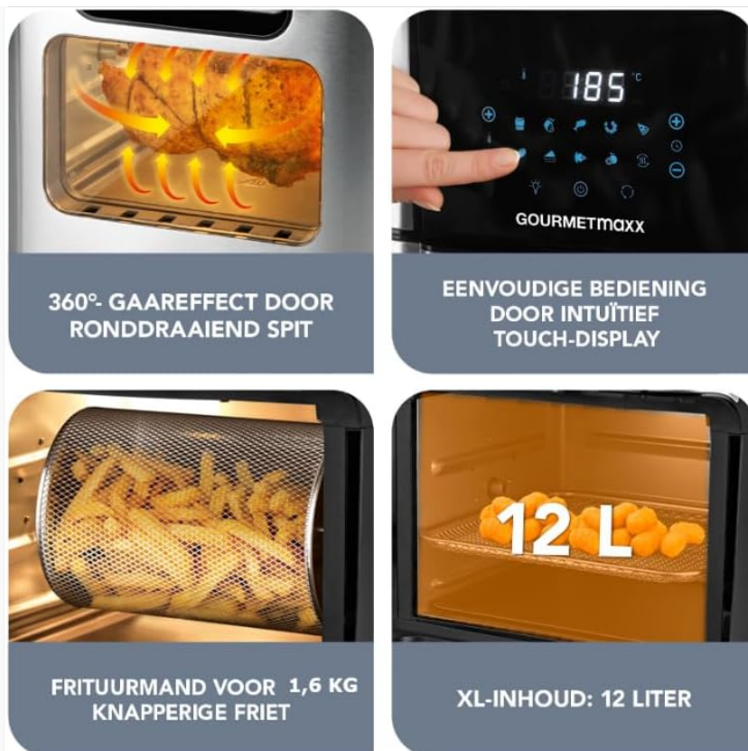
Image: Visual representation of the 360° cooking effect, intuitive touch controls, the fry basket for crispy fries, and the generous 12-liter capacity.