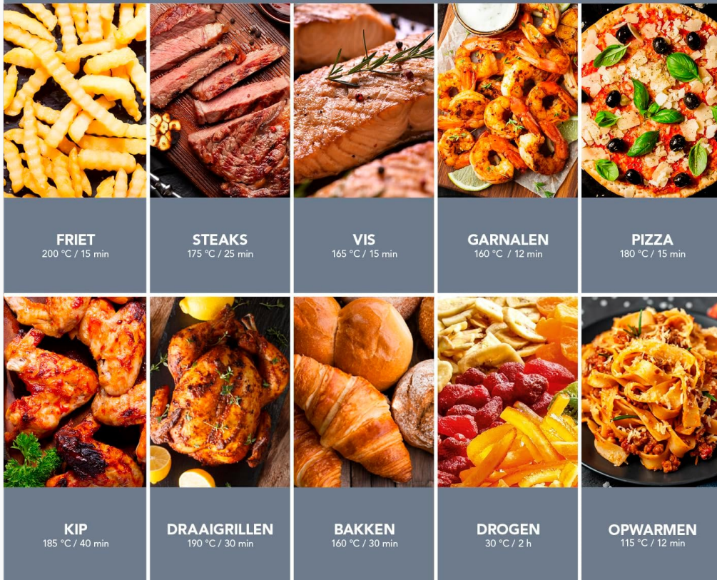
Image: A visual guide to the 10 pre-programmed cooking functions, including recommended temperatures and times for various foods like fries, steak, fish, shrimp, pizza, chicken, rotisserie, baking, drying, and reheating.