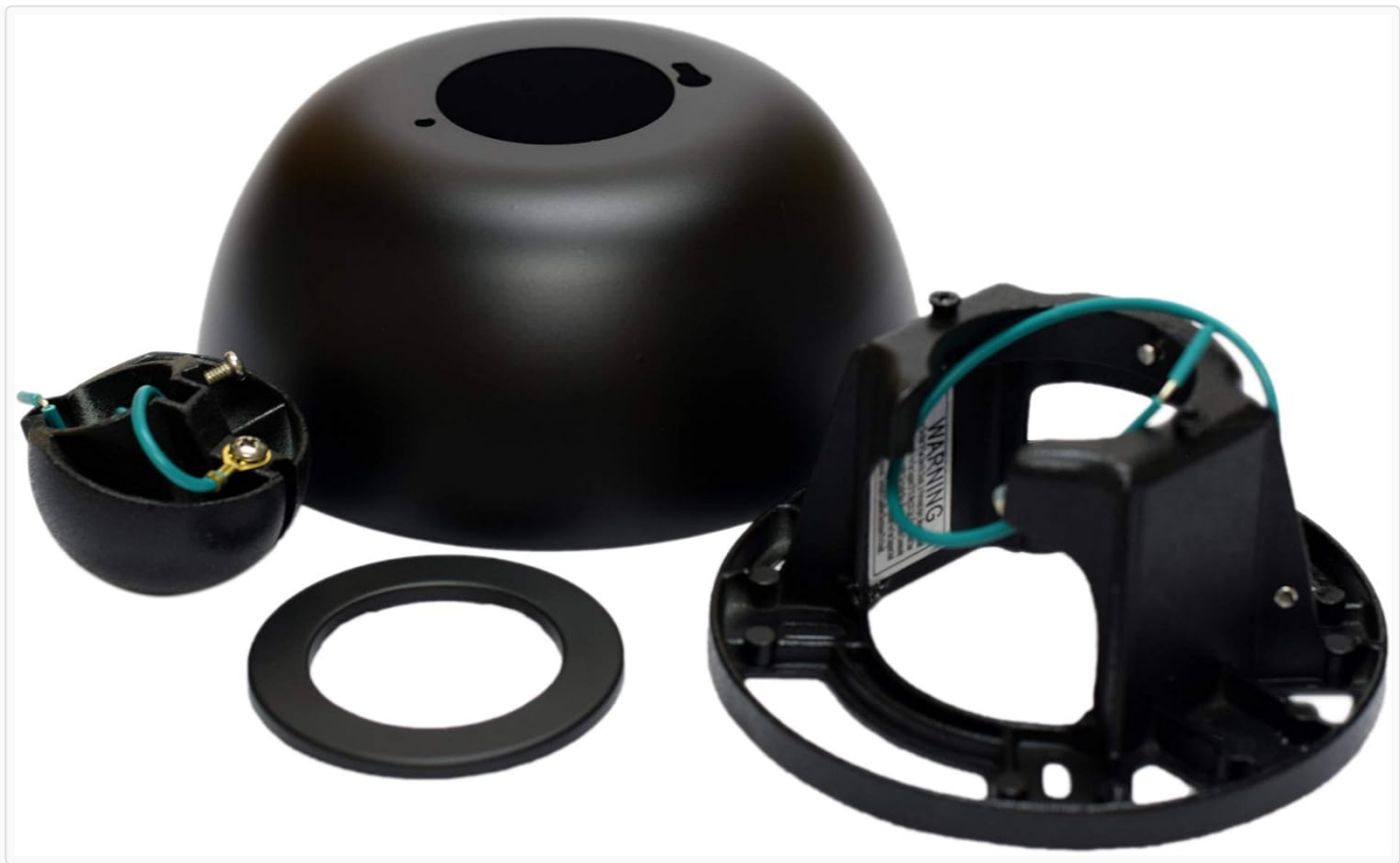
Image 1.1: Components of the Fanimation Sloped Ceiling Kit, including the hanger bracket, hanger ball, ceiling canopy, and canopy screw cover, all in a black finish.