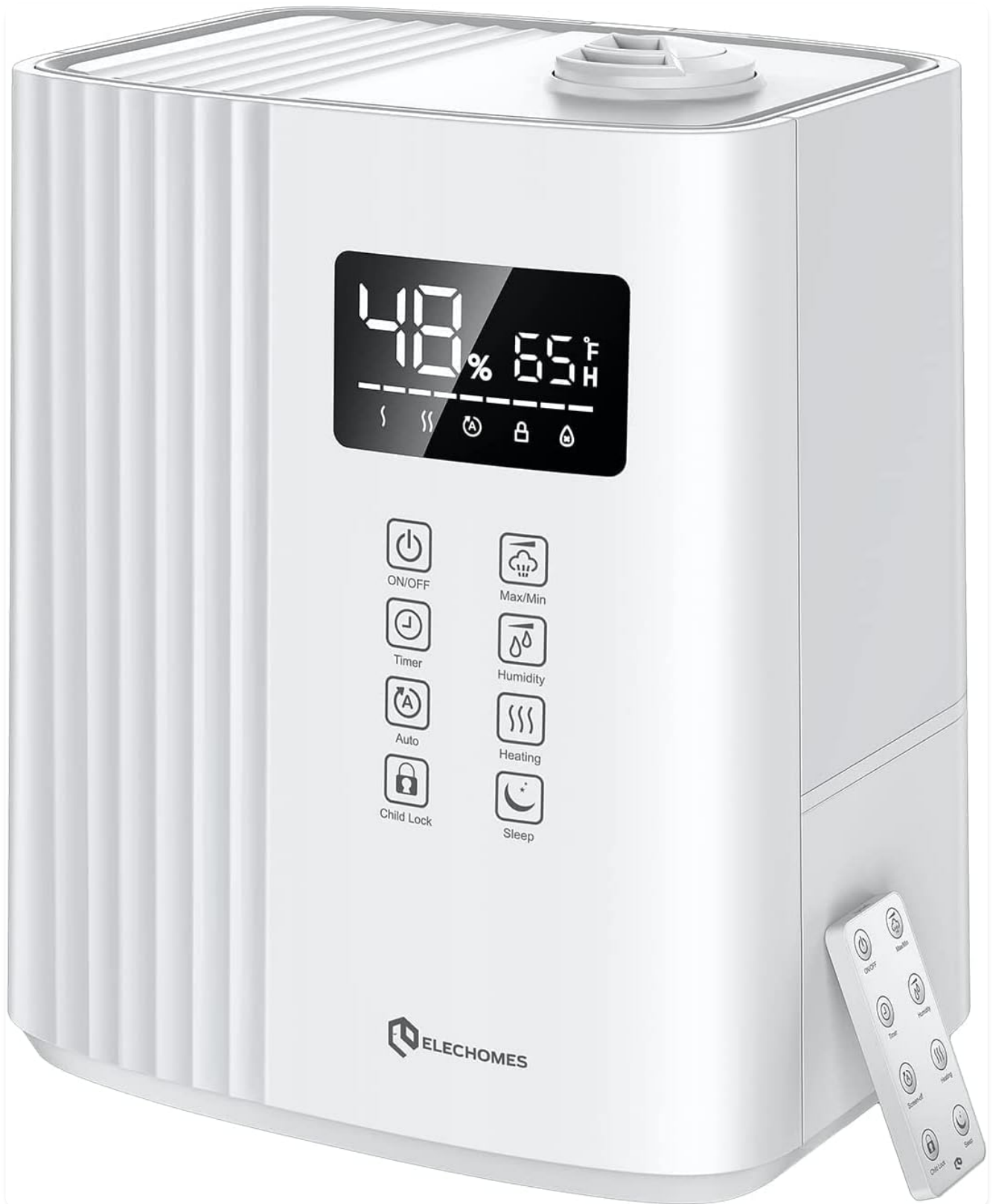
Figure 4.1: The main unit's control panel and accompanying remote control for easy operation.

Learn how to operate your Elechomes SH8830 Humidifier using its intuitive control panel or remote control.