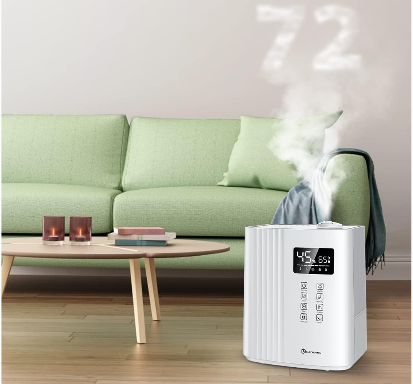
Figure 3.1: The humidifier's 6.5L capacity allows for up to 72 hours of use, and its top-fill design simplifies refilling.

Top-fill design allowing refill water without any detachment. Get rid of frequent water filling thanks to this 6.5L capacity water tank. Lasts up to 72 hours on low mist.