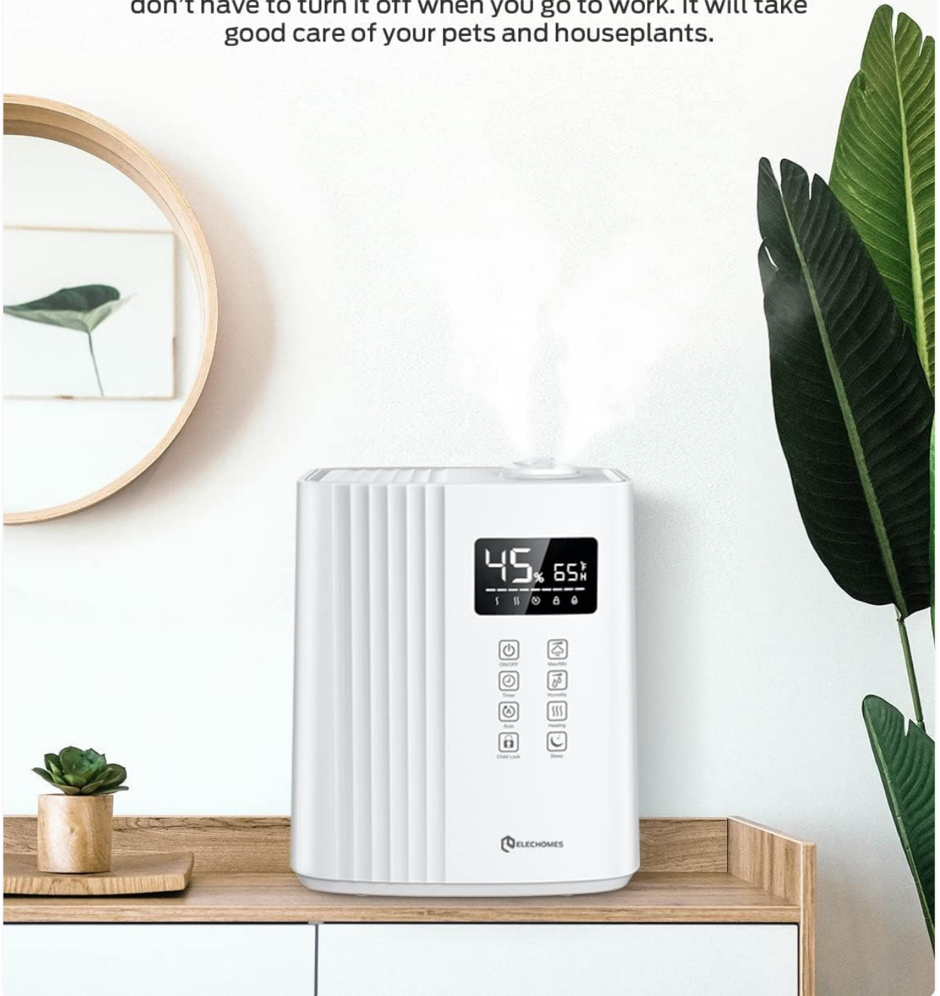
Figure 4.2: Set the humidifier to automatically turn off using the 1-12 hour timer function.

Tap the timer button to set the working time (1-12h). You don't have to turn it off when you go to work. It will take good care of your pets and houseplants.