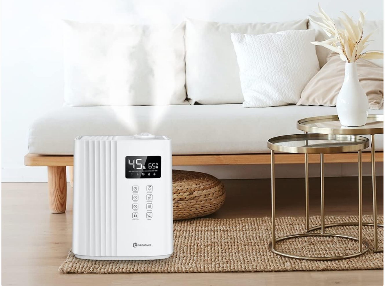
Figure 3.2: The humidifier includes an essential oil tray for aromatherapy, allowing users to add their favorite scents.

Your browser does not support the video tag.