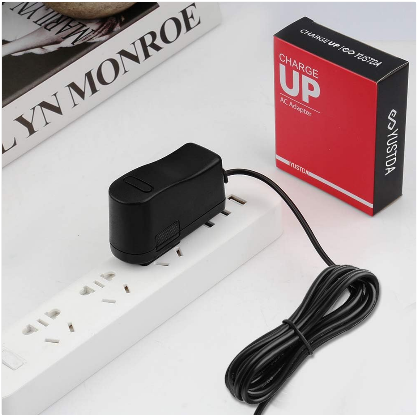
Image 3.1: The AC adapter connected to a power strip, ready for use.