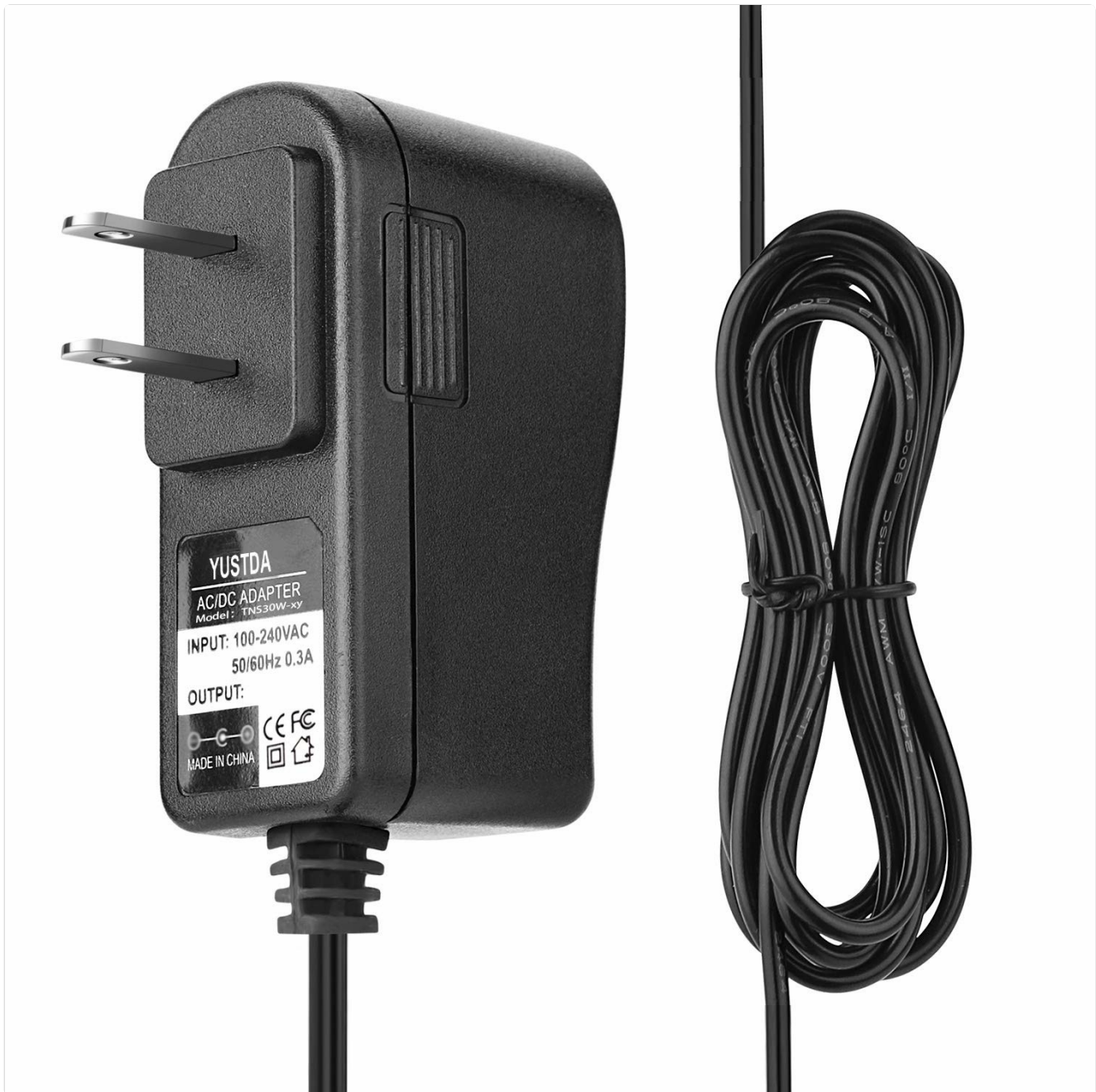
Image 1.1: Front view of the YUSTDA AC Adapter, displaying its model and electrical specifications.