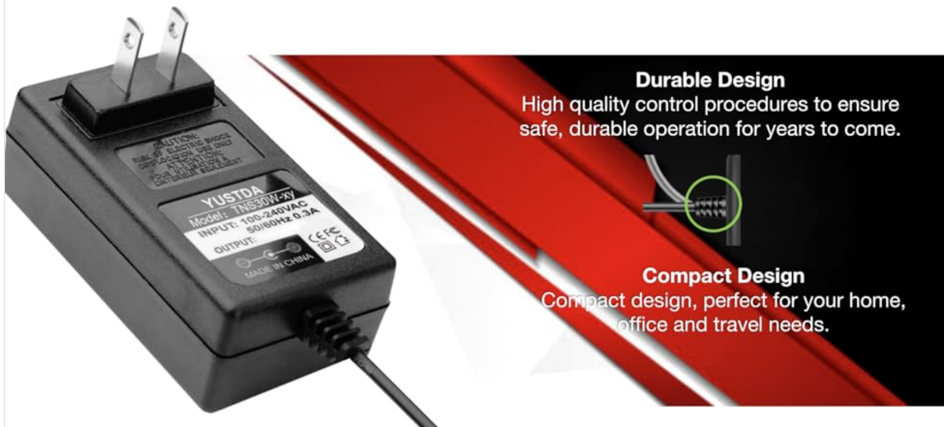
Image 4.1: The adapter's durable construction and compact form factor.