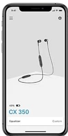
Image: A smartphone displaying the Sennheiser Smart Control app, illustrating customization options.

Download the Sennheiser Smart Control app for additional features, including equalizer adjustments and firmware updates. The app allows you to customize your audio experience.