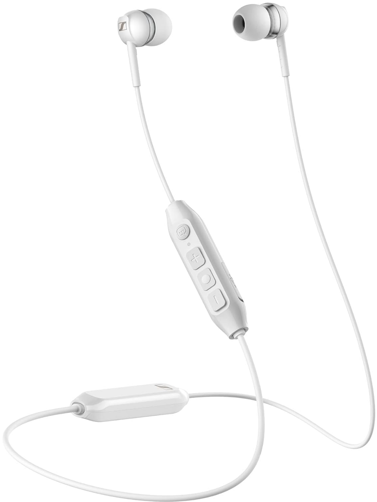
Image: Sennheiser CX 350BT Earphones, showing the neckband design and earbuds.