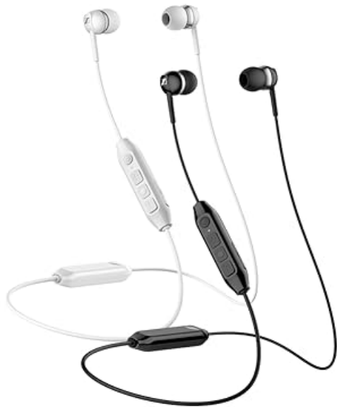
Image: Close-up view of the CX 350BT neckband, highlighting the charging port and battery unit.