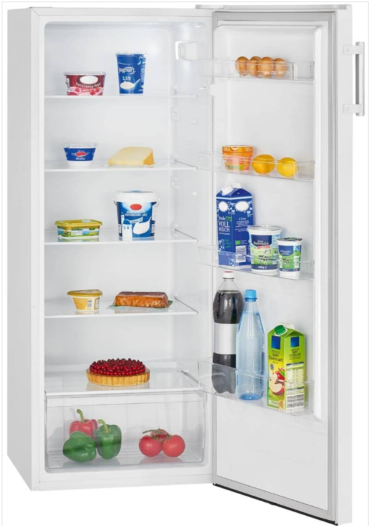
Figure 1: Refrigerator Dimensions (Width: 55.1 cm, Height: 143.4 cm, Depth: 54.2 cm)