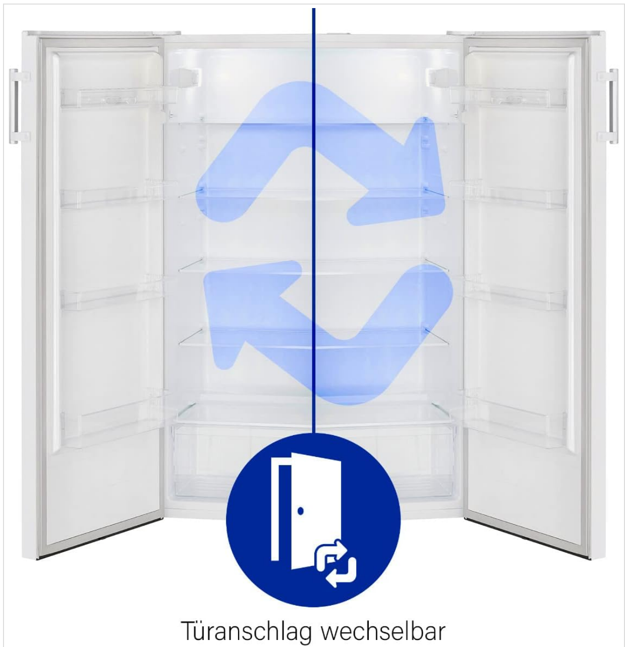
Figure 2: Reversible Door Hinge Feature