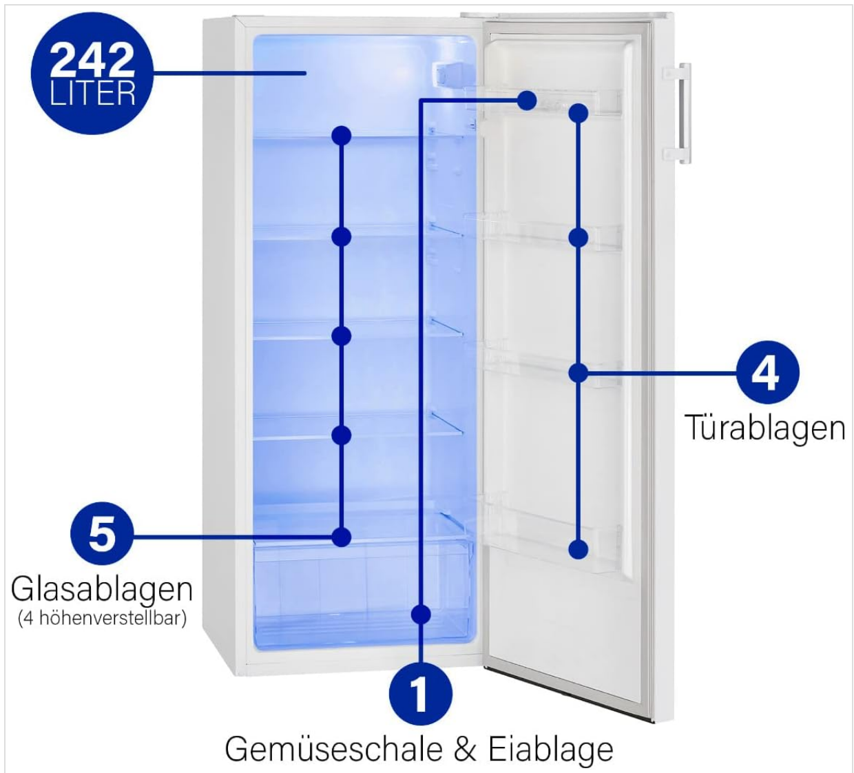
Figure 3: Refrigerator Internal Layout

The Bomann VS 7316.1 offers a net capacity of 242 liters, designed for efficient food storage. It includes 5 adjustable glass shelves, 4 door bins, and a transparent vegetable crisper with an egg tray.