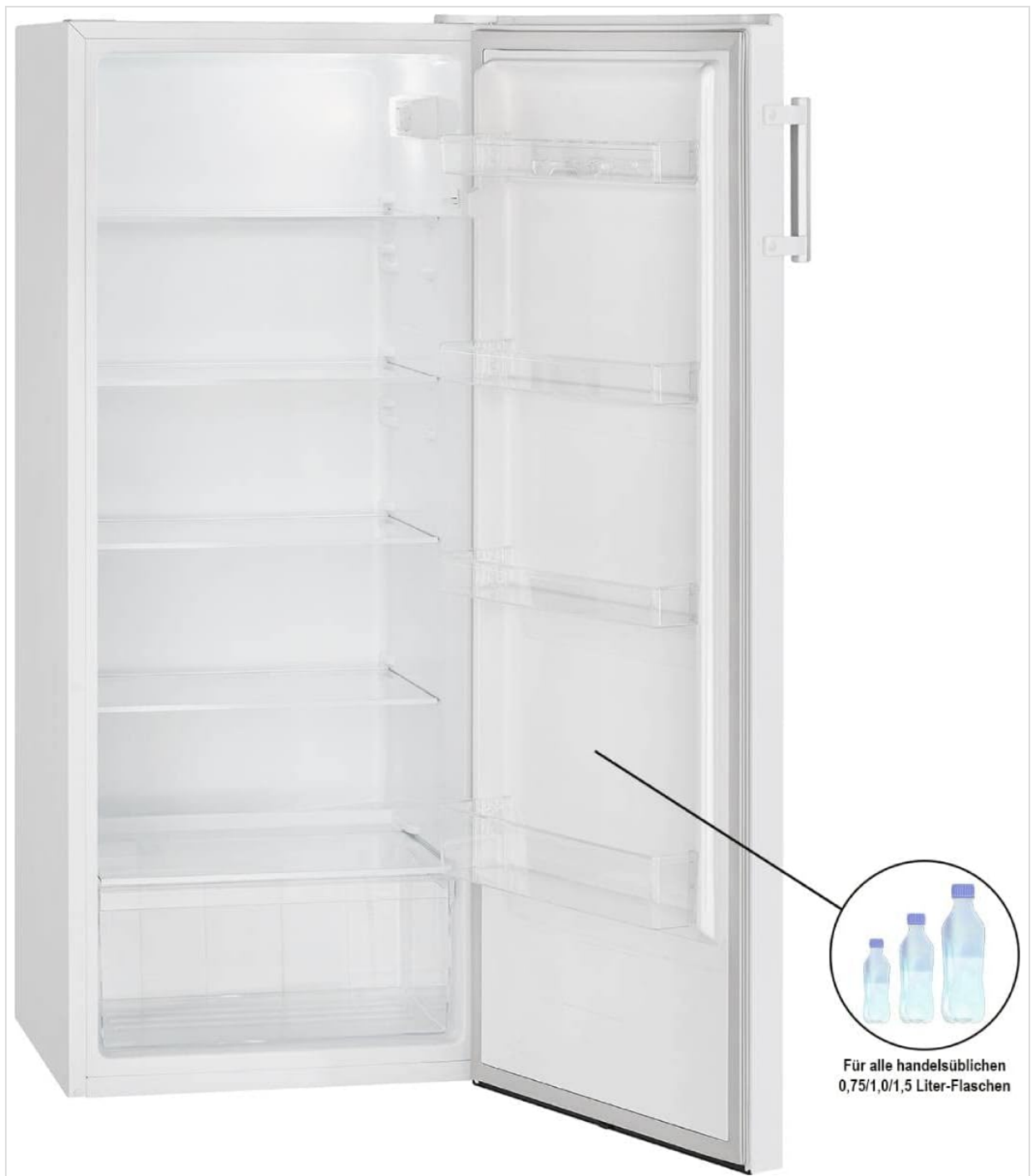
Figure 5: Bottle Storage in Door Bins