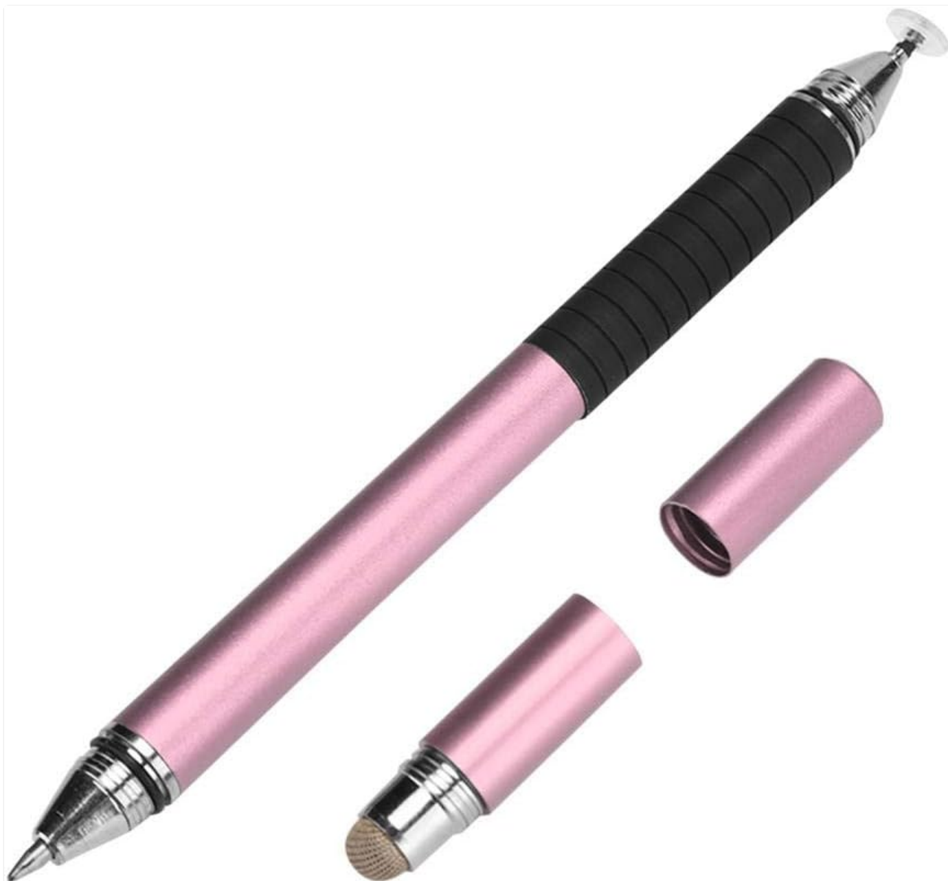
Image: A detailed view of the stylus, highlighting the ballpoint pen and the cloth tip, with the protective cap removed.