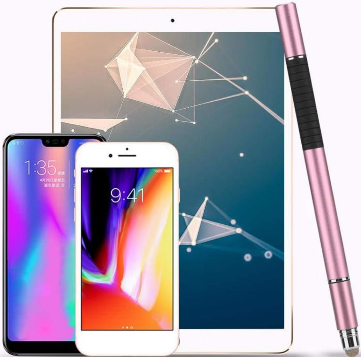
Image: The stylus positioned alongside a tablet and two smartphones, highlighting its wide compatibility.

This capacitive stylus is suitable for iPhone/iPad and other touch-screen mobile phones.