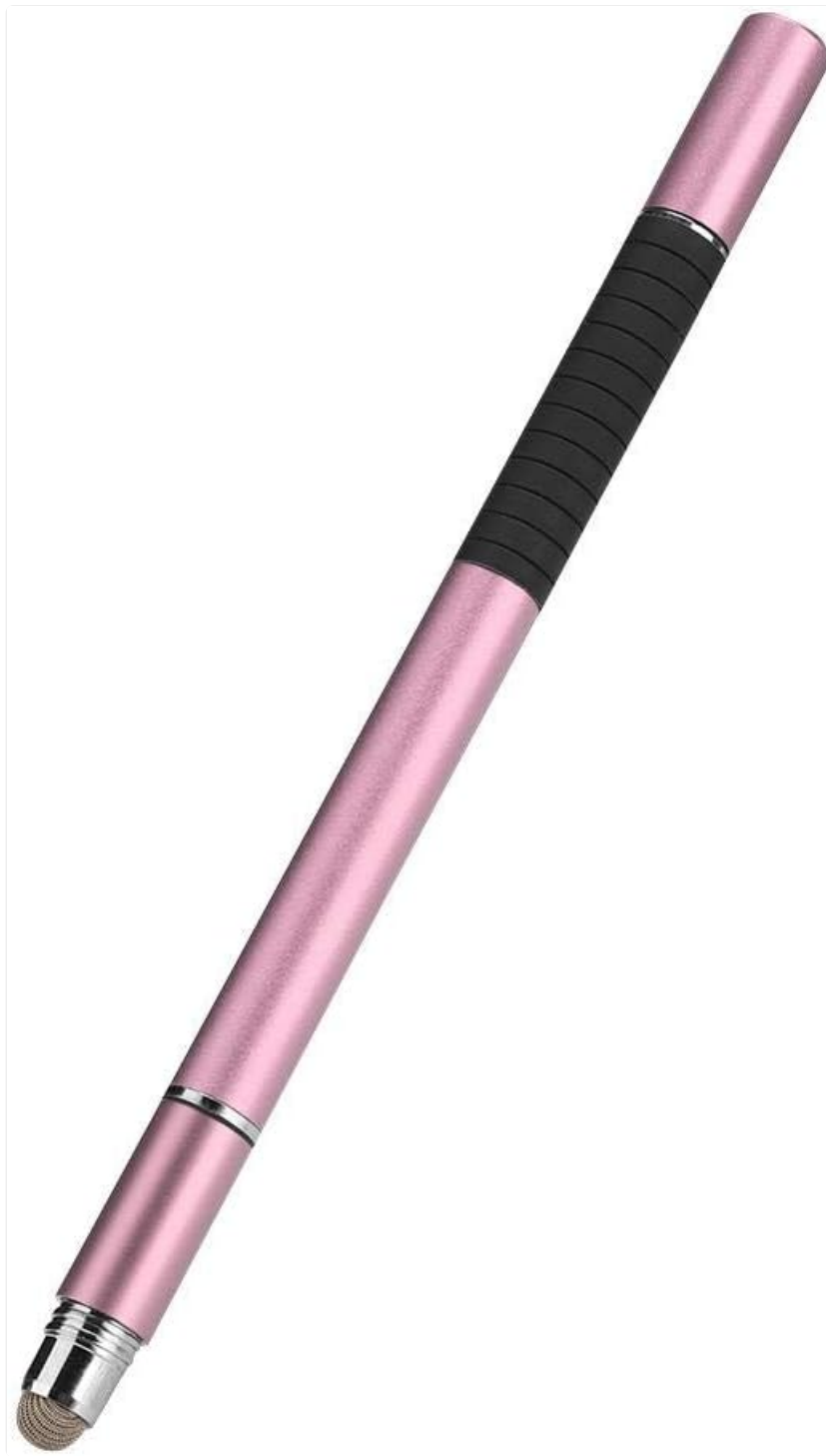
Image: The Bewinner 3-in-1 Capacitive Stylus, showcasing its sleek gold design with a black grip.