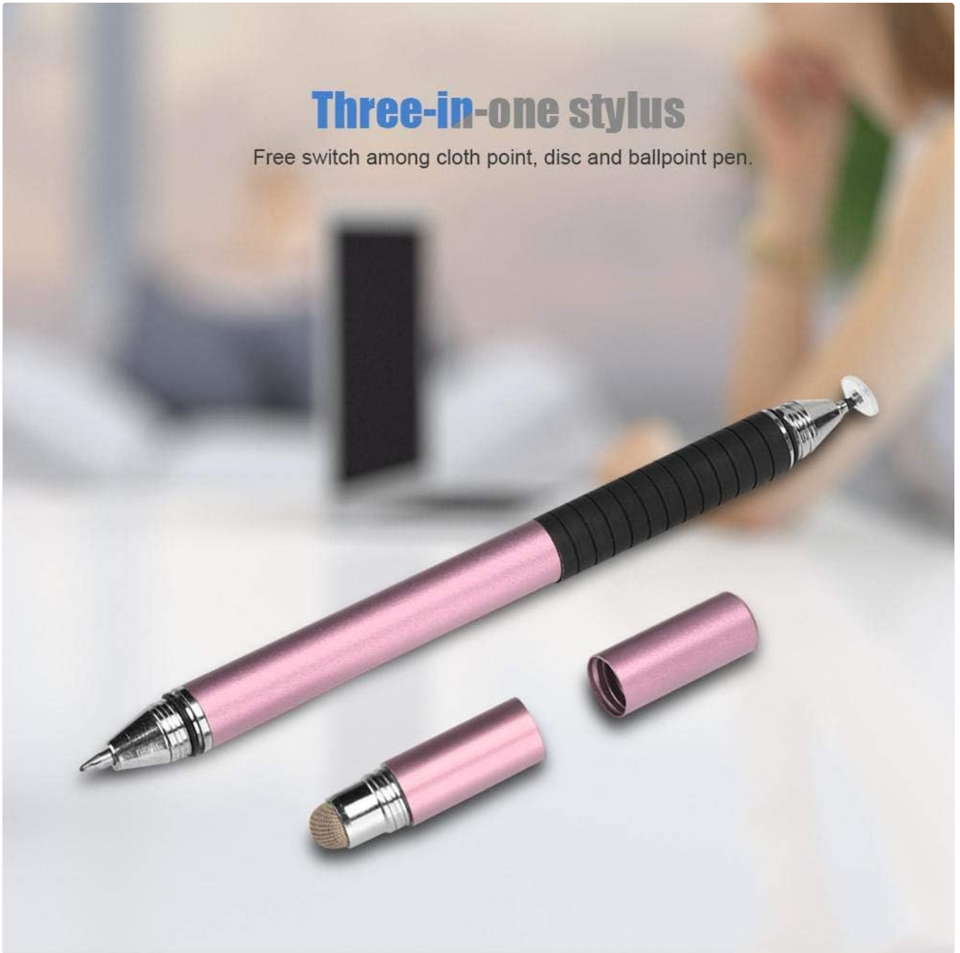
Image: The stylus disassembled to show its three distinct tips: the cloth tip, the transparent disc tip, and the ballpoint pen.

Free switch among cloth point, disc and ballpoint pen.