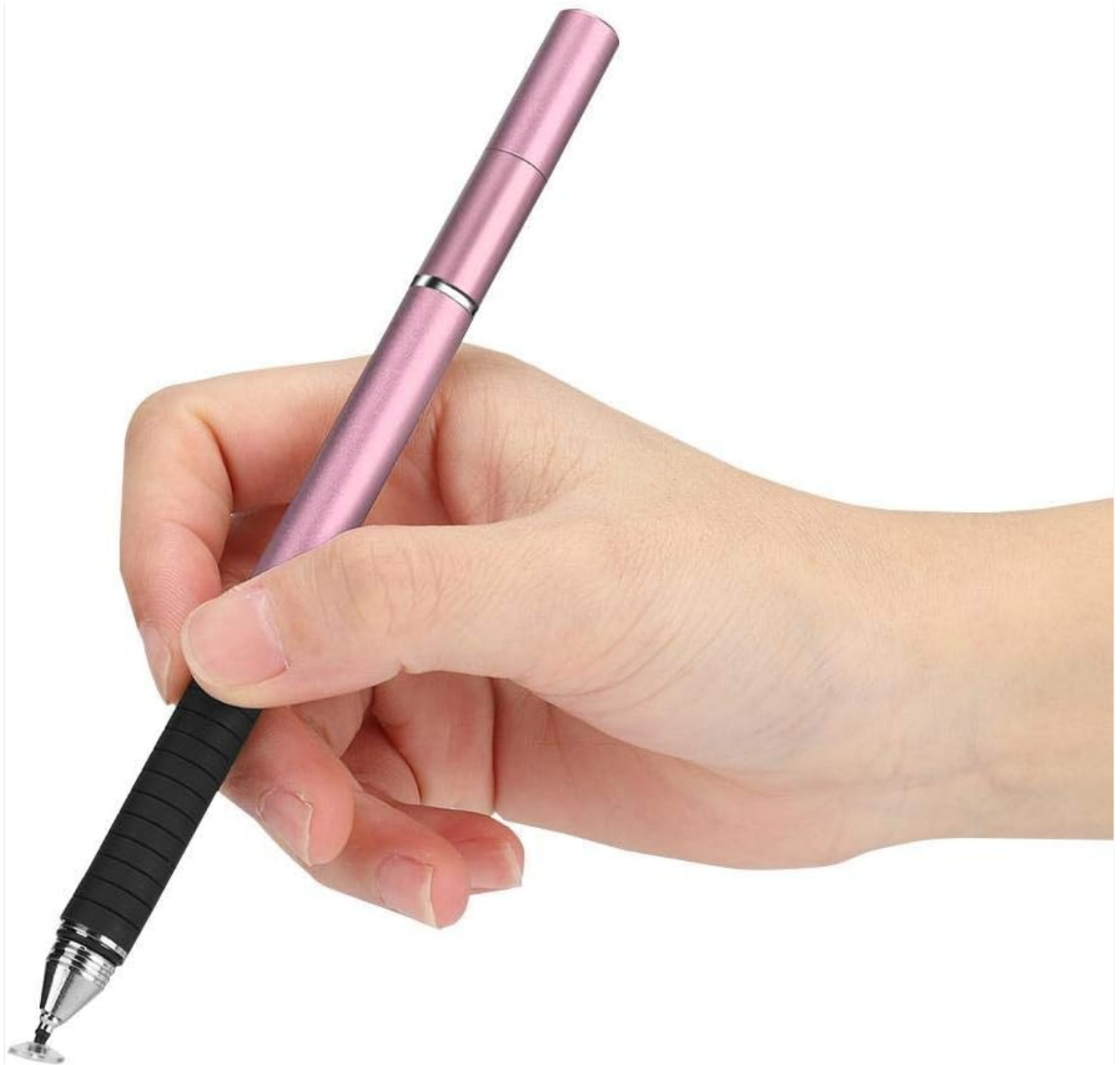
Image: A hand demonstrating the proper grip and angle for using the transparent disc tip on a touch screen.