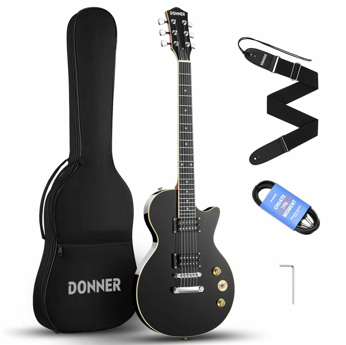
Image: The Donner DLP-124B Electric Guitar, a full-size 39-inch LP style instrument.