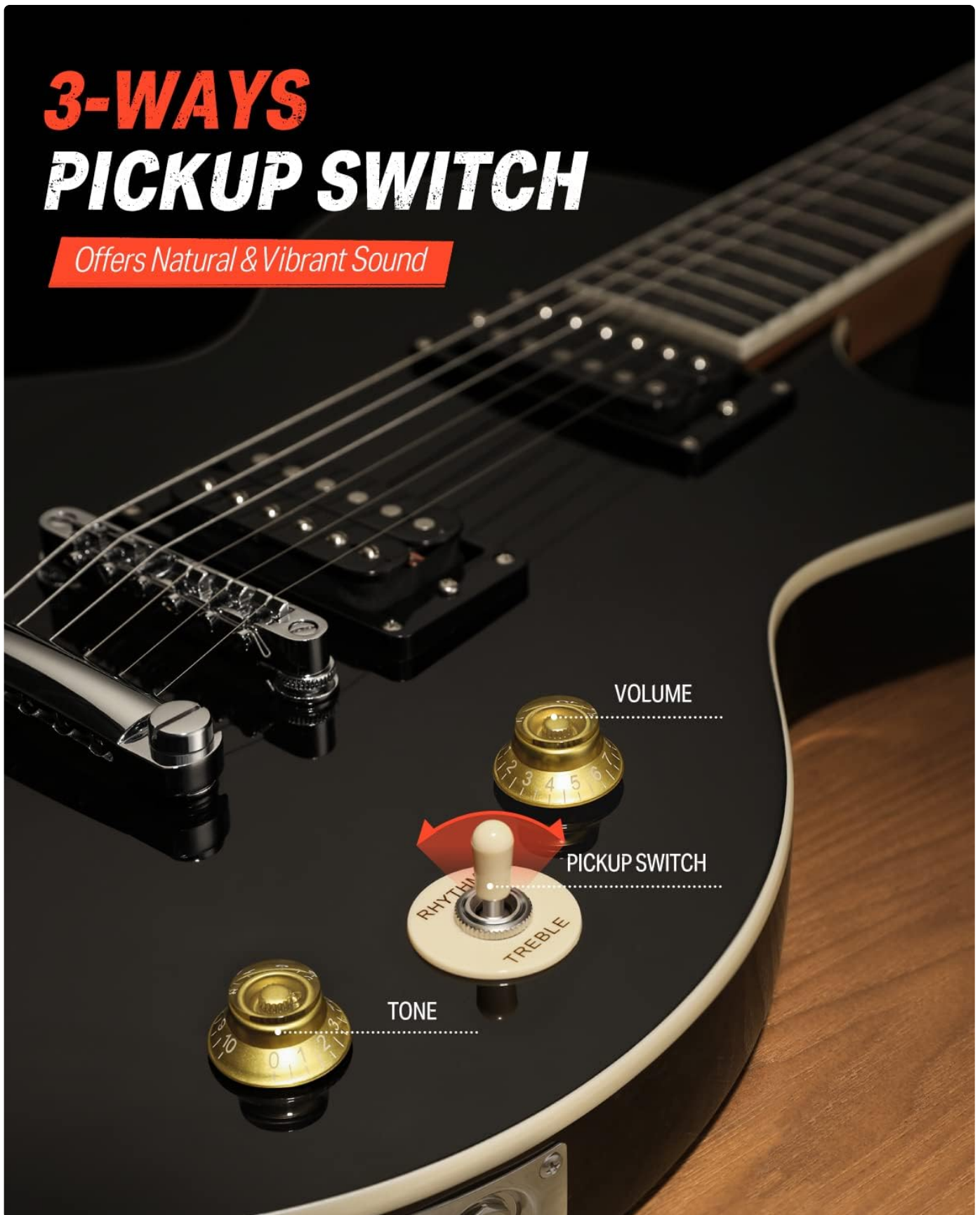
Image: Close-up view of the guitar's control knobs and the 3-way pickup selector switch.

Your browser does not support the video tag.