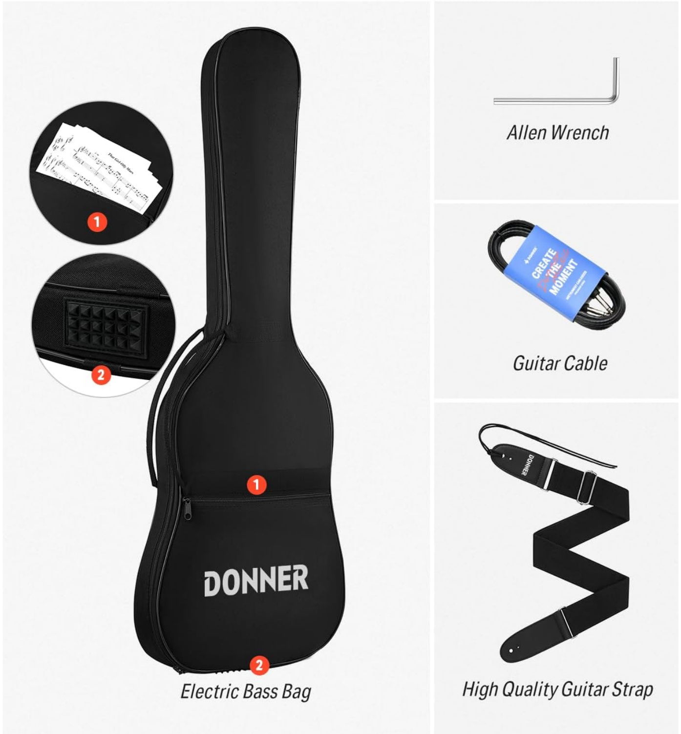
Image: The DLP-124B electric guitar shown with its included gig bag, strap, and cable.

Your browser does not support the video tag.