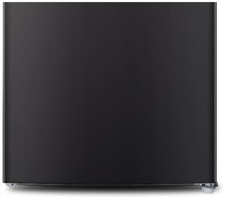
Front view of the CHI Q FBM351NEI42 combined refrigerator-freezer.