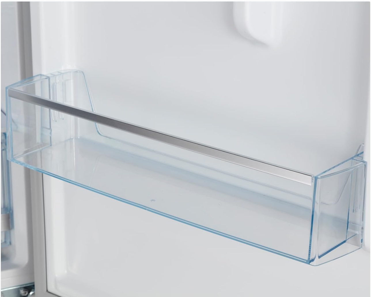
Close-up of a door shelf in the refrigerator compartment.