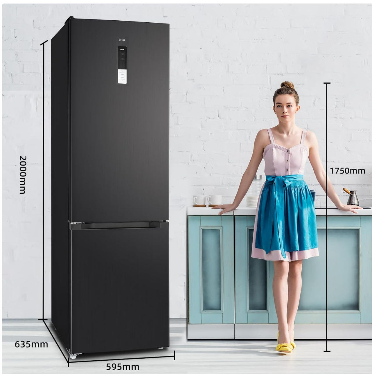
Dimensions of the refrigerator-freezer: 2000mm (height), 595mm (width), 635mm (depth).