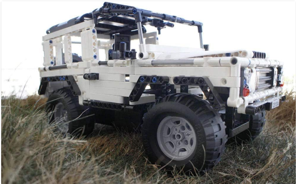
A close-up view of one of the large, textured tires and the detailed wheel hub of the CaDA C51004W, designed for off-road performance.