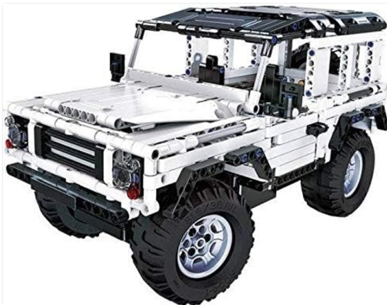
Front-left view of the assembled CaDA C51004W Remote Control Off-Road Vehicle, showcasing its white body, black roof, and large tires.

The assembled vehicle measures approximately 360 x 180 x 180 mm (Length x Width x Height) and is suitable for both indoor and outdoor driving. Its robust design and 2-channel remote control provide excellent maneuverability.