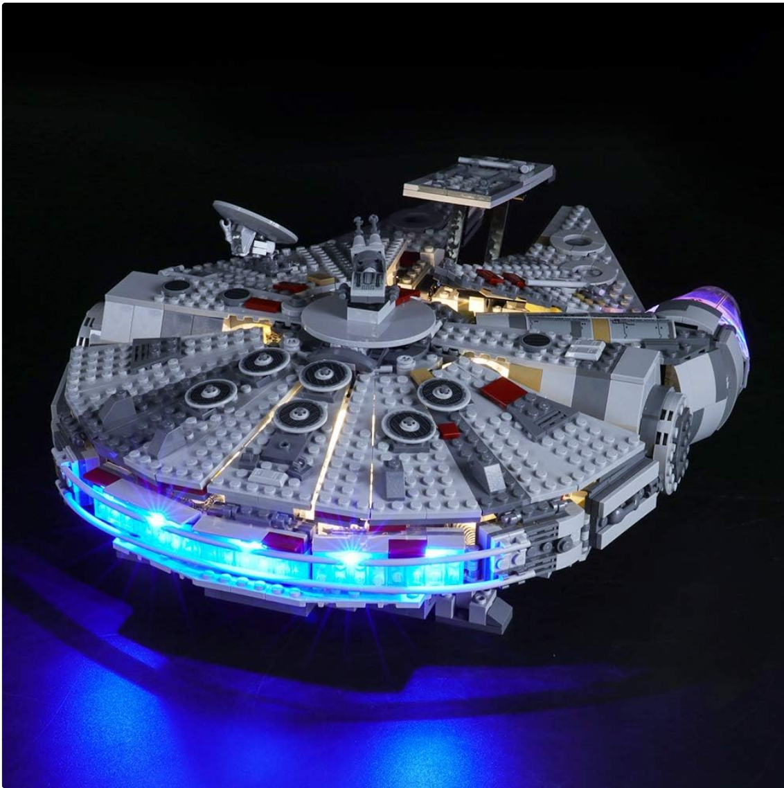
The LEGO 75257 Millennium Falcon model illuminated with the BRIKSMAX LED lighting kit, showcasing the vibrant blue engine lights and subtle interior lighting.