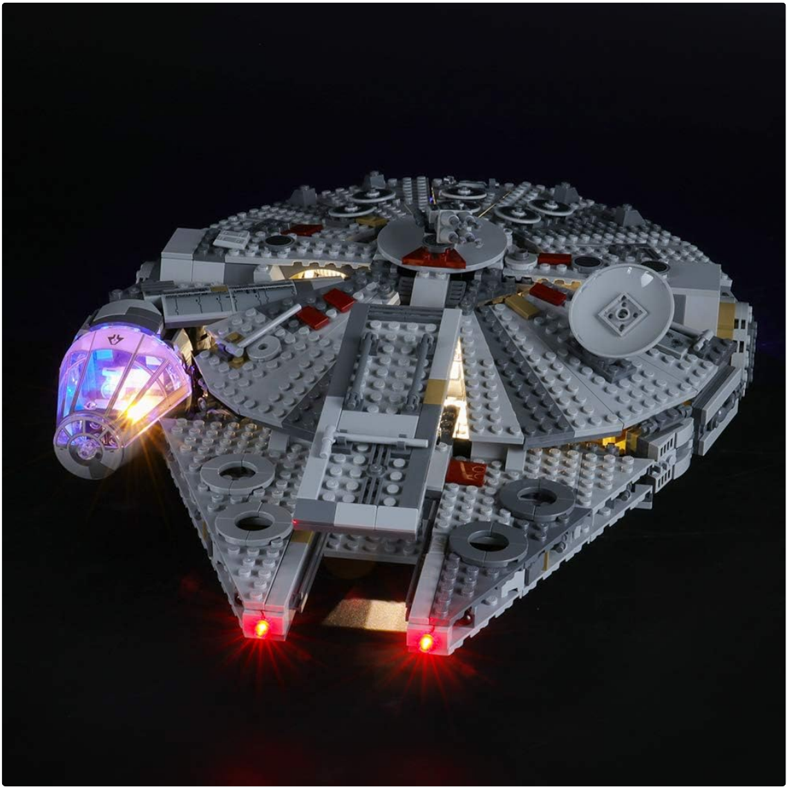
The front section of the Millennium Falcon with cockpit and front lights activated.