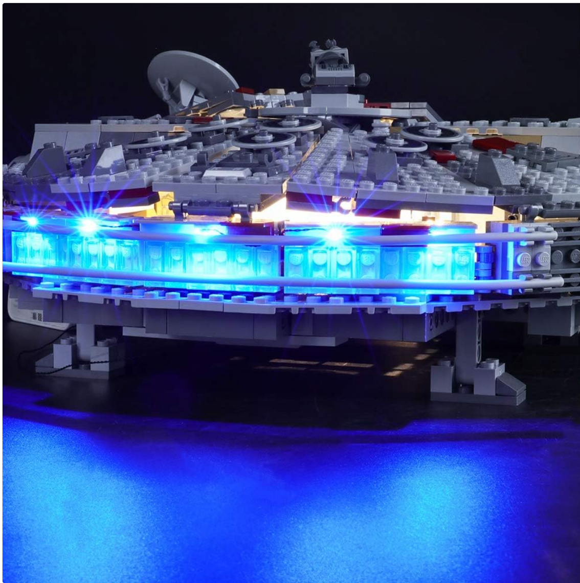
A detailed view of the blue engine lights, providing a dynamic effect to the model.