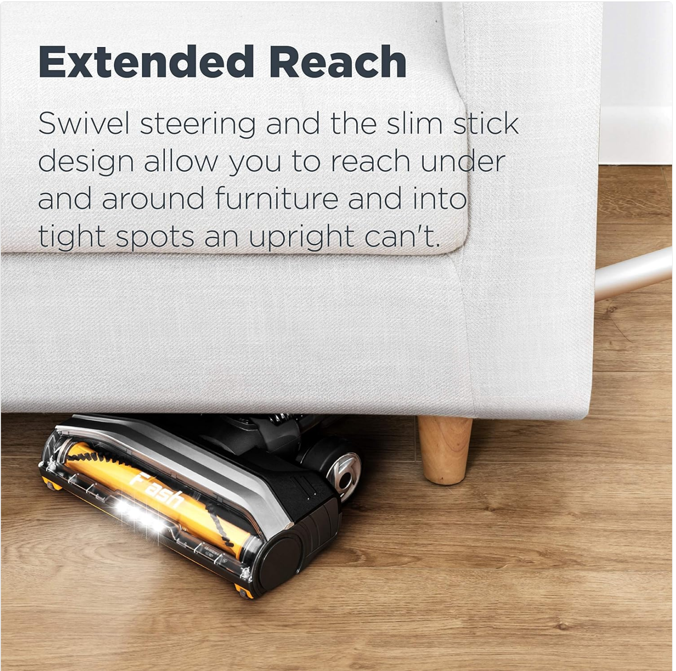
Image: The Eureka Flash NES510's floor nozzle with its LED headlights illuminated, reaching under a piece of furniture to show its extended reach and ability to spot hidden debris.

Swivel steering and the slim stick design allow you to reach under and around furniture and into tight spots an upright can't.