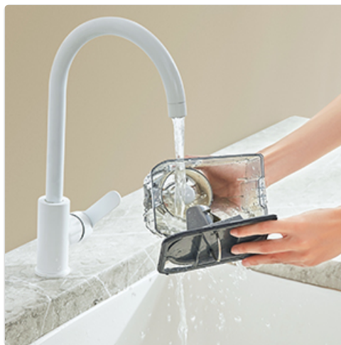
Image: A hand holding a vacuum filter under a running faucet, illustrating the process of rinsing the filter with water for cleaning.