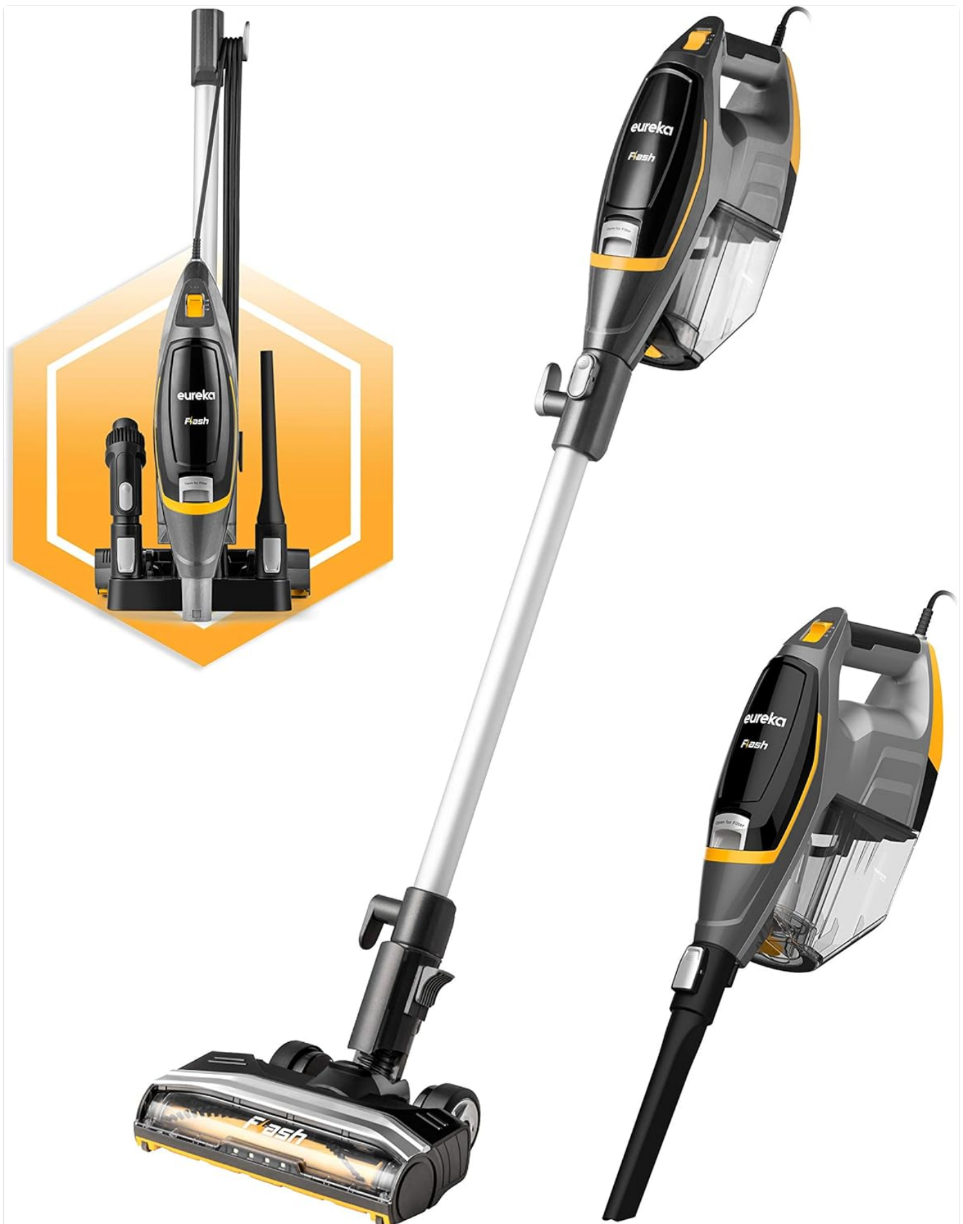
Image: An exploded view of the Eureka Flash NES510 showing the main vacuum unit, extension wand, floor nozzle, and accessories, illustrating how they connect.