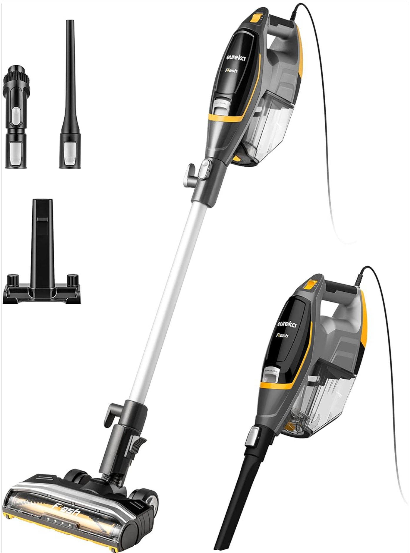
Image: The Eureka Flash NES510 stick vacuum in its full assembly, along with the handheld unit, extension wand, motorized floor nozzle, crevice tool, 2-in-1 dusting brush, and the portable storage base.