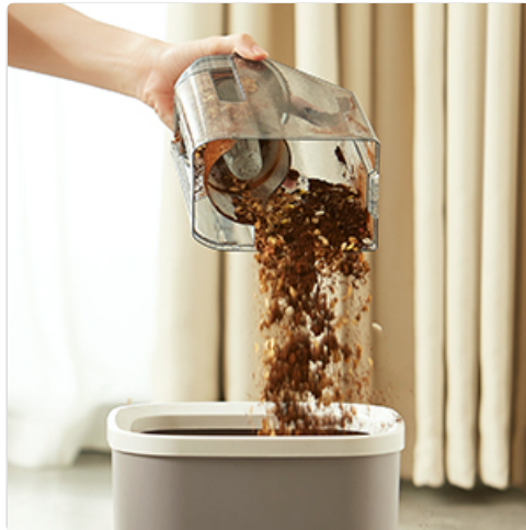
Image: A hand holding the transparent dust cup of the vacuum cleaner, tilting it to empty collected dirt and debris into a waste bin, demonstrating the easy-empty feature.