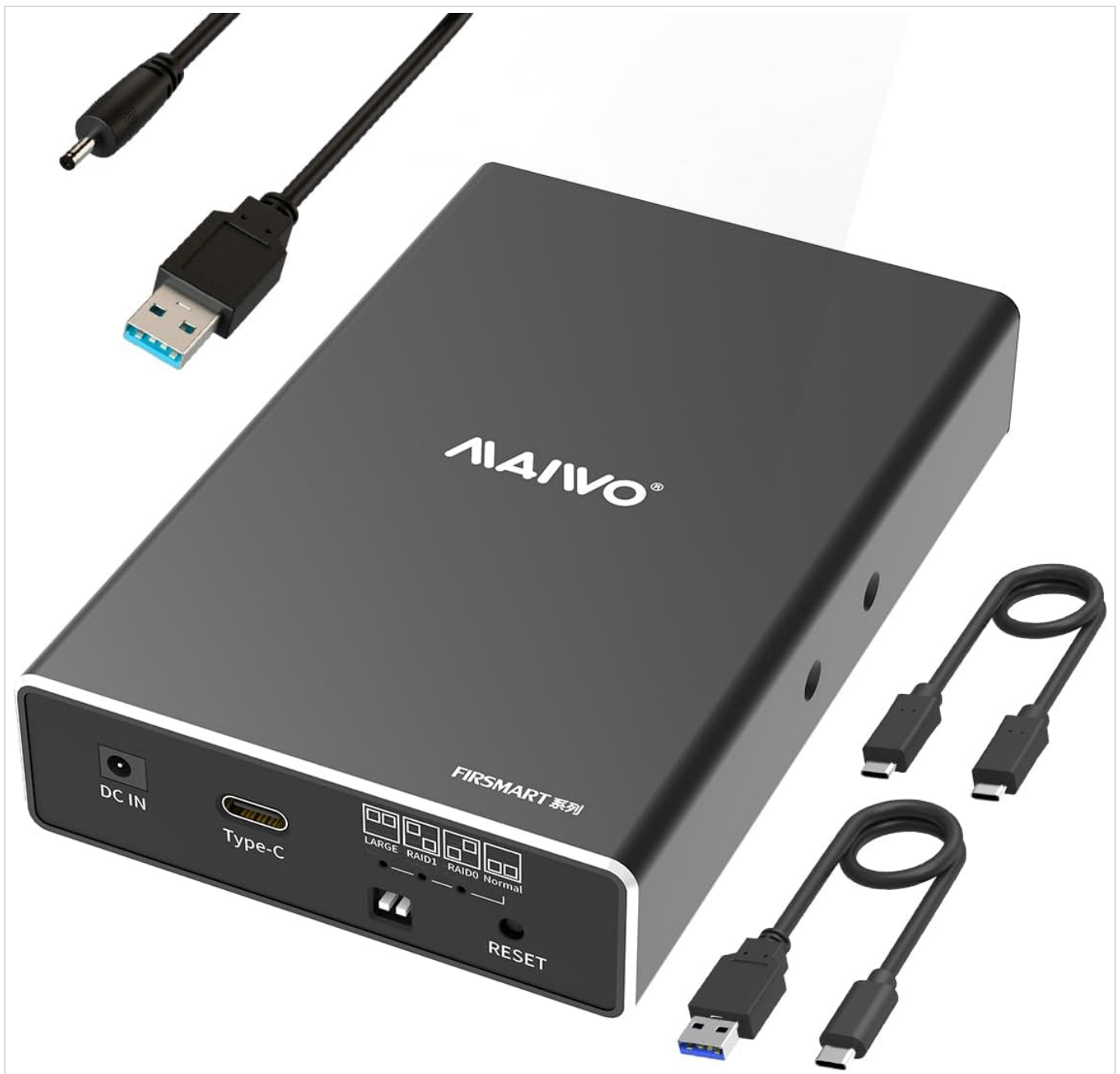
Image: The MAIWO K25272C Dual Bay Hard Drive RAID Enclosure, showcasing its compact design and included USB-C to USB-C and USB-C to USB-A data cables, along with the power cable.