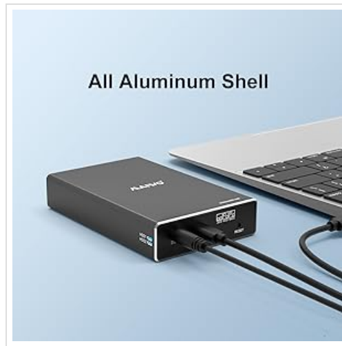
Image: A close-up view emphasizing the durable all-aluminum shell construction of the enclosure.