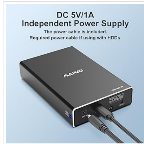
Image: The MAIWO enclosure with the independent DC 5V/1A power supply connected.