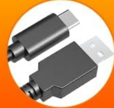
Image: Illustration of the two included data cables: Type-C to Type-C (Max 10Gbps) and Type-C to Type-A (Max 5Gbps).