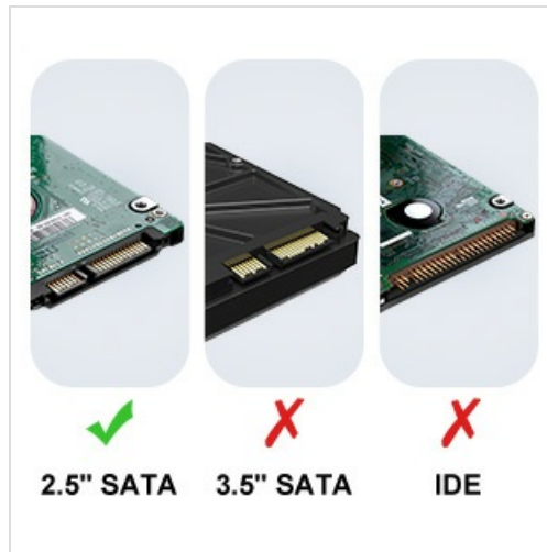
Image: Diagram confirming compatibility with 2.5-inch SATA drives, and incompatibility with 3.5-inch SATA and IDE drives.