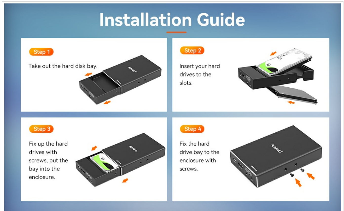
Image: Visual step-by-step guide for installing hard drives into the MAIWO enclosure.