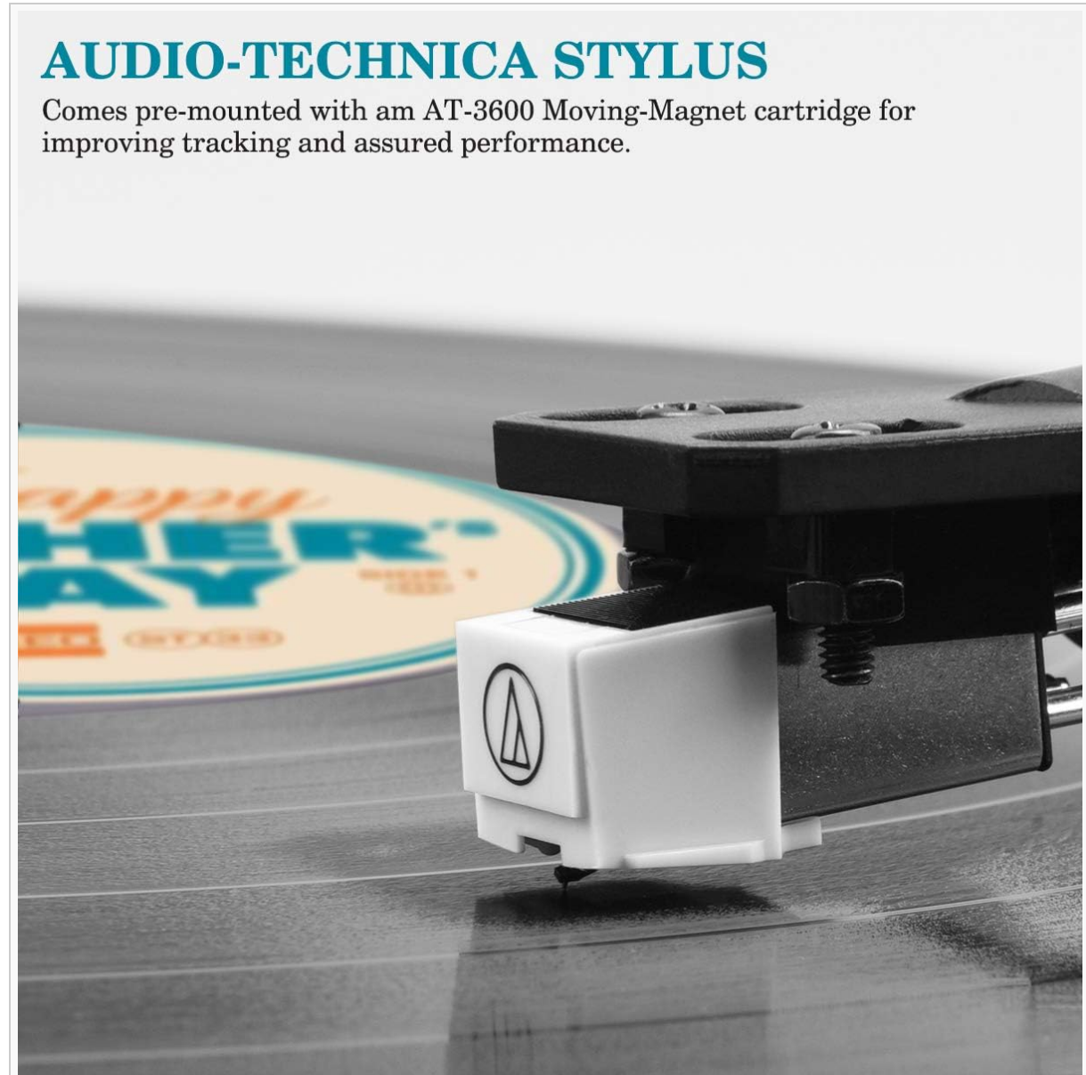
Figure 6: Audio-Technica Stylus

The stylus is a delicate component. Clean it periodically with a soft brush designed for stylus cleaning, brushing gently from back to front. Avoid touching the stylus with your fingers. A worn or damaged stylus can harm your records and degrade sound quality. Replace the stylus when necessary.