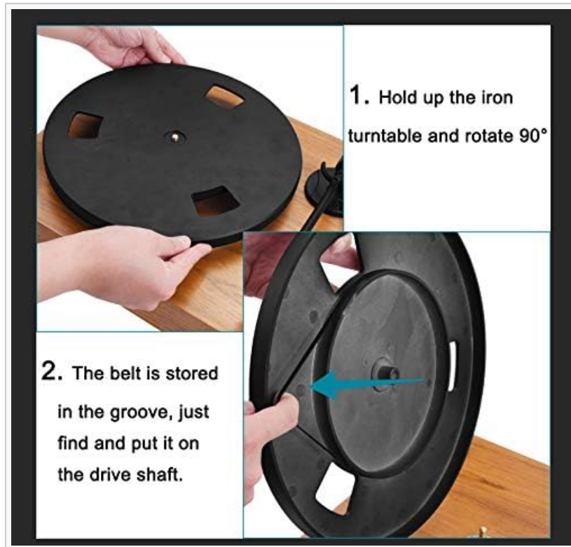
Figure 2: Belt Installation Steps