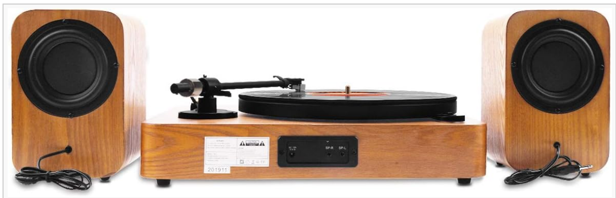
Figure 3: Rear Connections for Speakers

Connect the included dual 15-watt speakers to the turntable using the provided speaker cables. Ensure the left speaker is connected to the 'SP-L' output and the right speaker to the 'SP-R' output on the rear of the turntable.