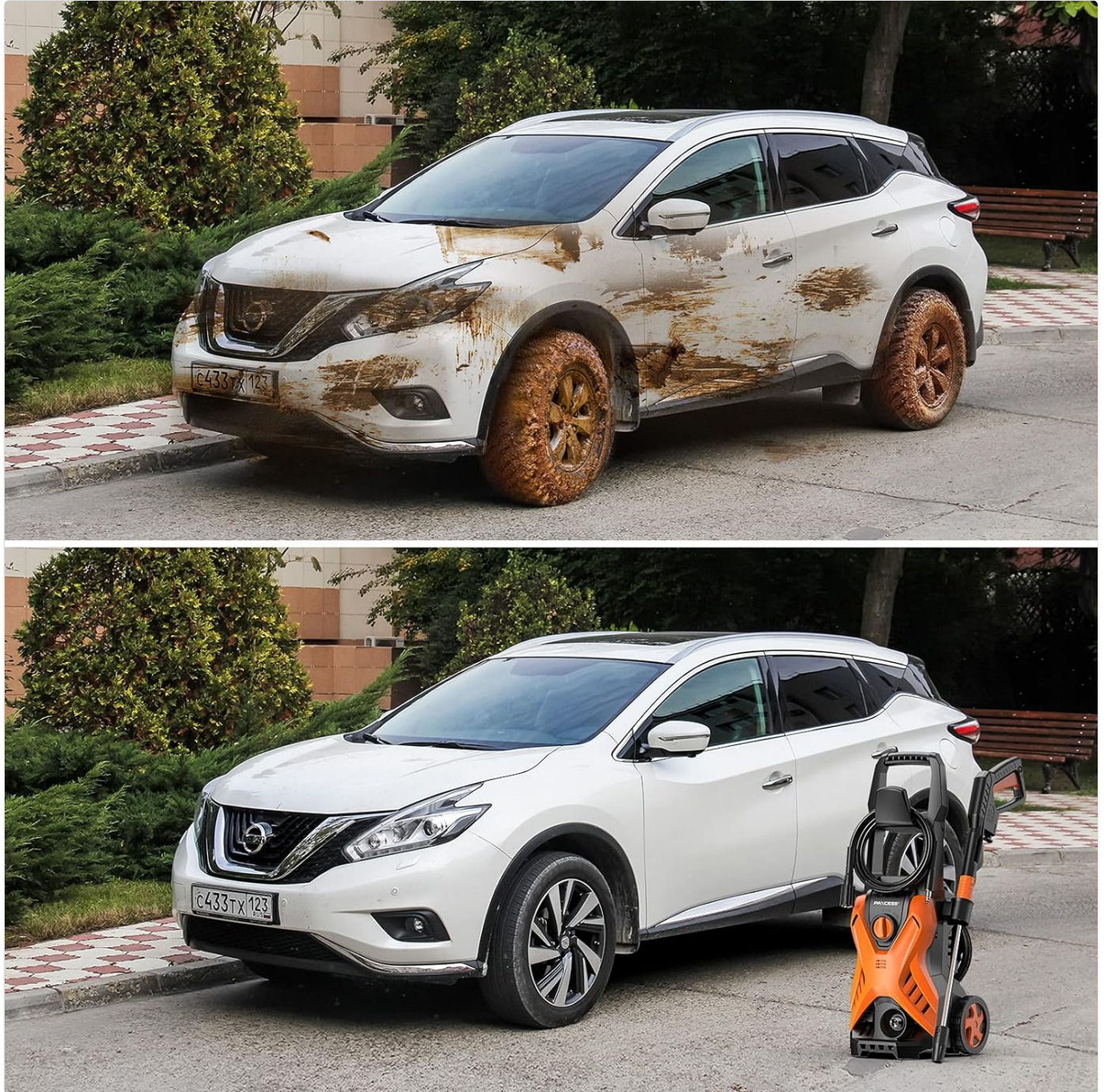
Figure 5.2: A visual comparison showing a muddy car before and after cleaning with the pressure washer, highlighting its effectiveness.