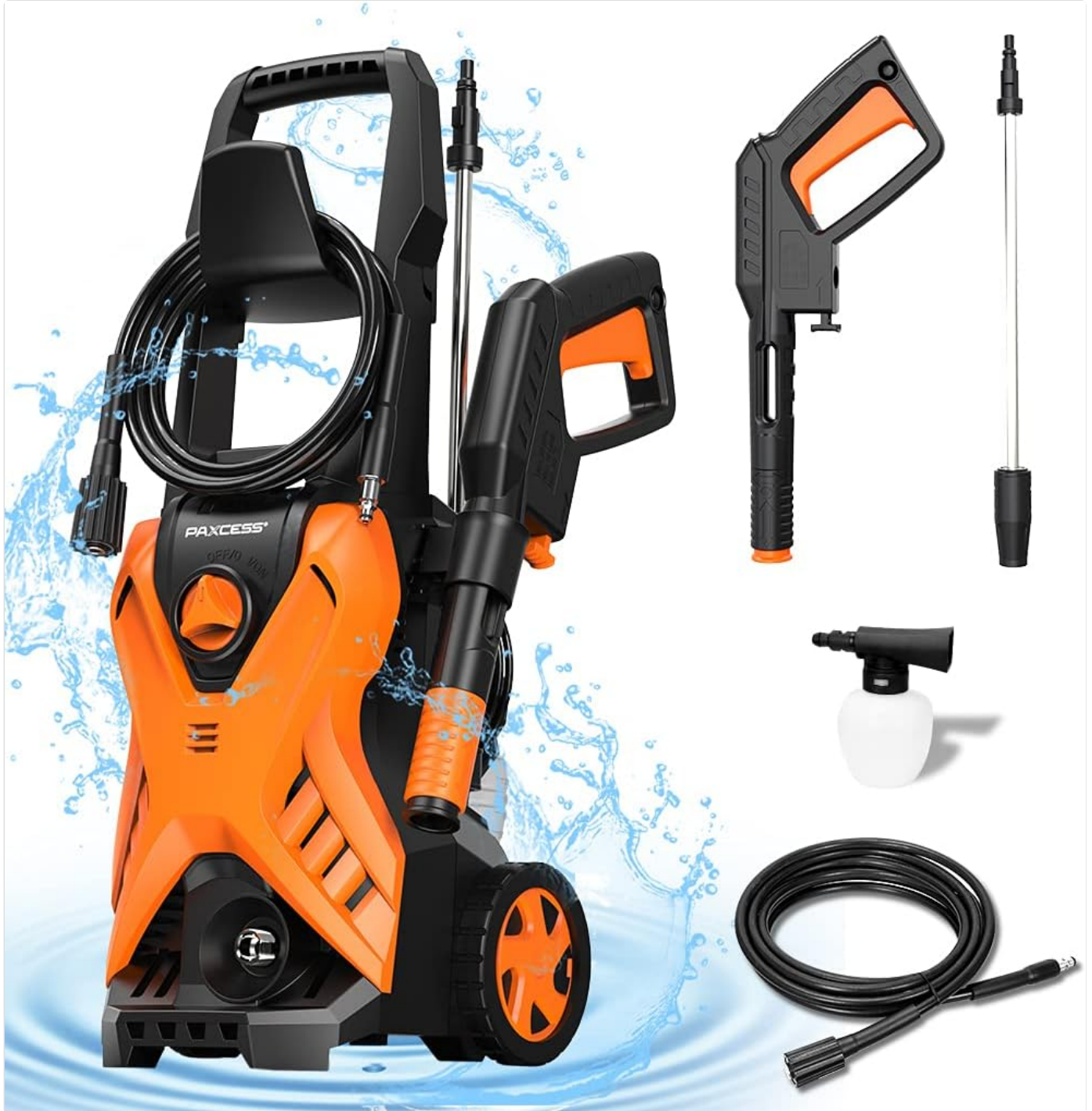
Figure 3.1: All components included with the PAXCESS Electric Power Washer. This includes the main unit, spray gun, lance, high-pressure hose, and foam cannon.

Carefully unpack all items and ensure you have received the following components. If any parts are missing or damaged, contact PAXCESS customer support.