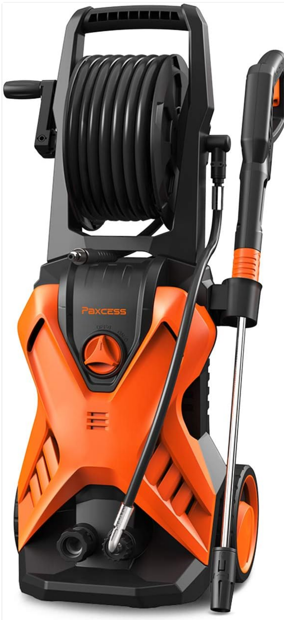
Figure 1.1: PAXCESS Electric Power Washer P3.2. This image shows the main unit with its integrated hose reel and spray gun holder.