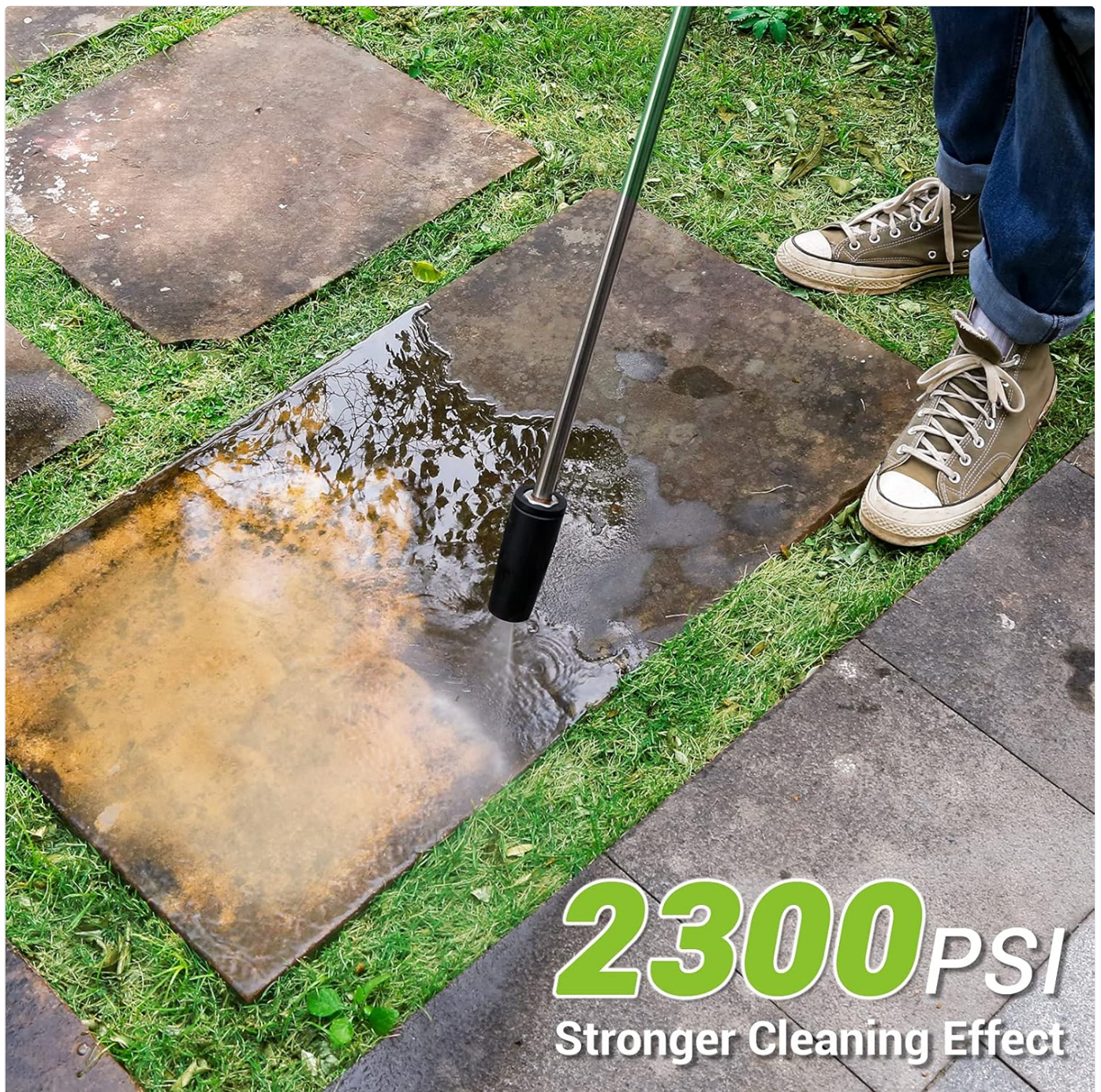
Figure 5.3: The pressure washer in action, cleaning a patio tile, demonstrating the 2300 PSI cleaning effect.