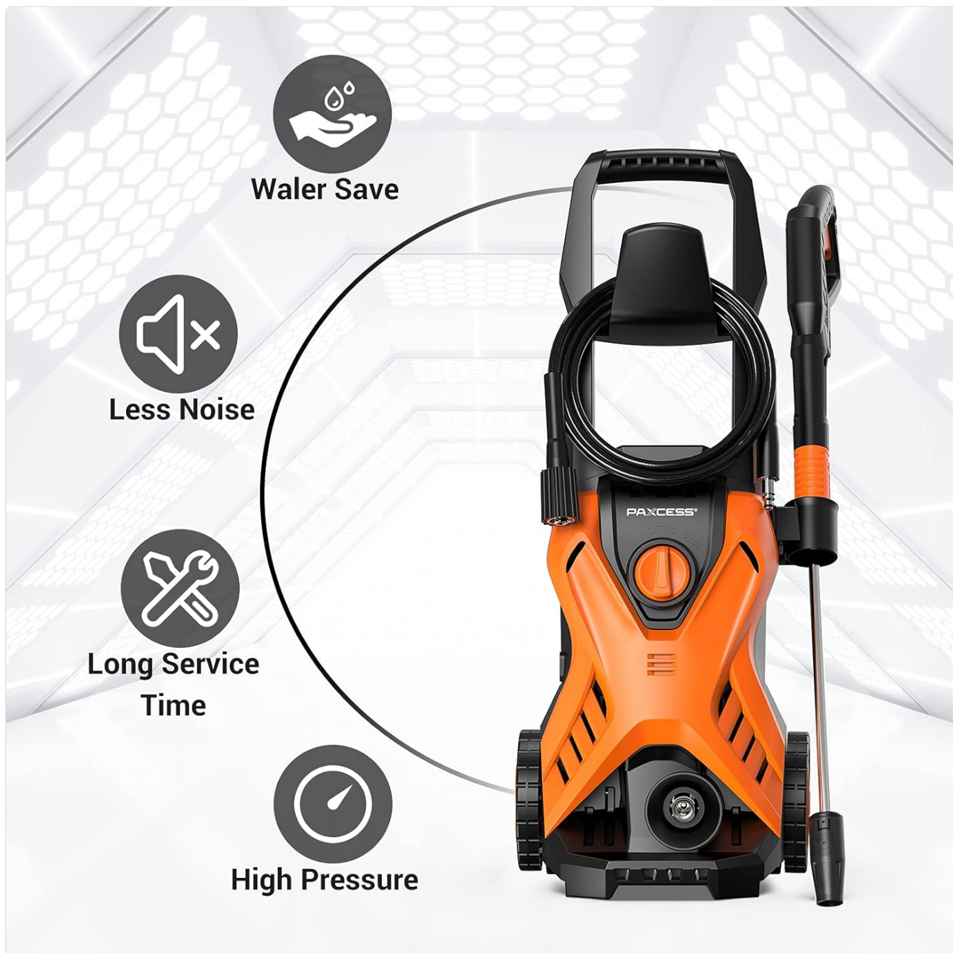
Figure 1.3: Icons highlighting product benefits: Water Save, Less Noise, Long Service Time, and High Pressure.