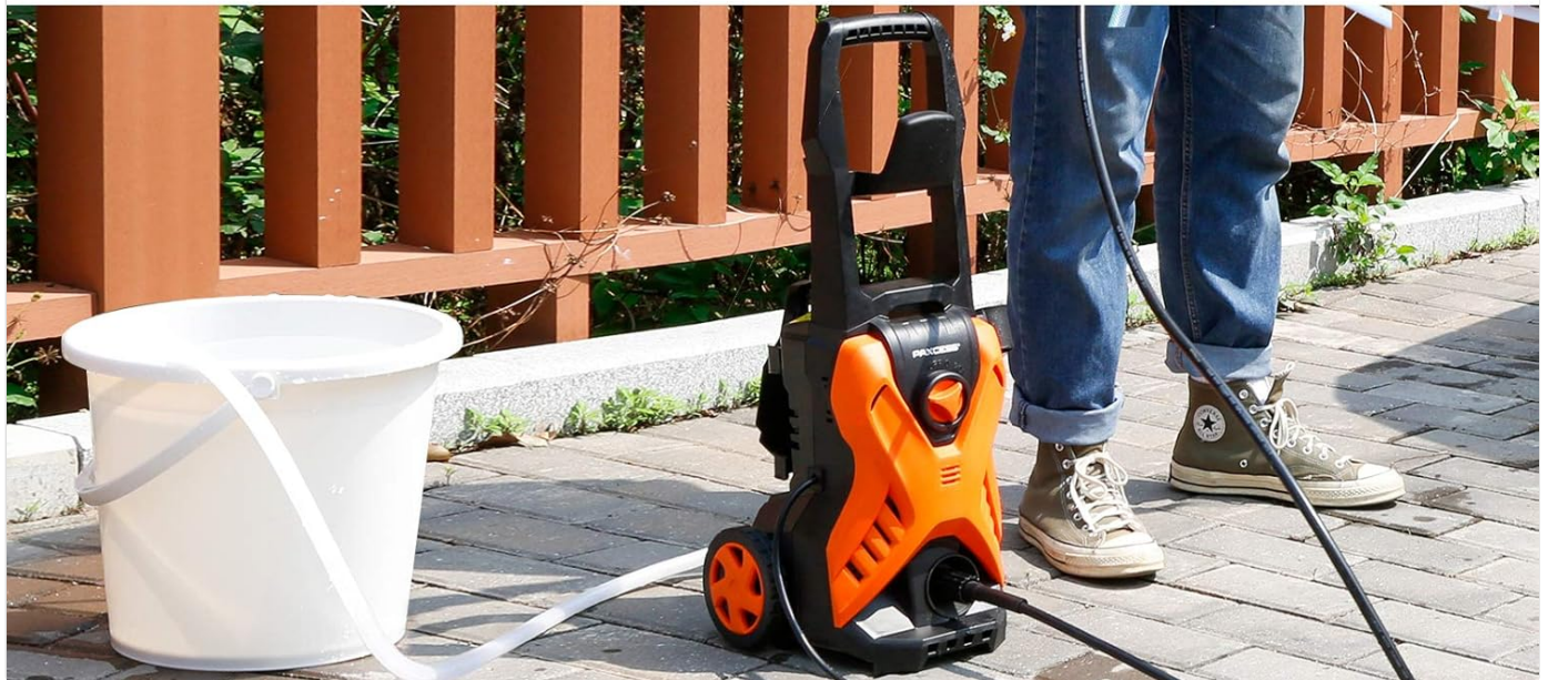
Figure 4.1: The pressure washer demonstrating its ability to draw water from a bucket, offering flexibility in water source.