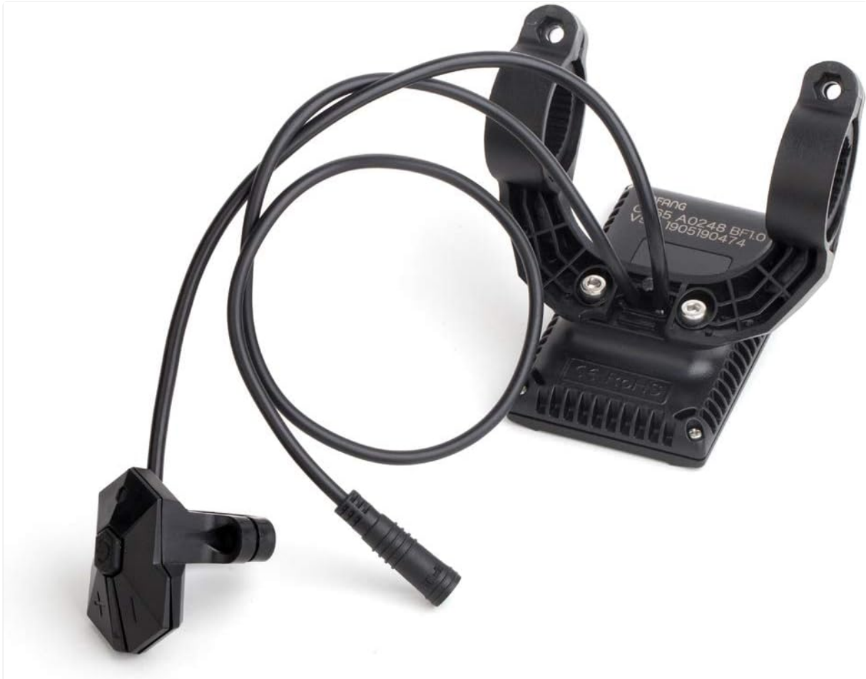
Figure 1: Bafang C965 LCD display unit with cables and mounting bracket.