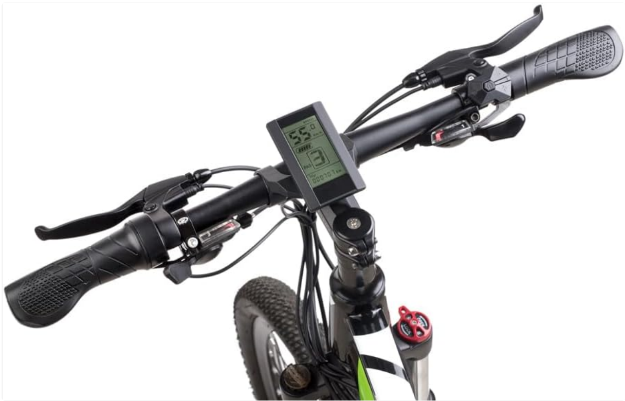
Figure 2: Bafang C965 LCD display mounted on an e-bike handlebar.