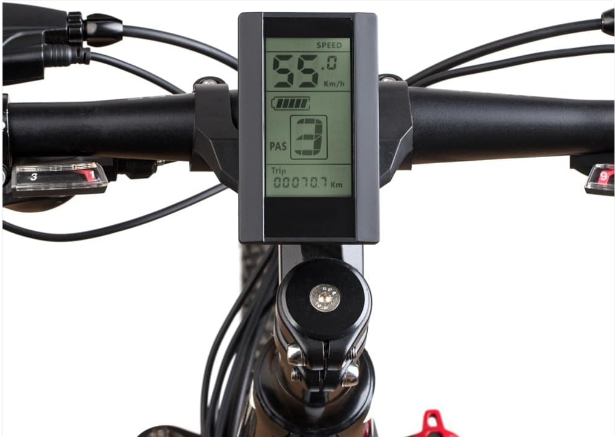
Figure 3: Bafang C965 LCD display showing active riding data.