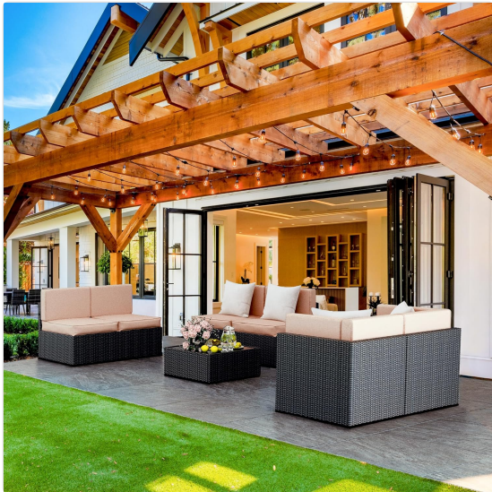
Image Description: A Pamapic 7-piece outdoor sectional furniture set placed under a stylish wooden pergola on a spacious patio. The beige cushions and black rattan blend seamlessly with the outdoor decor, offering a comfortable and inviting space for relaxation.

Image Description: The Pamapic 7-piece outdoor sectional furniture set displayed on a modern rooftop patio. The furniture, with its beige cushions and black rattan, is arranged to create a comfortable seating area amidst potted plants and a scenic outdoor view.