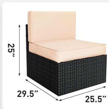
Armless Sofa * 4