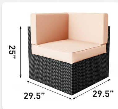
Corner Sofa * 2