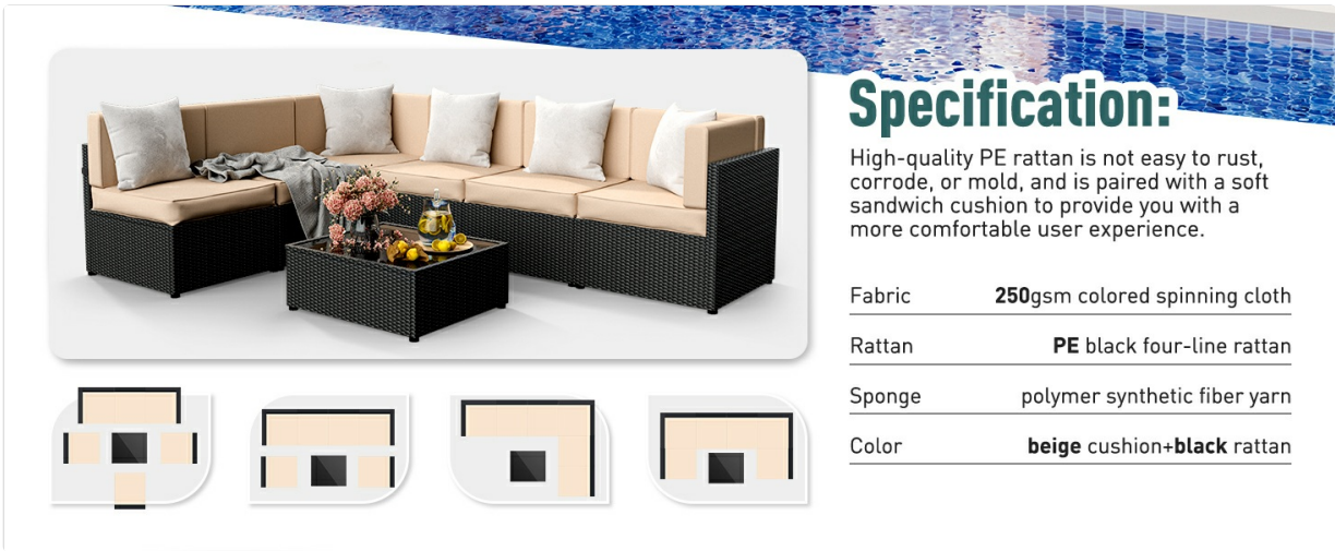
Image Description: A graphic detailing the specifications of the Pamapic outdoor rattan sectional sofa. It lists the fabric as 250gsm colored spinning cloth, rattan as PE black four-line rattan, sponge as polymer synthetic fiber yarn, and the color combination as beige cushion with black rattan.