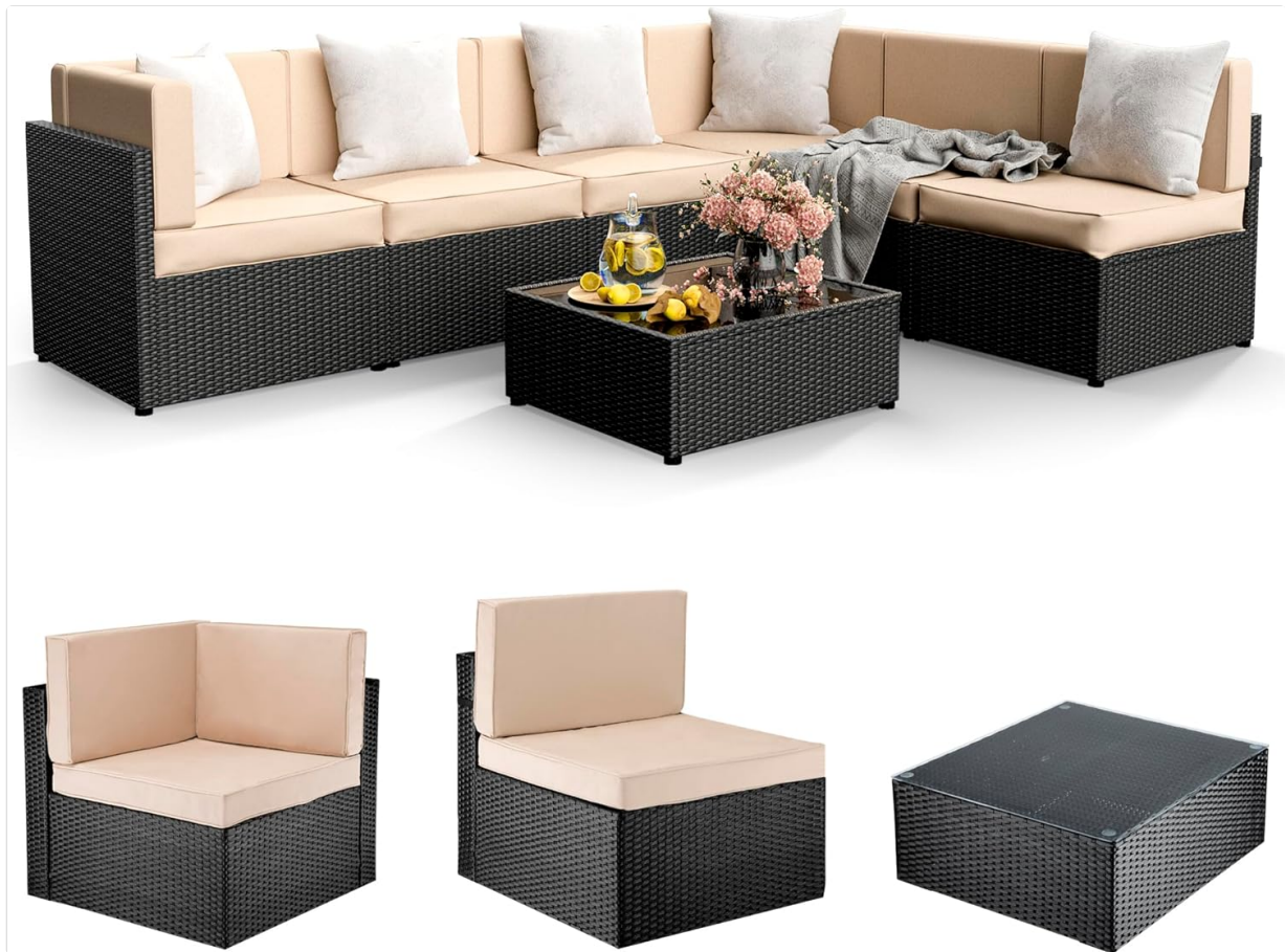
Image Description: A visual breakdown of the Pamapic 7-piece outdoor sectional furniture, showing two corner sofa units, four armless sofa units, and one coffee table with a glass top. This image helps visualize the individual components before assembly.