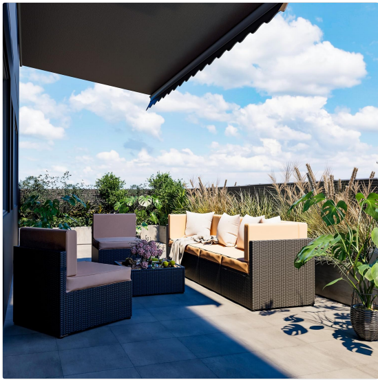
Image Description: The Pamapic 7-piece outdoor sectional furniture set displayed on a modern rooftop patio. The furniture, with its beige cushions and black rattan, is arranged to create a comfortable seating area amidst potted plants and a scenic outdoor view.