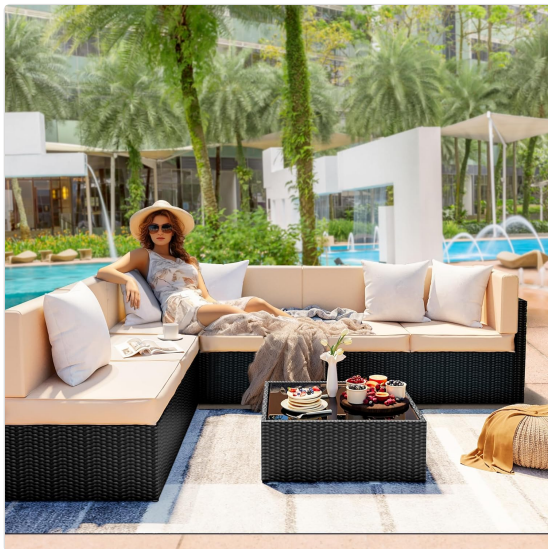
Image Description: A woman relaxing on the Pamapic 7-piece outdoor sectional furniture, positioned beside a swimming pool. The furniture is arranged in an L-shape, with beige cushions and a black rattan base, complementing the luxurious outdoor environment.

Image Description: A complete Pamapic 7-piece outdoor sectional furniture set, featuring beige cushions and black rattan, arranged in an L-shape on a modern patio. The set includes a coffee table and is surrounded by lush greenery, showcasing its aesthetic appeal in an outdoor setting.