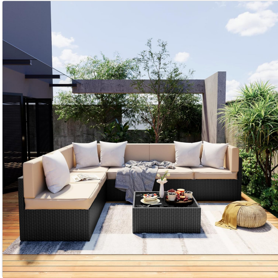
Image Description: A complete Pamapic 7-piece outdoor sectional furniture set, featuring beige cushions and black rattan, arranged in an L-shape on a modern patio. The set includes a coffee table and is surrounded by lush greenery, showcasing its aesthetic appeal in an outdoor setting.