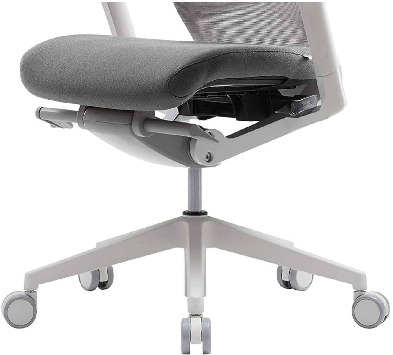
Figure 1.1: The SIDIZ T50 Ergonomic Home Office Chair in Grey, showcasing its modern design and mesh back.