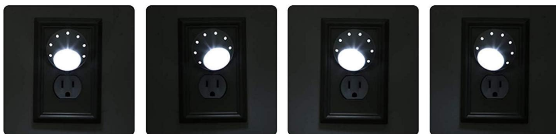
Figure 2.1: The night light features a 360-degree rotating head, allowing users to direct the light upwards, downwards, or to the side.