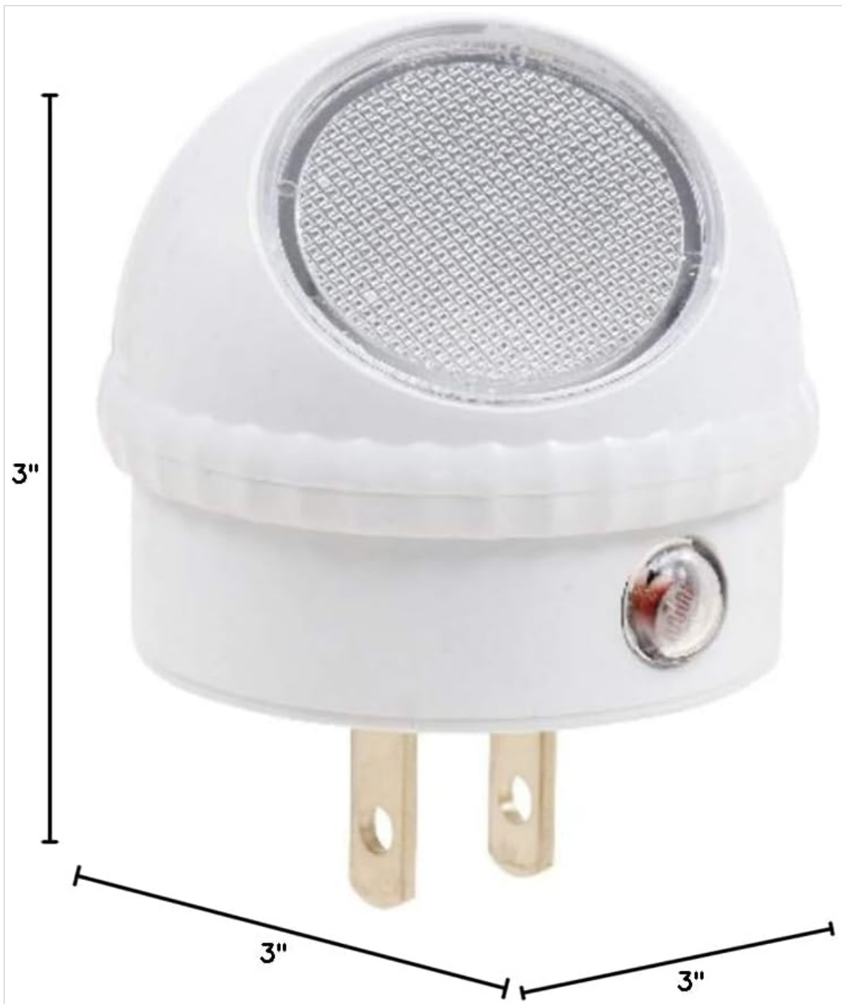
Figure 7.1: Detailed dimensions of the Intertek Automatic Plug-in Night Light.