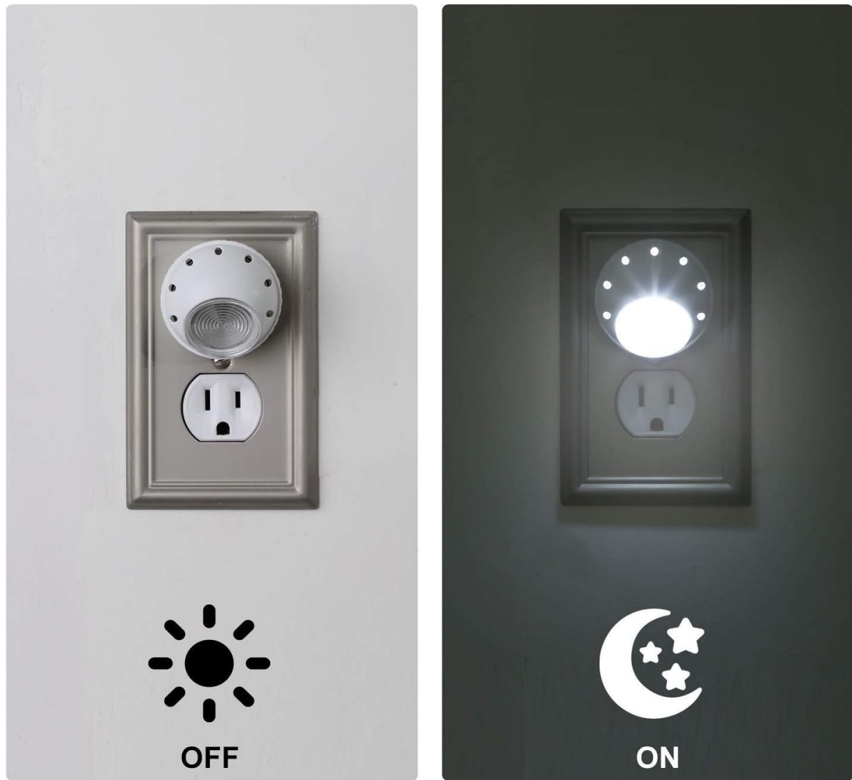
Figure 4.1: The night light features a dusk-to-dawn sensor, automatically illuminating when the environment darkens and turning off when it brightens.